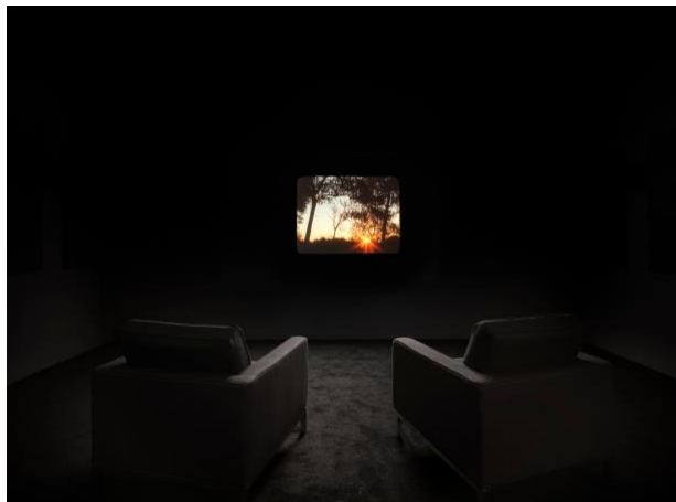
Tacita Dean, Pan Amicus, 2021. 16mm color film, optical sound; 31 min., continuous loop. Installation view, Marian Goodman Gallery, 2021. Courtesy of the artist, Frith Street Gallery, London and Marian Goodman Gallery, New York / Paris.

The subjects of the British-born, Berlin-based multimedia artist Tacita Dean's films have always had a distinctly Continental focus, from the former East Berlin television tower featured in Fernsehturm (2001) to the artists Joseph Beuys and Mario Merz. Yet in some of her more recent works, Dean has turned to documenting the sceneries, myths, and hidden treasures of Los Angeles. Among them are the landscape film Pan Amicus (2021) and Monet Hates Me (2021), a so-called exhibition in a box, both of which are currently on view at the Getty Center, where Dean served as artist in residence between 2014 and 2015. Although these were not Dean's first projects to focus on American mythology and landscape (her 2013 film JG , concerning a fictitious correspondence between the Land artist Robert Smithson and novelist J.G. Ballard, originated in the sound piece Trying to Find the Spiral Jetty from 1998; while her ambitious, dual synchronous film Antigone was released in 2018), they do document her earliest steps toward embracing a city, and its surrounding filmmaking industry, which she humorously refers to as "the beast." The experiences piqued her curiosity about L.A.'s unique sense of atmosphere, and she has since opened a studio in the West Jefferson area, dividing her time between there and Berlin.