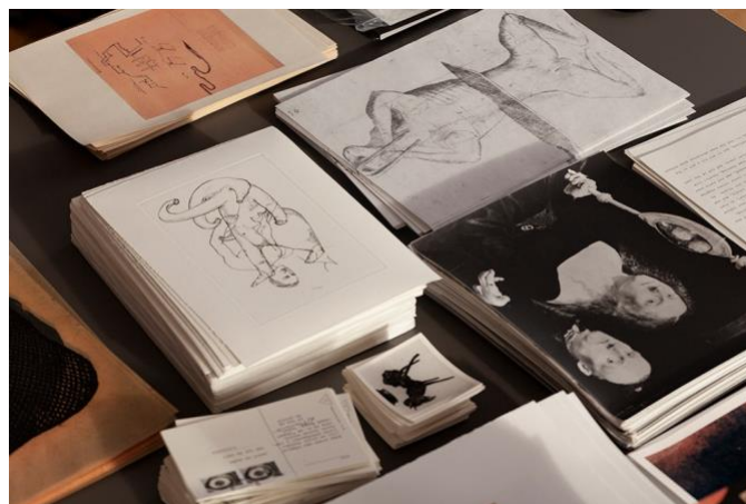
Tacita Dean, Monet Hates Me, 2021 (Detail). In production, Studio Tacita Dean, Berlin. Courtesy of the artist, Frith Street Gallery, London and Marian Goodman Gallery, New York / Paris.

When I first drove up to the Getty, I thought, “My God! It's like the afterlife.” It reminded me of Michael Powell's film A Matter of Life and Death [1946]. I still feel like that when I'm at the Getty. It's like you're just slightly above the clouds. There's just something about the air or atmosphere of it. So, I decided that I really wanted to play on the J. Paul Getty fantasy of this ancient land, and pretend that it's shot in ancient Greece. But the soundtrack to the Getty is the 405 [expressway]. So, I decided to make a fictional soundscape. And the funny thing is...I get asked, “Where is this filmed?” So, it does fool some people. I like sort of confusing them. But I think I confused the people at the Getty. I would cut out everything where there was a reference to the building. I didn't want it to be of the modern world.