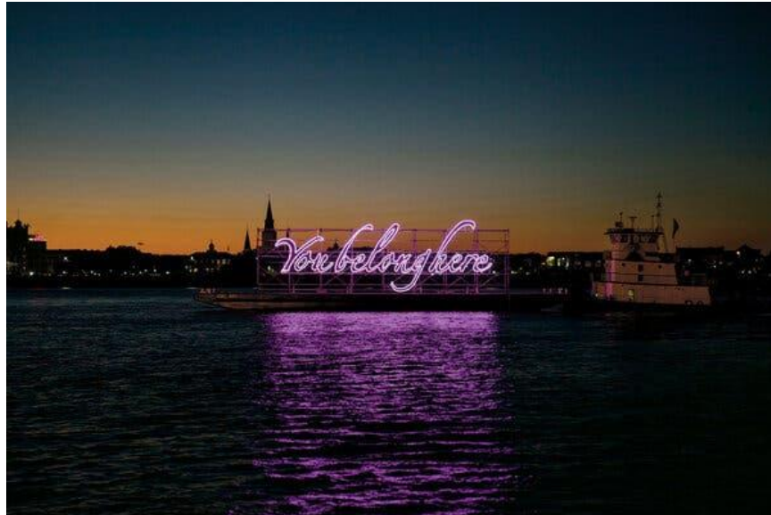
“You Belong Here” (2014), a neon installation on a barge that sailed down the Mississippi River in New Orleans during “Prospect.3: Notes for Now,” a citywide exhibition there in 2014.