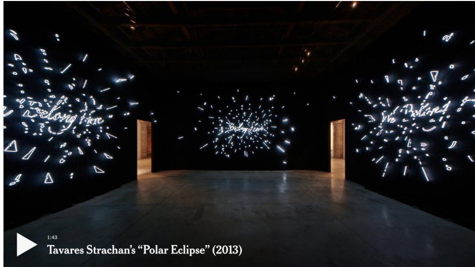
An installation view of Strachan's "Polar Eclipse" exhibition representing the Bahamas at the 2013 Venice Biennale. Credit: Courtesy of the Artist. Video by Tom Powel Imaging

The North Pole is more of an idea than a real place. The mathematical point might exist, but the spot where all lines of longitude converge occurs on a shifting ice cap that is constantly splitting, melting and reforming itself. Planting a flag at the Pole was a dream that consumed countless explorers who did not account for the fact that by the time they got one upright, it would be in the wrong spot. Just standing at the pole for any amount of time is an unattainable quest — which is partly why Strachan wanted to try. "It's the truth about most epic pursuits: At the root of it is absurdity," he said. The collision of human ambition and elusive gratification that the pole represents "is central to everything that I'm thinking about."