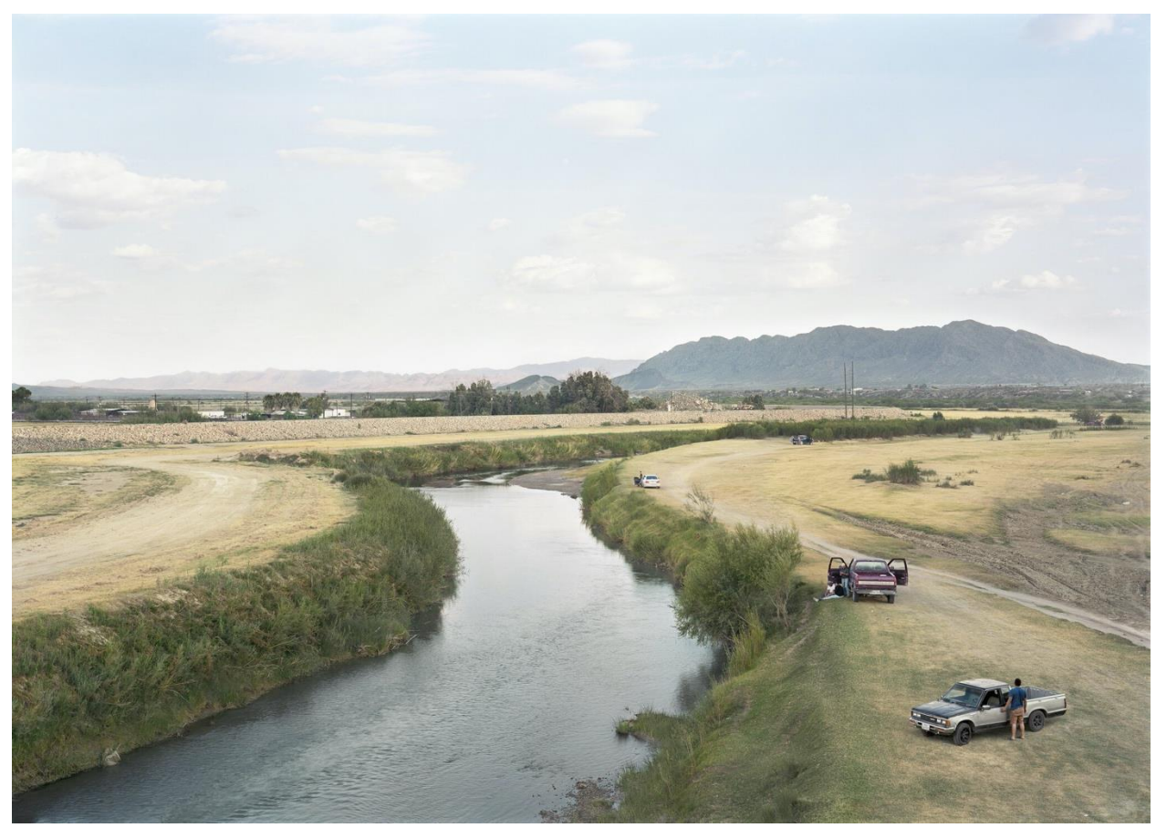
"Cars along the Rio Grande, U.S.-Mexico border, Ojinaga, Mexico, 2019."