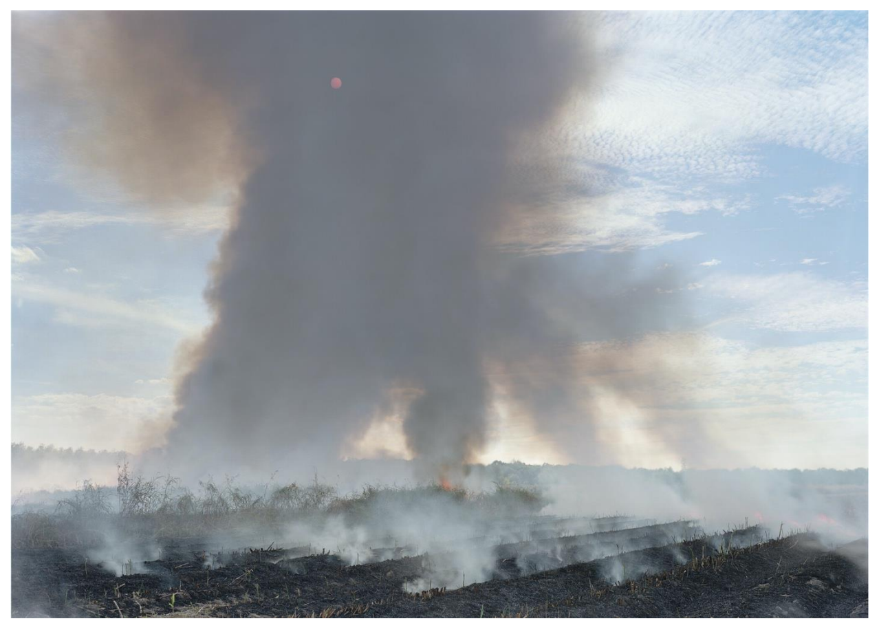
"Sugar Cane Field, November 5, Houma, Louisiana, 2016."