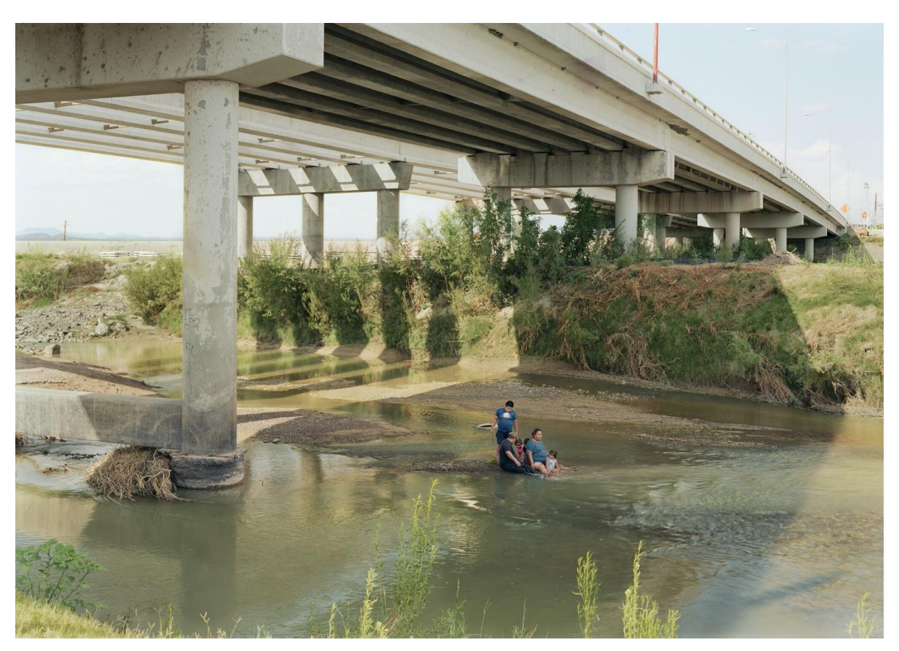
"Family Under the Presidio-Ojinaga International Bridge, Texas-Mexico Border, 2019."