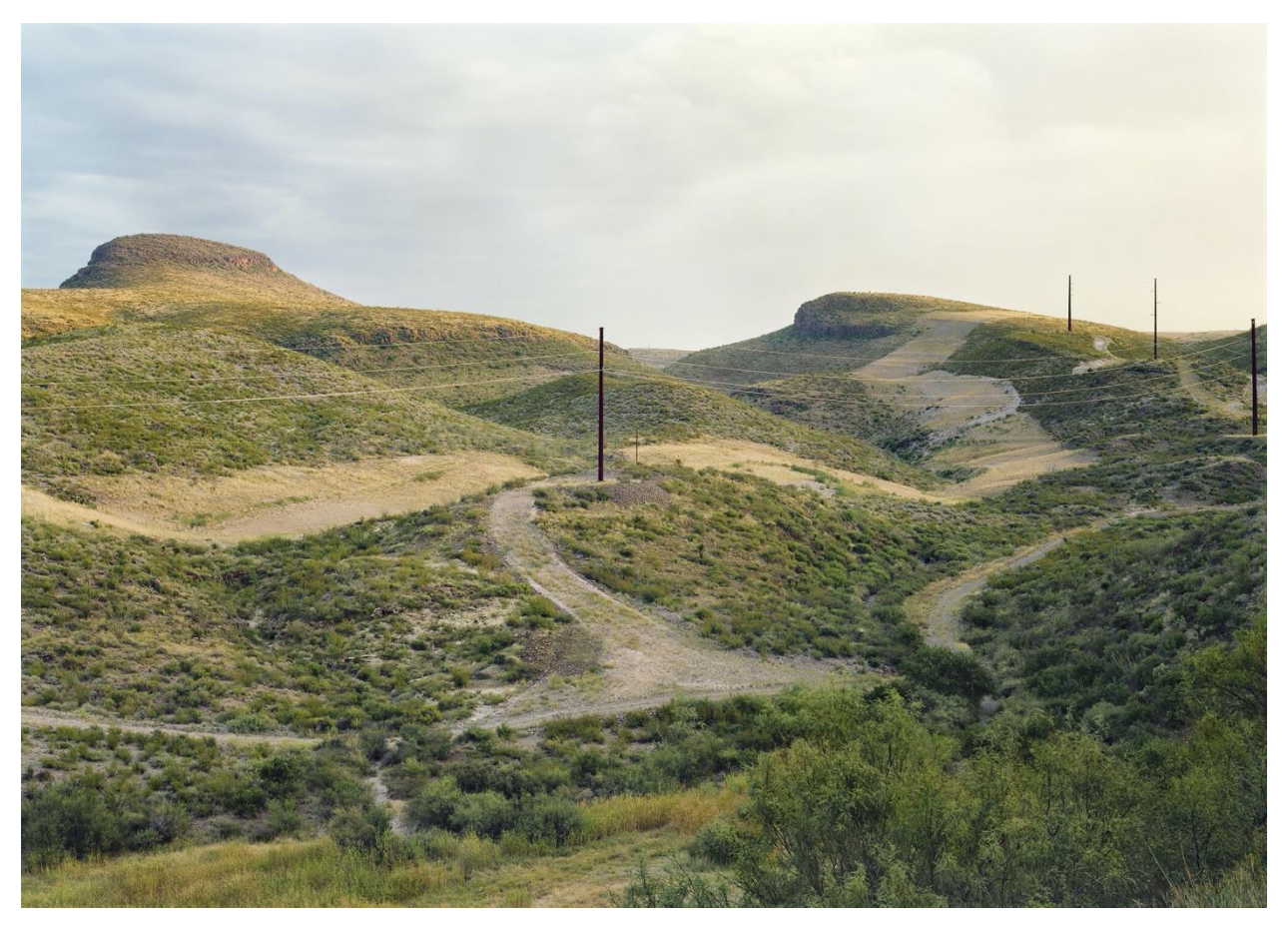
"Land Scars From the Trans-Pecos Pipeline, Marfa, Texas, 2019."