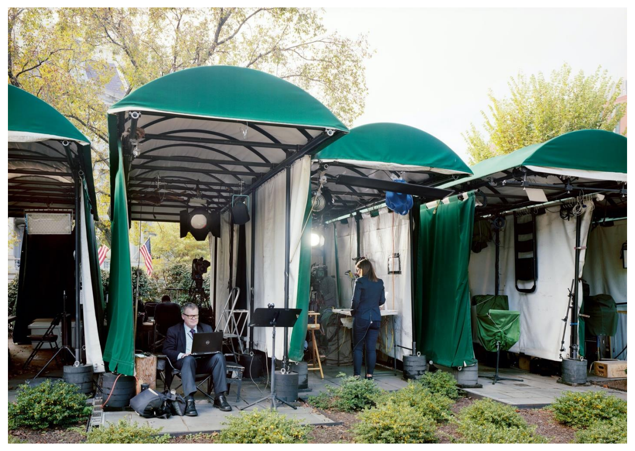
"Correspondent From Al Jazeera English Language Channel and Presenter for Al Jazeera Arabic Language Channel, The White House, Washington, D.C., 2020."