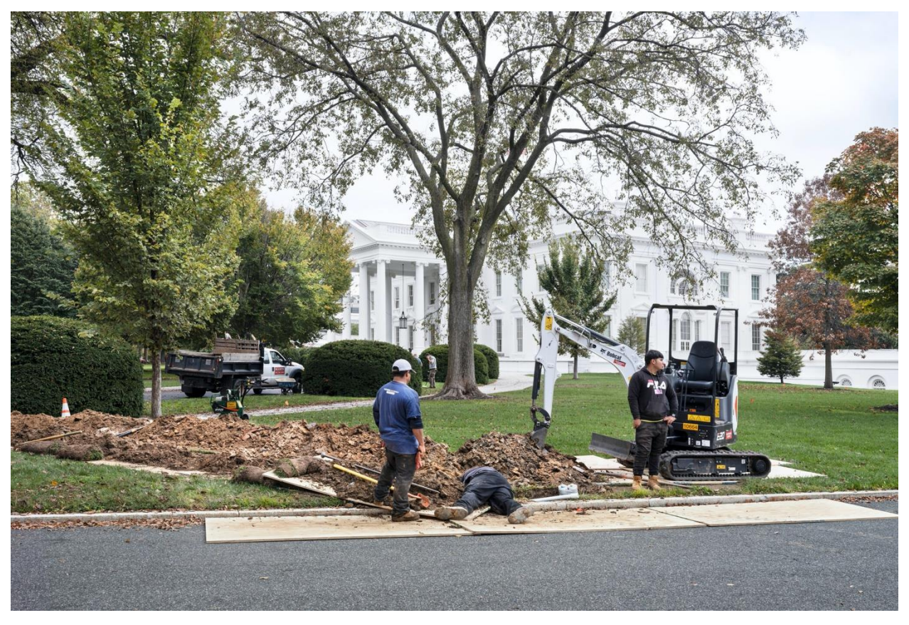
"Reinstallation of the Irrigation System, White House North Grounds, Washington, D.C., 2020."