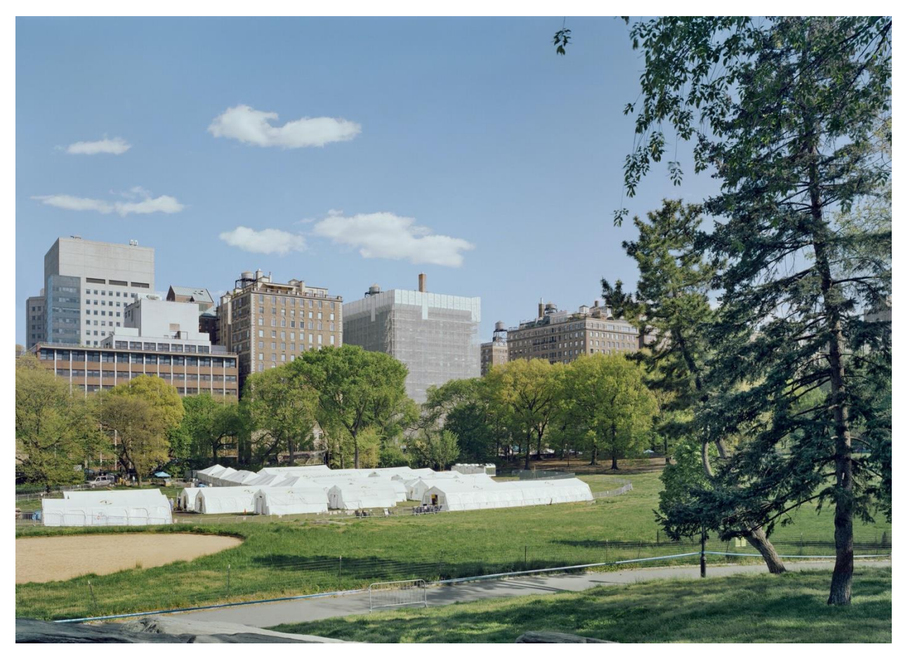
"Field Hospital Tents, Central Park, New York, N.Y., 2020."