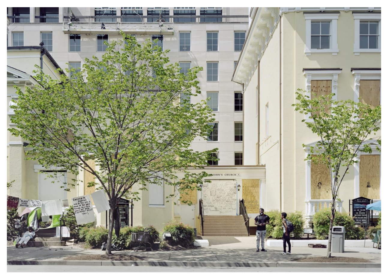
"St. John's Church, Lafayette Square, Washington D.C., 2020."