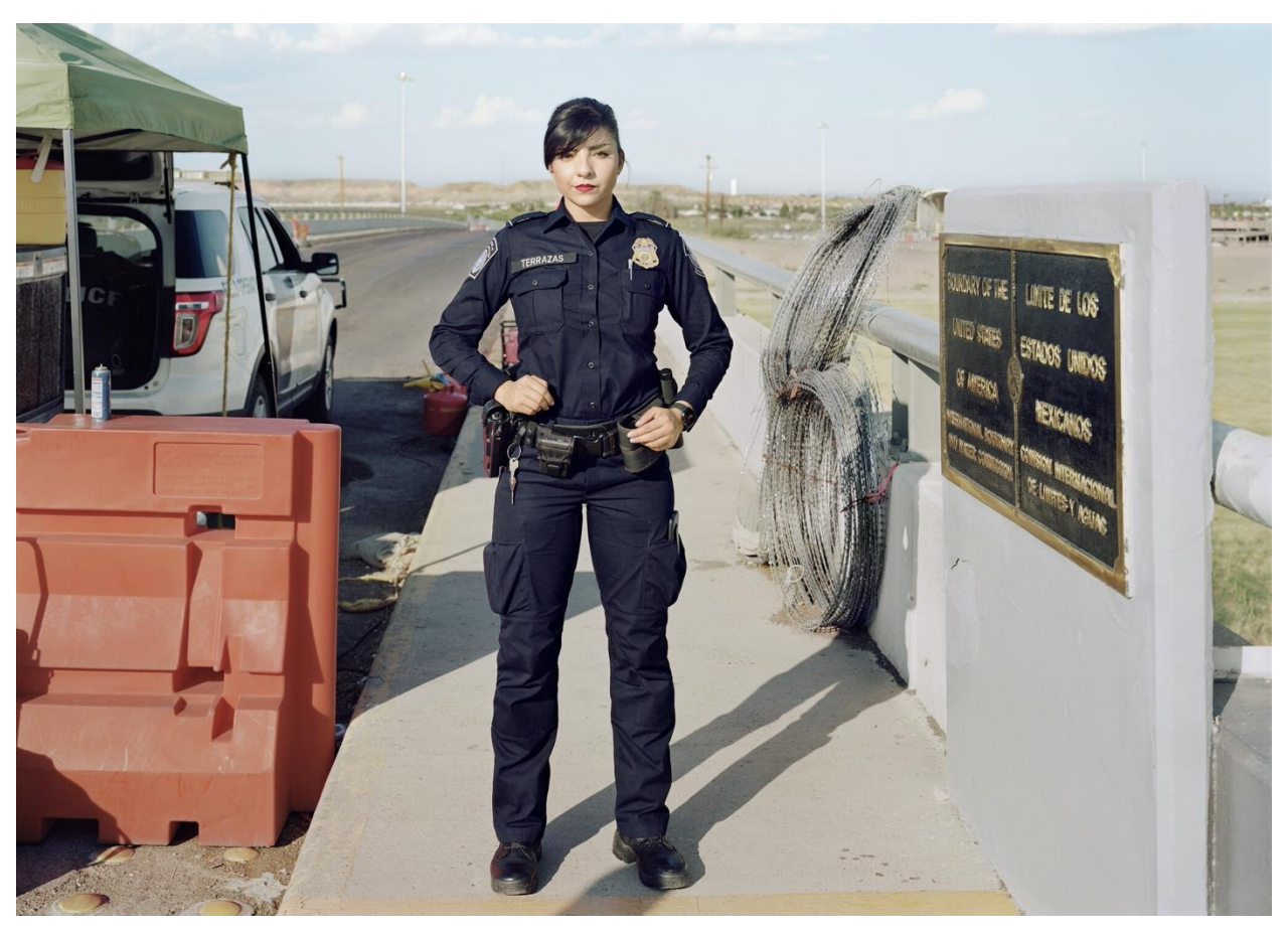
\hbox{``U.S. Customs and Border Protection Officer, Presidio-Ojinaga International Bridge, 2019.''}