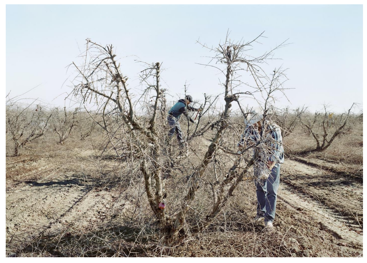
"Migrant Workers Pruning Pomegranate Trees, Mendota, California, 2018."