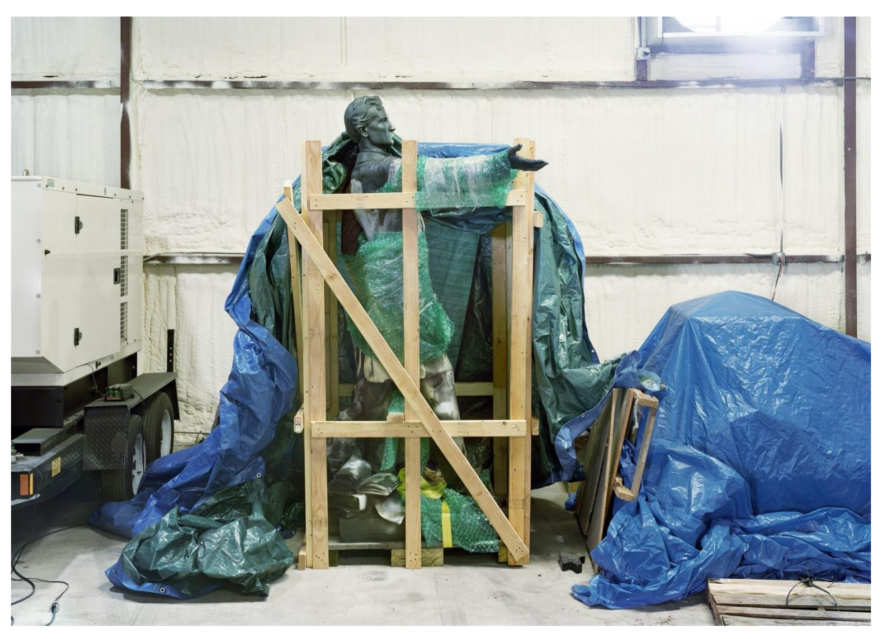
\hbox{``Jefferson Davis Monument, Homeland Security Storage, New Orleans, Louisiana, 2017.''}