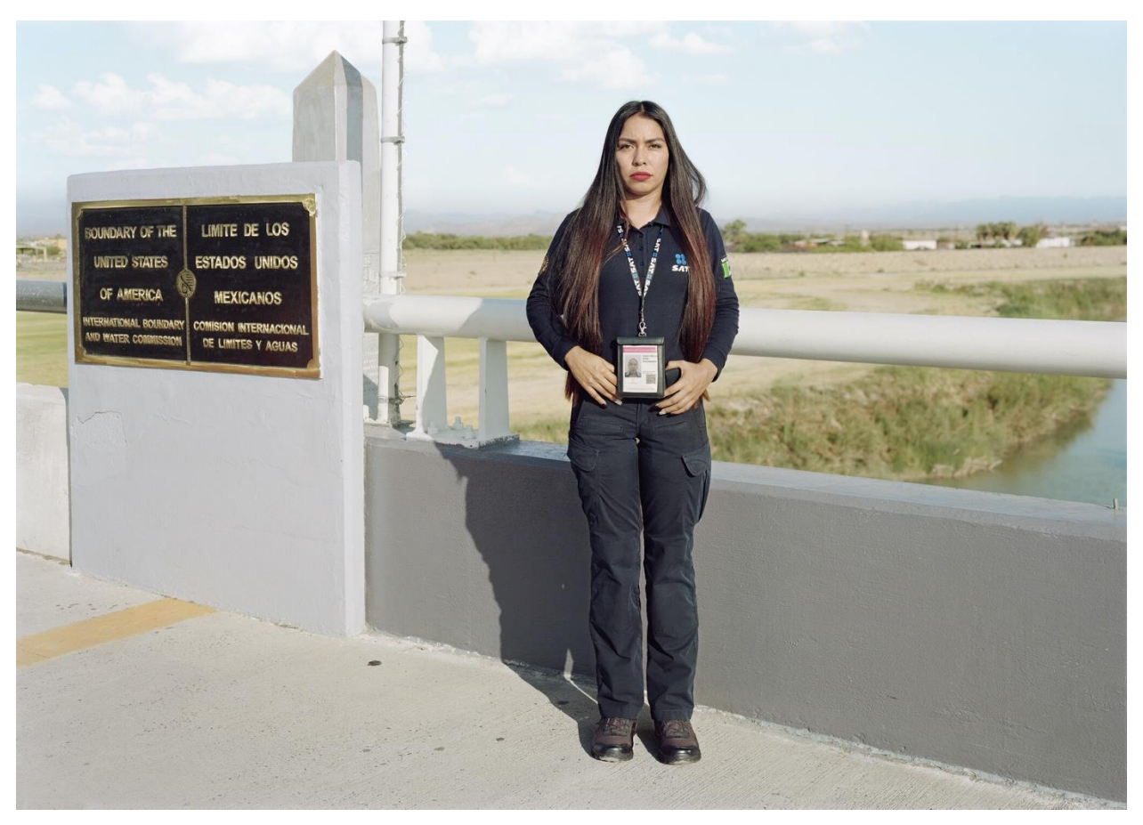
\hbox{``Mexico Customs and Border Protection Officer, Presidio-Ojinaga International Bridge, Ojinaga, Mexico, 2019.''}

Second through sixth images: An-My Lê for The New York Times; all other images courtesy of Marian Goodman Gallery.