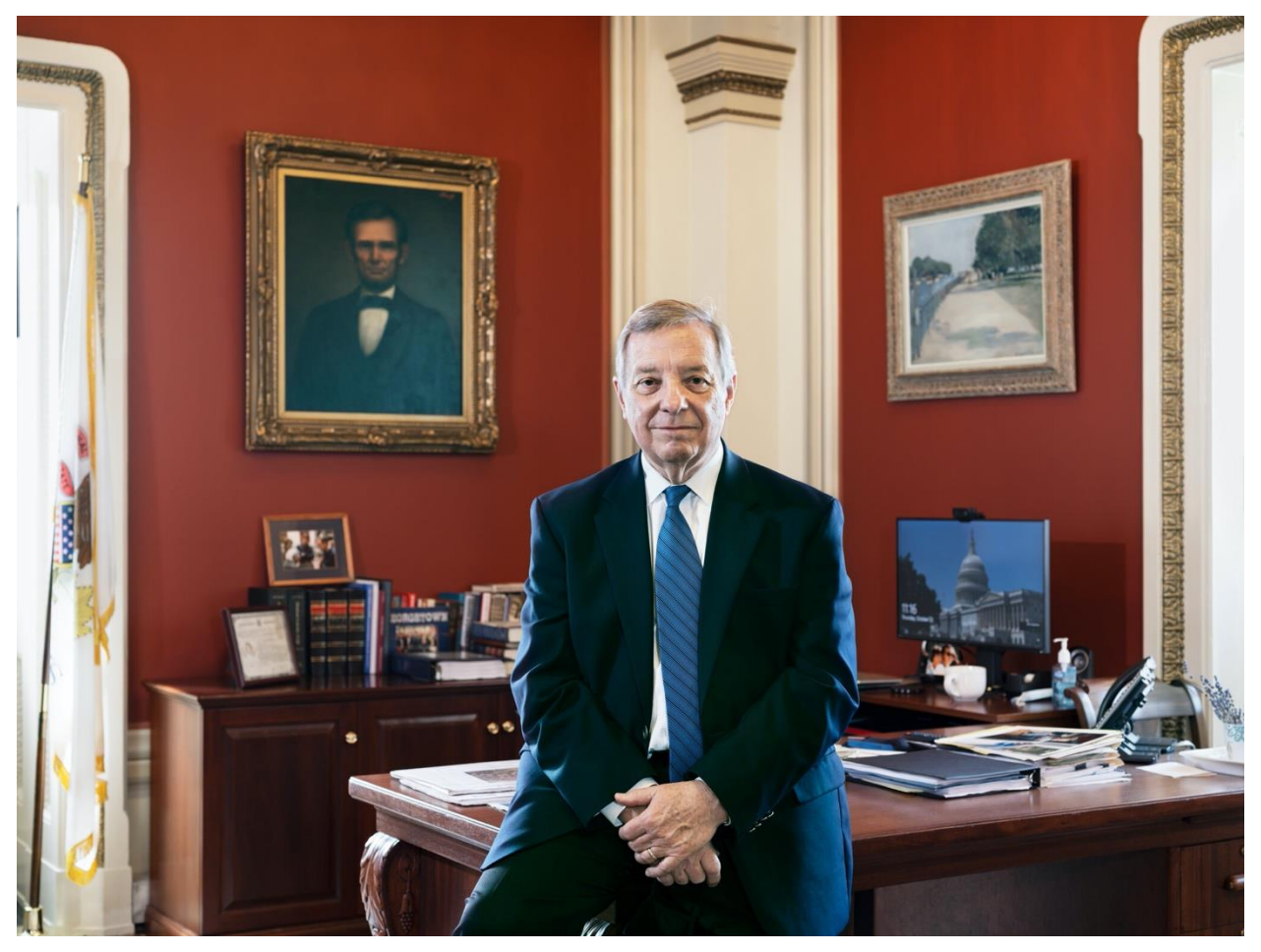
"Senator Dick Durbin, the Minority Whip, in his Capitol Office, Washington, D.C., 2020"