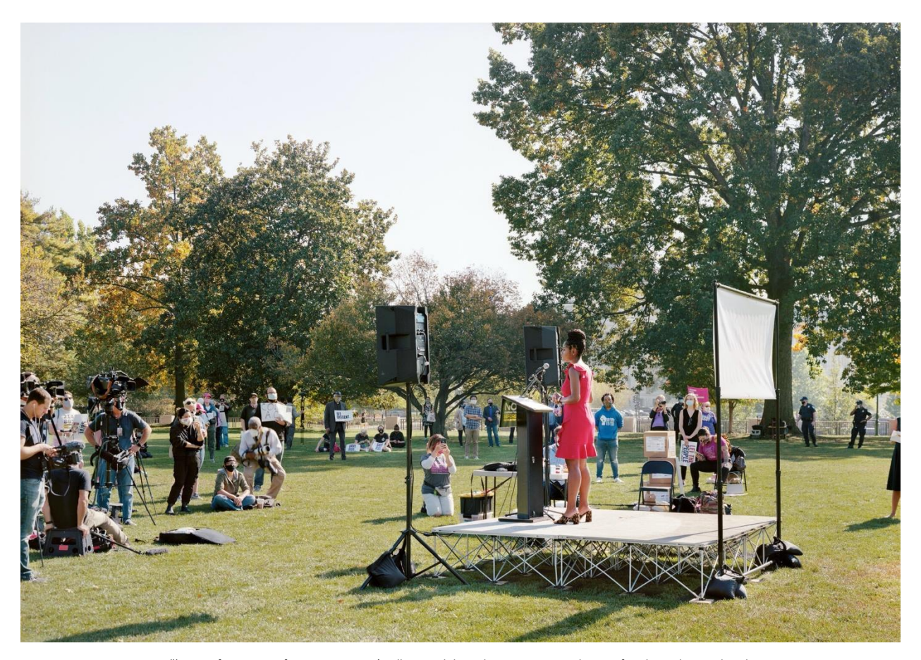
"'No Confirmation Before Inauguration' Rally Speech by Volunteer Patient Advocate for Planned Parenthood, U.S. Capitol Grounds and Arboretum, Washington, D.C., 2020."