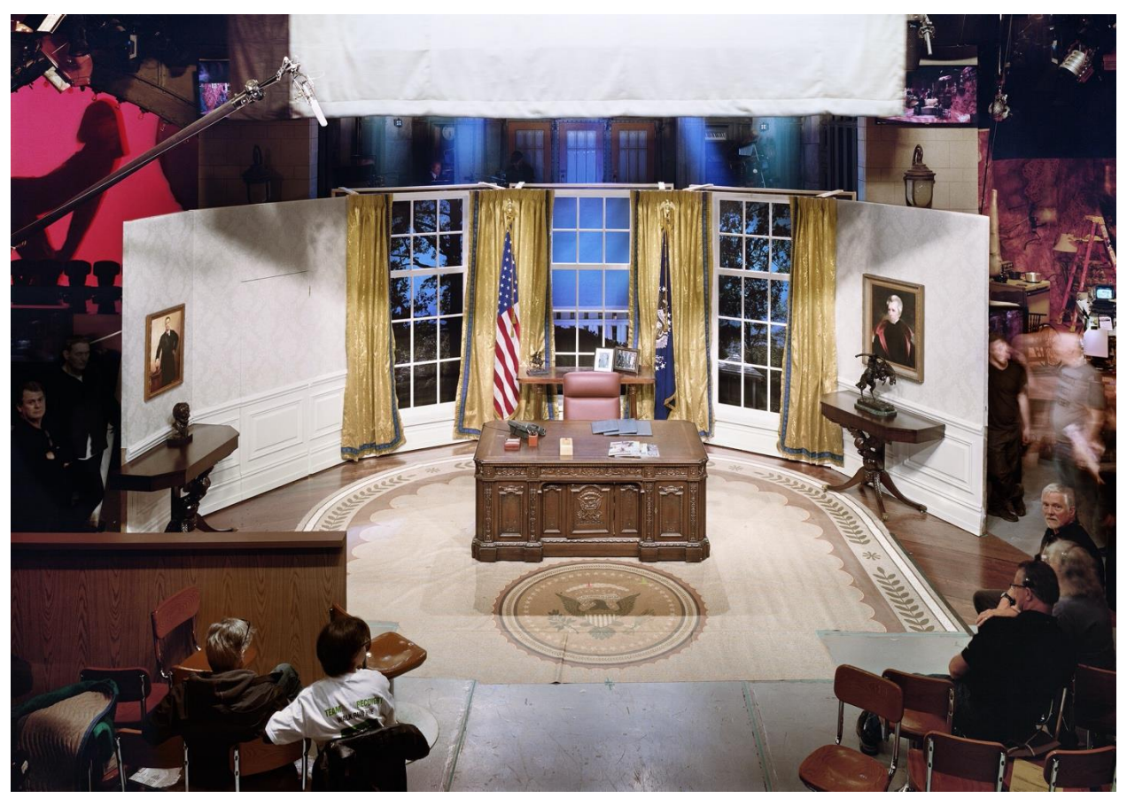
"Oval Office Set, 'Saturday Night Live,' NBC Studios, New York, N.Y., 2018."