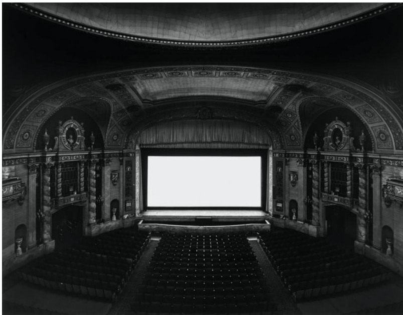
"U.A. Walker, New York," 1978, from a series of photos of darkened theaters exposed by light bouncing off the screen as a movie plays. Here, the shutter was open for the entirety of "Citizen Kane." Credit: Hiroshi Sugimoto and Gallery Koyanagi

There's some of that same complexity in his series "Theaters," mostly shot from the rear of old picture palaces. After arranging to have a feature screened just for him, he'd expose his film for the movie's entire running time. In the final images, the theater's screen washes out to a brilliant white; the light that bounced off it as the movie ran spreads an elegant radiance across the hall's lavish décor. At first, the photo seems to reveal nothing but serenity and order and a glow of nostalgia for long-gone moviegoing — until you discover that all this peace derives from a screen filled with the turmoil of films such as "Friday the 13th" and "The Shining." These are the contradictions that are the hallmarks of Sugimoto's landmark photography.