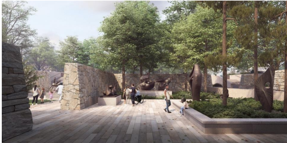
In the Hirshhorn’s sculpture garden, Sugimoto’s plan would use archaic stacked stones to create outdoor “galleries” for modernist works by Henry Moore and Barbara Hepworth. But old stone walls speak of ideals that are new to the Hirshhorn.

That last role has been producing few chuckles over the last few years.