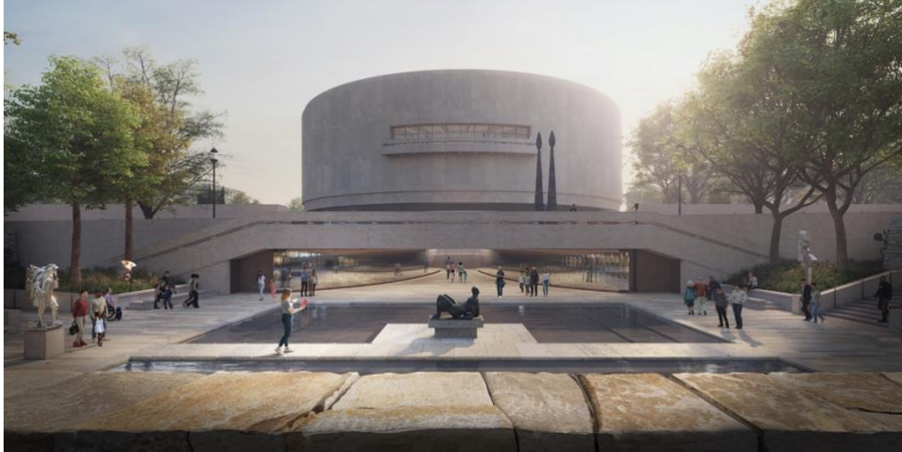
A rendering of Sugimoto's new water feature, with a Henry Moore piece occupying a platform designed for performance art. Beyond it, a reopened underground passage connects the sculpture garden to the Hirshhorn's plaza.

Chiu says she turned to Sugimoto for the good will his garden was likely to extend to other artists, as a space where they would want their work to appear. The peculiar result is that, in its service to other artists, the garden seems to lower the bar for its own artistry. A stacked-stone wall, no matter how “nice,” seems unlikely to do much on the cognitive front.