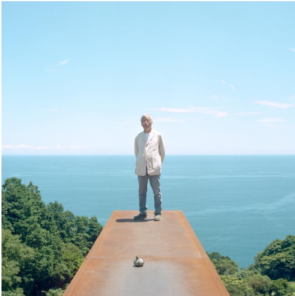
At the Enoura Observatory in Japan, the artist Hiroshi Sugimoto curated a collection of contemporary buildings and stone relics on a mountaintop. This pavilion lines up with the rising sun on the winter solstice.