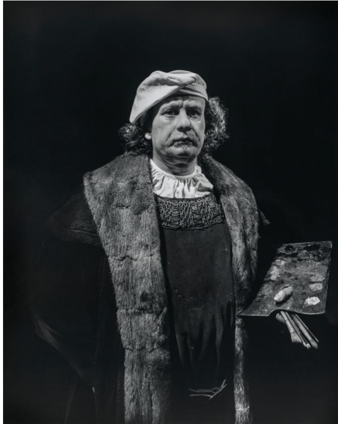
"Rembrandt," 1999. Sugimoto's waxworks photos are pictures of wax sculptures of people based on photographs of them. Try to unpack them and you end up in a hall of mirrors.