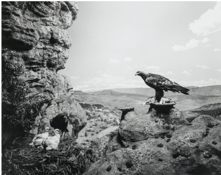
"Golden Eagle," 1994. One of the artist's "twisted-mind" conceptual photos that turn out to show stuffed beasts in museum vitrines — in this case, at the former Denver Museum of Natural History. Credit: Hiroshi Sugimoto and Gallery Koyanagi

Sugimoto is not happy to have his artist's vision put to the test: "Do you ask Picasso, 'I don't like this blue color. Let's make it red'?" He sees stacked stone as fundamental to his concept, explaining it as a pre-modern surface that will show off the modernity of the sculptures displayed in front of it. He has even threatened to pull out if his new walls don't get a green light. He smiles broadly at the idea of being fired: "I can be kicked off; that's fine." Why engage an artist at all, he asks, if the goal is to have a garden that stays mostly unchanged?