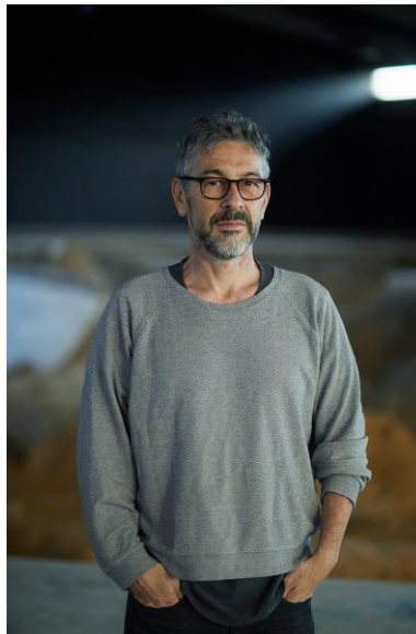
Pierre Huyghe