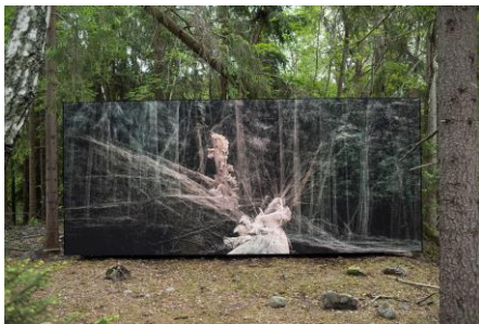
Pierre Huyghe's Variants (2021-ongoing)

He discusses his early interest in the “multiplicity of things” in Yves Tanguy and Hieronymus Bosch; his admiration for artists today, including Daniel Buren and three previous guests on A brush with... , Mark Leckey, Philippe Parreno and Dominique Gonzalez-Foerster; his response to the musical works of John Cage; and his 1990s projects exploring the cinema of Pasolini and Hitchcock, among others. Plus, he gives insights into his daily studio life and answers the ultimate question: what is art for?