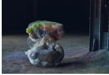
Pierre Huyghe's After UUmwelt (2021).

Courtesy of the artist; Esther Schipper, Berlin; Galerie Chantal Crousel, Paris; Marian Goodman Gallery, New York; Hauser & Wirth, London.