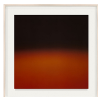
Opticks 034 , 2018 Chromogenic print Neg. # 27.034-L Image: 47 x 47 in. (119.4 x 119.4 cm) Frame: 60 x 60 in. (152.4 x 152.4 cm) Edition of 1 plus 1 artist's proof (24594)