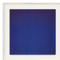
Opticks 031 , 2018 Chromogenic print Neg. # 27.031-L Photo: 47 x 47 in. (119.4 x 119.4 cm) Frame: 60 x 60 x 3 in. (152.4 x 152.4 x 7.6 cm) Edition of 1 plus 1 artist's proof (24329)