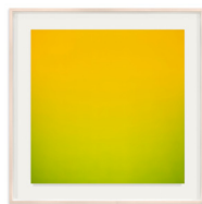
Opticks 068 , 2018 Chromogenic print Neg. #27.068 Image: 47 x 47 in. (119.4 x 119.4 cm) Frame: 60 x 60 in. (152.4 x 152.4 cm) Edition of 1 plus 1 artist's proof (24688)