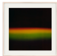
Opticks 094 , 2018 Chromogenic print Neg. # 27.094-L Image: 47 x 47 in. (119.4 x 119.4 cm) Frame: 60 x 60 in. (152.4 x 152.4 cm) Edition of 1 plus 1 artist's proof (24592)