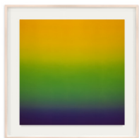
Opticks 151 , 2018 Chromogenic print Neg. # 27.151-L Image: 47 x 47 in. (119.4 x 119.4 cm) Frame: 60 x 60 in. (152.4 x 152.4 cm) Edition of 1 plus 1 artist's proof (24598)