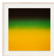
Opticks 092 , 2018 Chromogenic print Neg. # 27.092-L Image: 47 x 47 in. (119.4 x 119.4 cm) Frame: 60 x 60 in. (152.4 x 152.4 cm) Edition of 1 plus 1 artist's proof (24591)

79 RUE DU TEMPLE 75003 PARIS TEL. +33 1 48 04 7052