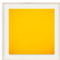
Opticks 025 , 2018 Chromogenic print Neg. # 27.025-L Image: 47 x 47 in. (119.4 x 119.4 cm) Frame: 60 x 60 in. (152.4 x 152.4 cm) Edition of 1 plus 1 artist's proof (24590)