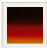
Opticks 124 , 2018 Chromogenic print Neg. # 27.124-L Image: 47 x 47 in. (119.4 x 119.4 cm) Frame: 60 x 60 in. (152.4 x 152.4 cm) Edition of 1 plus 1 artist's proof (24597)