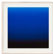
Opticks 115 , 2018 Chromogenic print Neg. # 27.115-L Image: 47 x 47 in. (119.4 x 119.4 cm) Frame: 60 x 60 in. (152.4 x 152.4 cm) Edition of 1 plus 1 artist's proof (24596)