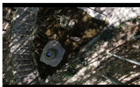
The Garden of Time , 2020 33" 16', looped Color and sound Text and direction by Hiroshi Sugimoto Performance by Min Tanaka and Aurélie Dupont Produced by Odawara Art Foundation and Mori Art Museum Museum of Modern Art