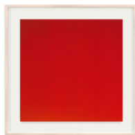
Opticks 052 , 2018 Chromogenic print Neg. # 27.052-L Image: 47 x 47 in. (119.4 x 119.4 cm) Frame: 60 x 60 x 3 in. (152.4 x 152.4 x 7.6 cm) Edition of 1 plus 1 artist's proof (24330)