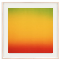
Opticks 250 , 2018 Chromogenic print Neg. #27.250-L Image: 47 x 47 in. (119.4 x 119.4 cm) Frame: 60 x 60 in. (152.4 x 152.4 cm) Edition of 1 plus 1 artist's proof (24689)