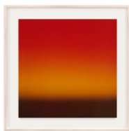
Opticks 069 , 2018 Chromogenic print Neg. # 27.069-L Image: 47 x 47 in. (119.4 x 119.4 cm) Frame: 60 x 60 in. (152.4 x 152.4 cm) Edition of 1 plus 1 artist's proof (24595)