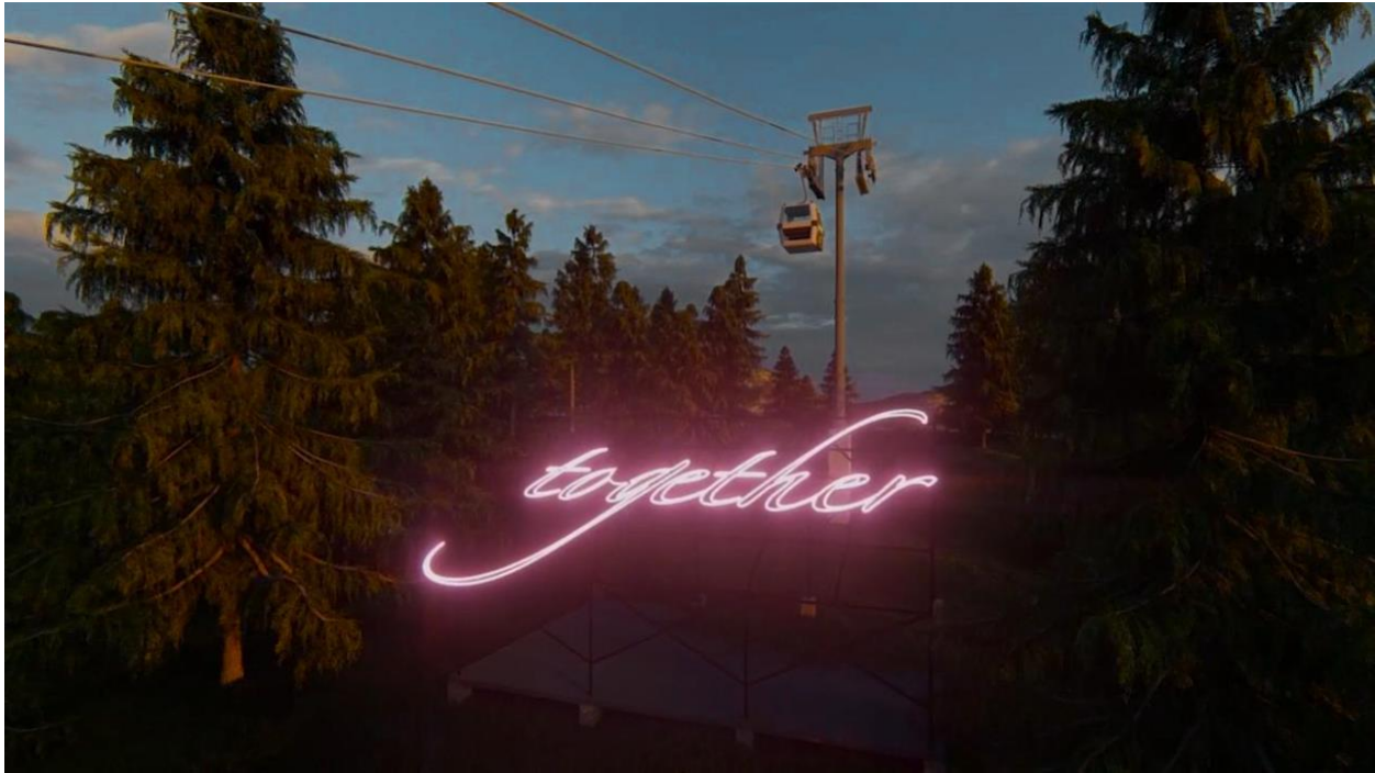
Rendering of "Together," 2020. Neon, transformers, steel, concrete, tube supports, rich-lite. Variable dimensions.

(Telluride, CO — April 30, 2020) — Internationally renowned artist Tavares Strachan is launching Together , a far-reaching community engagement project in Telluride, Colorado informed by his long-term collaboration with local residents. The project is conceptually grounded in an obliquely simple message: WE ARE IN THIS TOGETHER. As a call for unity, the project gestures to a utopic provocation, but for the artist, it is a call to action. The Together project will incorporate philanthropy, social engagement, conversations, and sculpture.