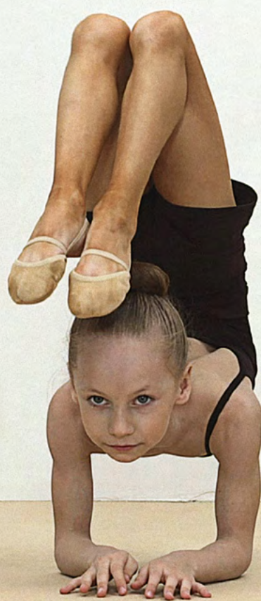
Video still from The Gymschool, St. Petersburg , 2014