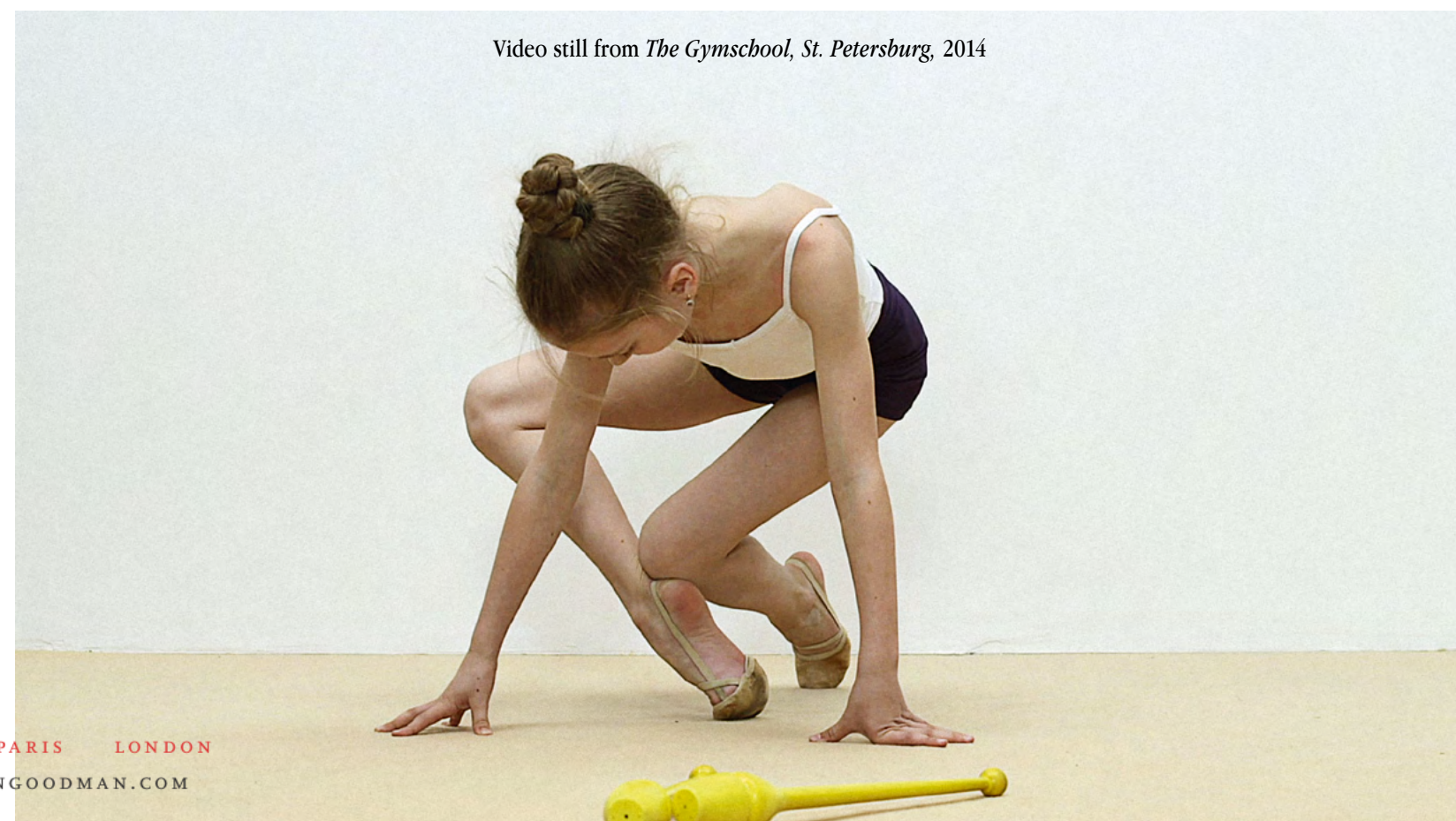
Video still from The Gymschool , St. Petersburg, 2014

One gets the sense that her individuality will be her ruin.