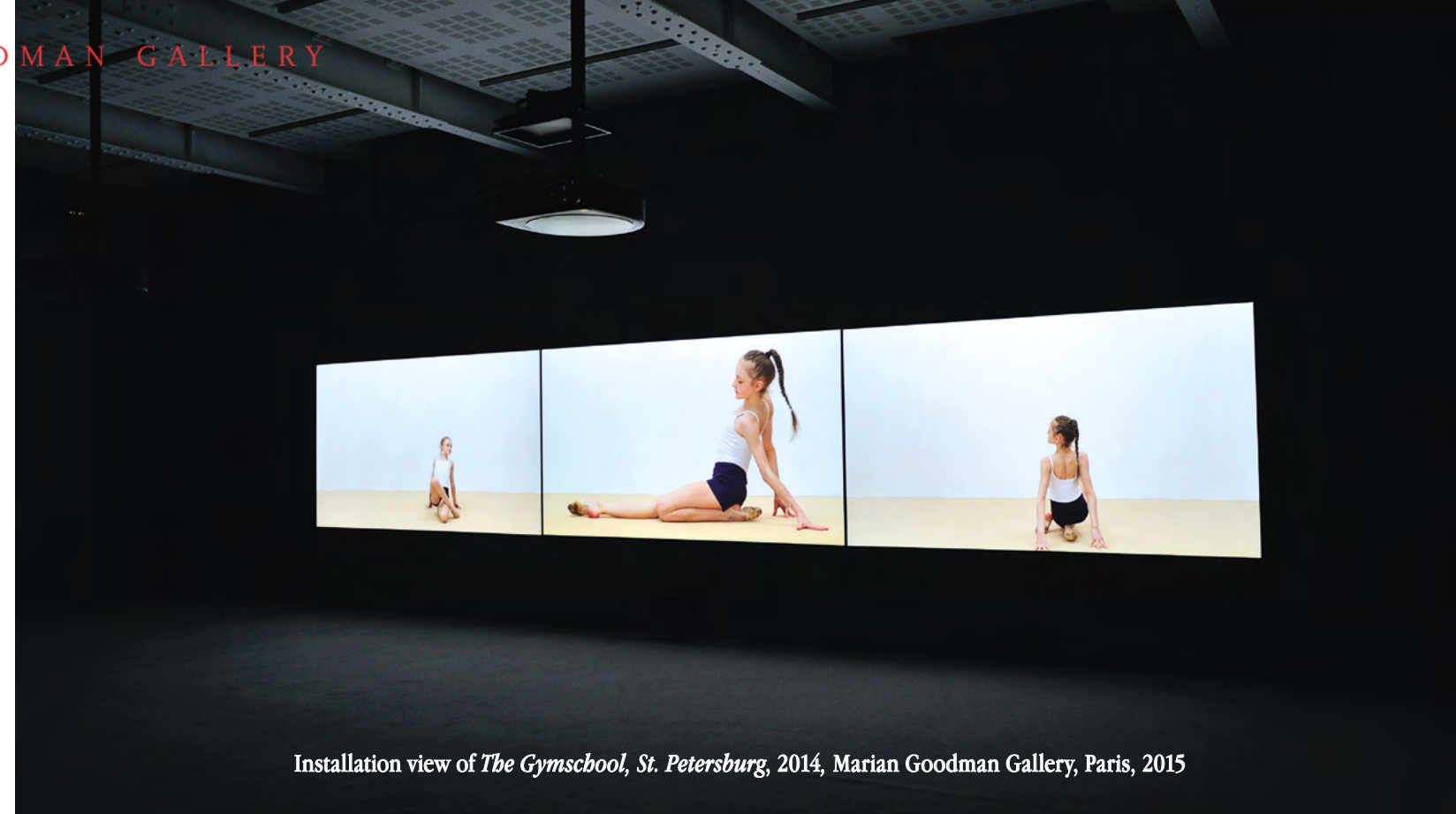
Installation view of The Gymschool , St. Petersburg, 2014, Marian Goodman Gallery, Paris, 2015

The Gymschool renders visible the technolinguistics of sport and their libidinal re-engineering through which the body becomes apparatus to art. This moving image document of lathesome nymphets in states of machinic rapture is far from advocating some technopolitical drive towards a posthumanist end. Instead, Dijkstra’s lens seeks out that which is immanent in what might otherwise appear transcendent. The result is an image that lends itself better to a Kubrick film than any programme espousing progressive female social empowerment. For Dijkstra, this is an approach consistent with the Dutch tradition. Recall that Rembrandt’s paintings are the first modern miracles; how they occur as an art historical fork between History and Religious painting. At the same time, that kind of work tends to be popular, bourgeois, generic.