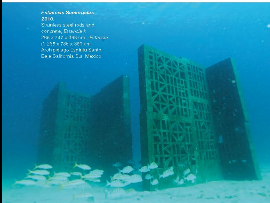
Estancias Sumergidas , 2010. Stainless steel rods and concrete, Estancia I : 265 x 747 x 398 cm.; Estancia II : 265 x 738 x 380 cm. Archipiélago Espíritu Santo, Baja California Sur, Mexico.

Cristina Iglesias's site-specific installation in Madison Square Park, Landscape and Memory, is on view through December 4, 2022.