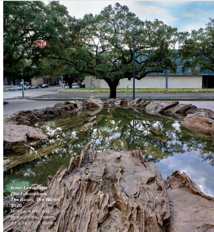
Inner Landscape (The Lithosphere, The Roots, The Water), 2020. Bronze, water, and hydraulic mechanism, 1.1 x 15 x 10.6 meters.

JGC: What factors in your personal life have made you such a philosophical thinker in your work? Your parents? Your education? Being a woman? Being a mother?