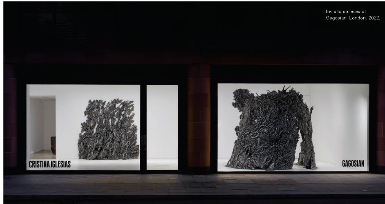
Installation view at Gagosian, London, 2022.

Everything that has happened in my life—being a woman, being a mother—is another stratum in my formation. My voice is the voice of a woman. When I did my first piece with water, Deep Fountain in Antwerp, they asked me to work with jets going up into the sky, and I had to defend my idea that going deep would be spectacular. That may be one reason why I'm so connected to the underground, which I always loved when I was studying chemical engineering,