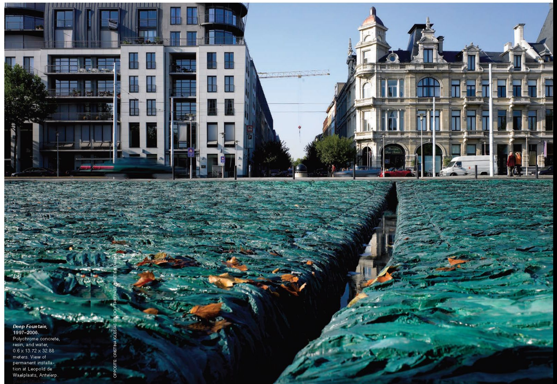
Deep Fountain , 1997–2006. Polychrome concrete, resin, and water, 0.6 x 13.72 x 32.88 meters. View of permanent installation at Leopold de Waelplaats, Antwerp. iglesias studio.