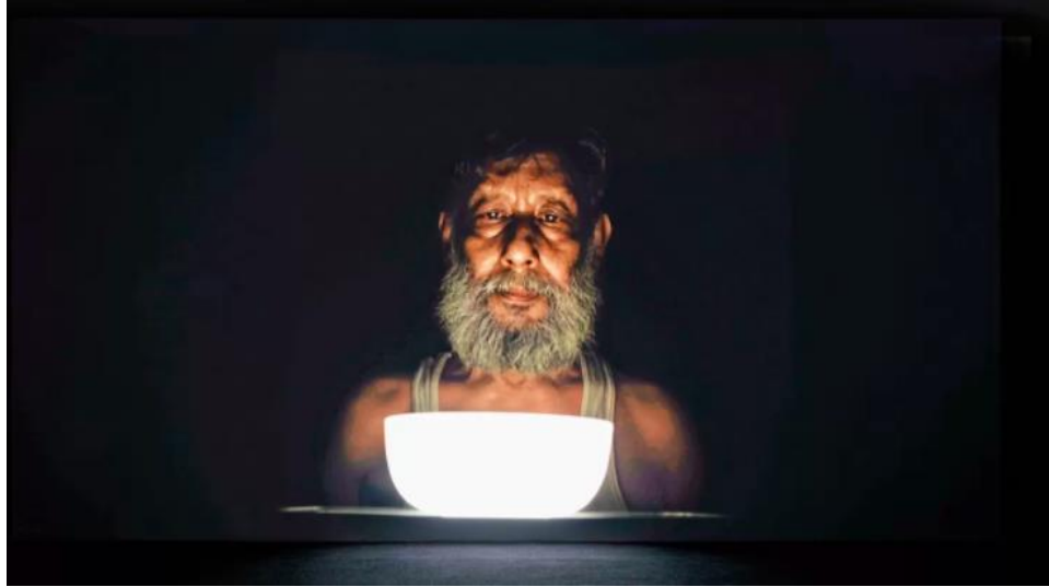
Stills from Such a Morning

Like all mountains, this one too seemed much closer than it really was. Before sunrise it would often appear to be in a calm strong grey-blue mood, its immense distance now easy to see. An hour after sunrise, with the snow fresh, visible and uncertain and it was almost younger by a few lifetimes. In the afternoon you could sense thick sloping forests and just before dusk, for a brief moment, when the light and colours changed rapidly, you could see that it wasn't a single mountain but a series of concentric slopes, folds eventually rising up and within to become an unknown and difficult peak.