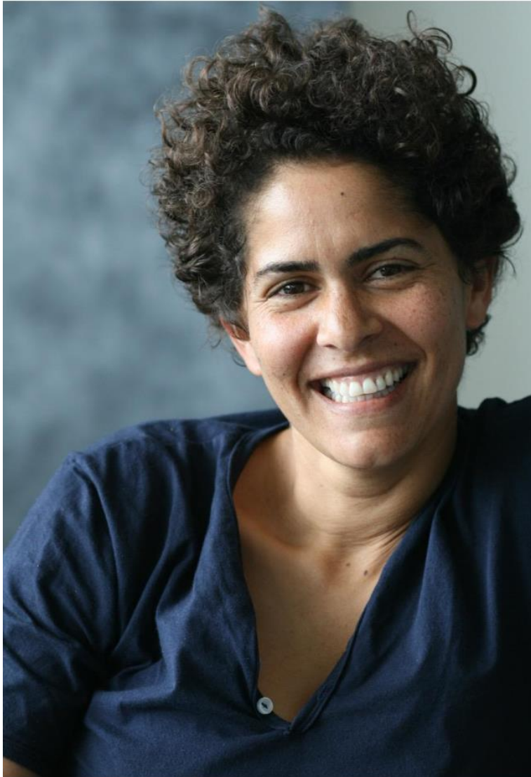
The artist Julie Mehretu. After a fellowship at the American Academy in Berlin in 2007, she counts Berlin as one of her favorite cities in which to paint.

Berlin's architecture, the amount of open space in the city, left an impression on her: