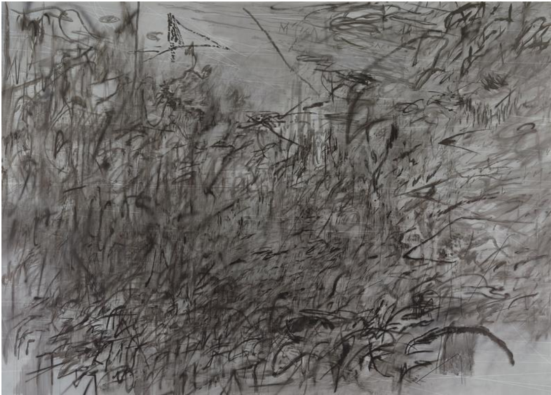
Invisible Sun (algorithm 7, spell form), 2015, by Julie Mehretu. Courtesy of the artist and Marian Goodman Gallery, New York