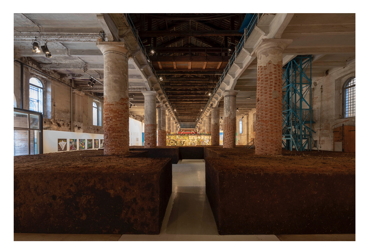
Museo Carlo Zauli (High resolution images upon request)