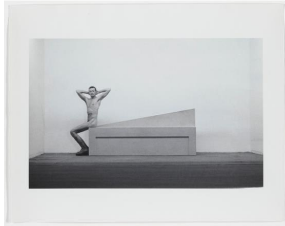
Fig. 14 Section III. Sexual Presentations [alternating aggressive and passive] , by Scott Burton. 1980. Gelatin siver print, 2.2 by 3.6 cm. (© Estate of Scott Burton; Museum of Modern Art Archives, New York; Scala, Florence; Art Resource, New York; exh. Pulitzer Arts Foundation, St Louis).