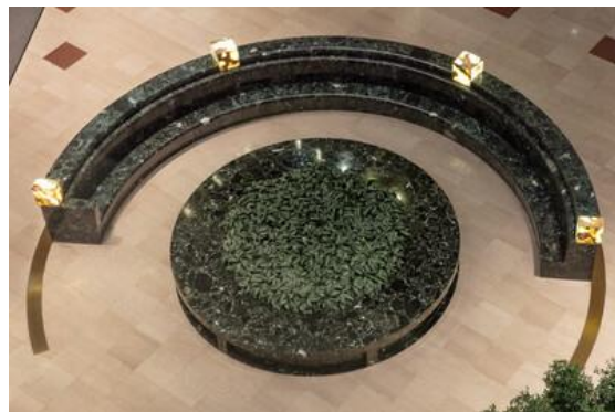
Fig. 3 Atrium Furnishment , by Scott Burton. 1986. Semi-circular verde larissa marble bench with four onyx lights and inset brass floor element surrounding a verde larissa marble circular table with a fountain (later a planter), diameter 12.1 m. (© Estate of Scott Burton; courtesy Kasmin Gallery, New York).