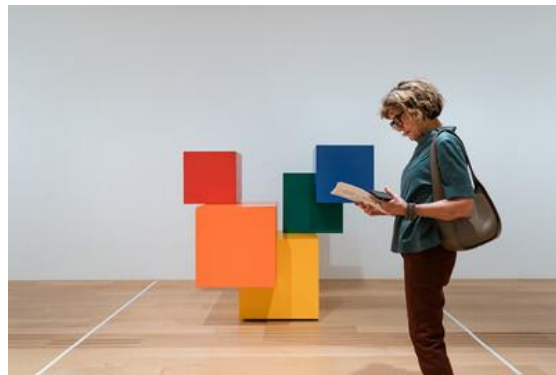
Fig. 18 Installation view of Scott Burton: Shape Shift , showing Five-Part Storage Cubes , by Scott Burton. 1982. Painted wood, 134.6 by 144.8 by 110.5 cm. (© Estate of Scott Burton; Artists Rights Society, New York; photograph Virginia Harold).

the ‘ground’ it shares with Burton’s adjacent furniture sculpture FIG.17 . Other, less direct but revealing, affinities align their practices, not least a proclivity to juxtapose unlike materials: highly polished metal and marble in the European artist’s Fish (1926), galvanized steel with mother of pearl in the American’s Inlaid Table (1977–78). A salute to Art Deco, a riposte to Minimalist austerity, Inlaid Table stands out among the many examples of the occasional tables that Burton would go on to design in a form he relished because it had become ‘by [Gerrit] Rietveld’s time [...] just about as far from utility as any painting’. 19