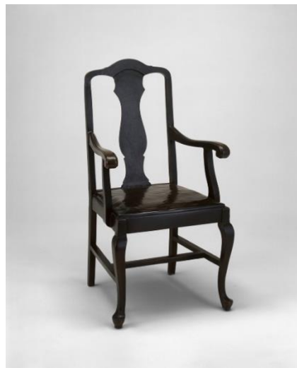
Fig. 9 Bronze Chair , by Scott Burton. 1972. Bronze, 121.9 by 45.7 by 50.8 cm. (© 2024 Estate of Scott Burton; Artists Rights Society, New York; Art Institute of Chicago; exh. Pulitzer Arts Foundation, St Louis).

The Pulitzer Arts Foundation, designed by Tadao Ando, is renowned for its elegant, refined architecture. Its variously scaled galleries, built with exacting attention to proportion, detail and surface, complemented Burton's artful use of sensuous materials in service to precise geometries. Given the exigent parcours, the curators dispensed with a chronological hang in favour of groupings selected from a corpus of forty sculptures and seventy works on paper, the majority of which were photographs. 13 Many of the ensembles were dedicated to one of Burton's preferred typologies; and, with few exceptions, the exhibits were mounted on low platforms. Robbed of their functionality, no longer to be touched – let alone sat upon – the furniture–sculpture was set apart from its audiences.