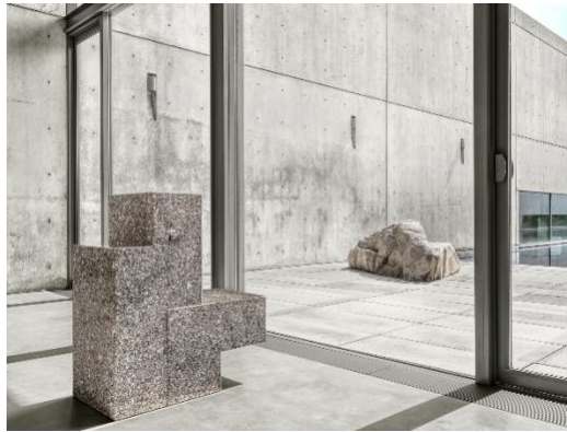
Fig. 12 Installation view of Scott Burton: Shape Shift at Pulitzer Arts Foundation, St Louis, 2024–25, showing Two-Part Chair , by Scott Burton. 1986. Deer Island granite, 101.6 by 58.4 by 48.3 cm.; and Rock Settee , by Scott Burton. 1988–90. Granite, 90.1 by 269.2 by 158.8 cm. (© Estate of Scott Burton; Artists Rights Society, New York; photograph Alise O'Brien).

The remaining two exhibits in the entrance gallery FIG.10 expanded the discourse: Two-Part Chaise Longue (1987), svelte and low-slung in pink granite, offered the languid onlooker a perch to observe from a distance. More august, Mahogany Chair (1988) assumed the role of a poised feline guardian. The high-ceilinged principal gallery followed these display conventions, constellating individual chairs and outdoor benches around the unforgettable Onyx Table , illuminated from within by fluorescent light. With the institution's signature Ellsworth Kelly painting at its backdrop FIG.11 , the ensemble captured something of Burton's antic spirit.