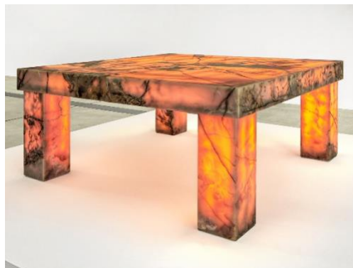
Fig. 7 Onyx Table , by Scott Burton. 1978–81. Onyx marble, steel and fluorescent lights, 75.6 by 158.1 by 151.8 cm. (© Estate of Scott Burton; Museum of Modern Art Archives, New York; courtesy Pulitzer Arts Foundation, St Louis; photograph Alise O’Brien; exh. Pulitzer Arts Foundation, St Louis).

Key to Urbano’s installation is the suspended ceiling FIG.6 , which masks the dark vault of this lofty industrial building. Constellations of small irregular forms – the silhouettes of leaves that appear to have fallen from nearby trees – interrupt the milky white surface of modular glass panes. A golden light, similar in hue to that illuminating Burton’s onyx lamps from the dismembered Atrium Furnishment fragments, pans the ceiling, as though in response to the waxing and waning of natural diurnal cycles. Animating his tableau both literally and figuratively, Urbano transforms what might have been an installation that occupied the given gallery into one that makes an architectonic space. A site for reverie, for dallying and dreaming, his theatrical mise-en-scene invests visitors with a performative role.