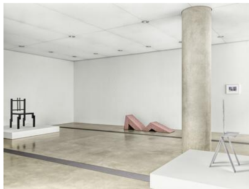
Fig. 10 Installation view of Scott Burton: Shape Shift at Pulitzer Arts Foundation, St Louis, 2024–25. (© Estate of Scott Burton; Artists Rights Society, New York; photograph Alise O'Brien).