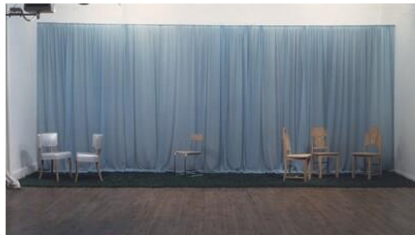
Fig. 8 Performance view of Pastoral Chair Tableaux , by Scott Burton. Colour transparency, 20 by 25.2 cm. (© Estate of Scott Burton; Museum of Modern Art Archives, New York; Scala, Florence; Art Resource, New York; exh. Pulitzer Arts Foundation, St Louis).

In accordance with the artist's directive, Richardson's catalogue text laid the groundwork for Burton's anticipated trajectory centred on environmentally scaled public art. 12 The artist's premature death three years later abruptly cut short that vision: the exhibition, with its focus on his vanguard furniture–sculpture, came to be considered paradigmatic. Shape Shift , organised by Jess Wilcox and Heather Alexis Smith, offers a very different reading from that long-definitive formulation. In proposing a reassessment addressed to our time, the curators have shaped a compelling exhibition that refrains from foreclosing debates on Burton's multifaceted practice.