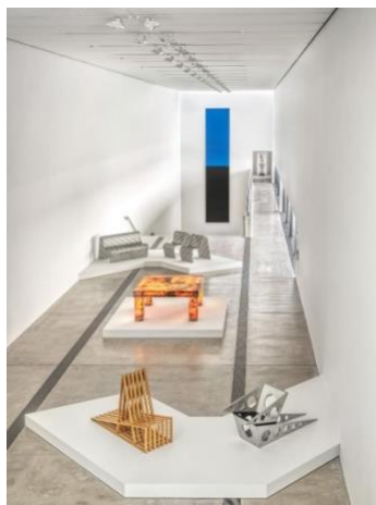
Fig. 11 Installation view of Scott Burton: Shape Shift at Pulitzer Arts Foundation, St Louis, 2024–25. (© Estate of Scott Burton; Artists Rights Society, New York; photograph Alise O'Brien).