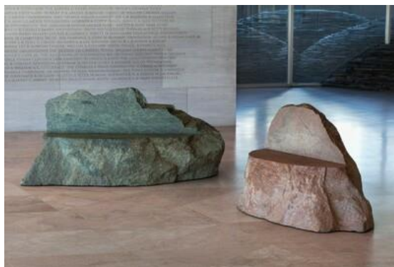
Fig. 13 Rock Settees , by Scott Burton. 1988. Granite, 2 pieces, overall dimensions 97.8 by 160 by 107.9 cm. (© Estate of Scott Burton and Artists Rights Society, New York; National Gallery of Art, Washington; courtesy National Gallery of Art, Washington).

The heart of the exhibition was the 'bridge' gallery that links the two wings of Ando's building, where the only two works that allowed for visitor interaction were installed. Two-Part Chair was here separated by a glass wall from Rock Settee FIG.12 , hunkered down in the serene courtyard beyond. Permanently sited at the edge of an infinity pool that stretches the full length of the parallel wings, Rock Settee encourages visitors to venture outdoors, to detour and dally. Their backs to the gallery, they can rest on the immutable monolith, idly watching the light play over slow flowing water – an ebb and flow of flux and stasis that with time takes on an existential tenor.