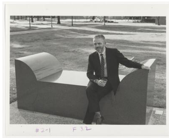
Fig. 1 Scott Burton sitting on a granite bench at the College of Architecture Building, University of Houston, in c.1986. Gelatin silver print, 20.3 by 25.4 cm.