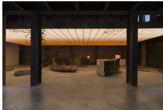
Fig. 2 Installation view of Álvaro Urbano: TABLEAU VIVANT at SculptureCenter, New York, 2024–25.

Critical to this sea change has been the perceived relevance of Burton's aesthetic and vision in today's globalised art world. As Shape Shift revealed, the artist's bridging of art, design, performance and architecture was prescient. Informed by second-wave feminism, behavioural psychology and communications theory, Burton rejected categorical distinctions between art forms in pursuit of a multidisciplinary practice. Equally salient to his new-found visibility are his queer politics. Grounded in lived experience rather than ideologically driven, they honed his overtly queer performance work and, in turn, imbued his sculpture and public art in ways that speak across normative gender lines.