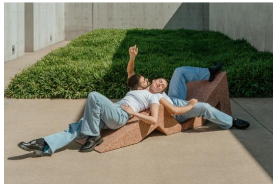
Fig. 15 In Two , by Brendan Fernandes, performed at Pulitzer Arts Foundation, St Louis, 2024–25. (© Brendan Fernandes; courtesy Pulitzer Arts Foundation, St Louis; photograph Virginia Harold).