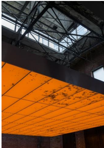
Fig. 6 Installation view of Álvaro Urbano: TABLEAU VIVANT at SculptureCenter, New York, 2024–25. (Courtesy the artist and SculptureCenter, New York; photograph Charles Benton).

chair, bed and sofa patterned with vegetal motifs – and a framed landscape painting and a vase of flowers. Despite the overgrown abandon of the pastoral setting, references to Henry David Thoreau’s utopian ideals were unmissable. Yet, Burton also hoped viewers would perceive affinities with Henri Rousseau’s The Dream (1910; Museum of Modern Art, New York). In Le Douanier’s beguiling, gendered fantasy, a female nude, reclining on a divan in a tropical rainforest, is watched over by a cohort of wild animals.