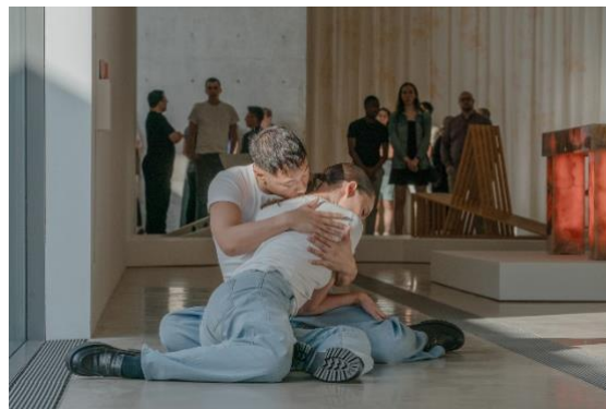
Fig. 16 In Two , by Brendan Fernandes, performed at Pulitzer Arts Foundation, St Louis, 2024–25. (© Brendan Fernandes; courtesy Pulitzer Arts Foundation, St Louis; photograph Virginia Harold).

Burton sourced the monumental specimens that comprise his beloved series of rock chairs and settees FIG.13 in quarries in North America and Europe, selecting each on account of its specific material and formal qualities. The Pulitzer’s fine example is one of a subgroup of ‘orphaned’ boulders, the profiles of which were smoothed by abrasion over millennia. Weighing thousands of pounds, it, like its peers, was abandoned – left behind by fast-moving glaciers. Its functionality depends on two sharp cuts