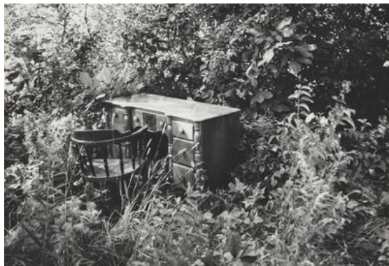
Fig. 5 Furniture Landscape , by Scott Burton. 1970. (© Estate of Scott Burton; Museum of Modern Art Archives, New York; Scala, Florence; Art Resource, New York; exh. Pulitzer Arts Foundation, St Louis).

In TABLEAU VIVANT remnants salvaged from Atrium Furnishment , which was deinstalled and put into storage in 2020, are surrounded by steel-cast, painted plants and half-eaten apples made from concrete FIG.4 . A reprise of the semiotics of social interaction that fuel Burton’s ‘ruin in progress’, Urbano’s elegiac reanimation evokes the faux-wildness and meandering pathways of the Ramble in Central Park, long a favoured site for cruising. Tellingly, TABLEAU VIVANT also invokes Furniture Landscape FIG.5 , a formative installation that Burton staged at the University of Iowa in 1970, through its deft melding of public and private, nature and culture. In a densely wooded part of the campus, he installed a series of discrete ‘rooms’ furnished with worn vernacular objects – an armoire, desk and