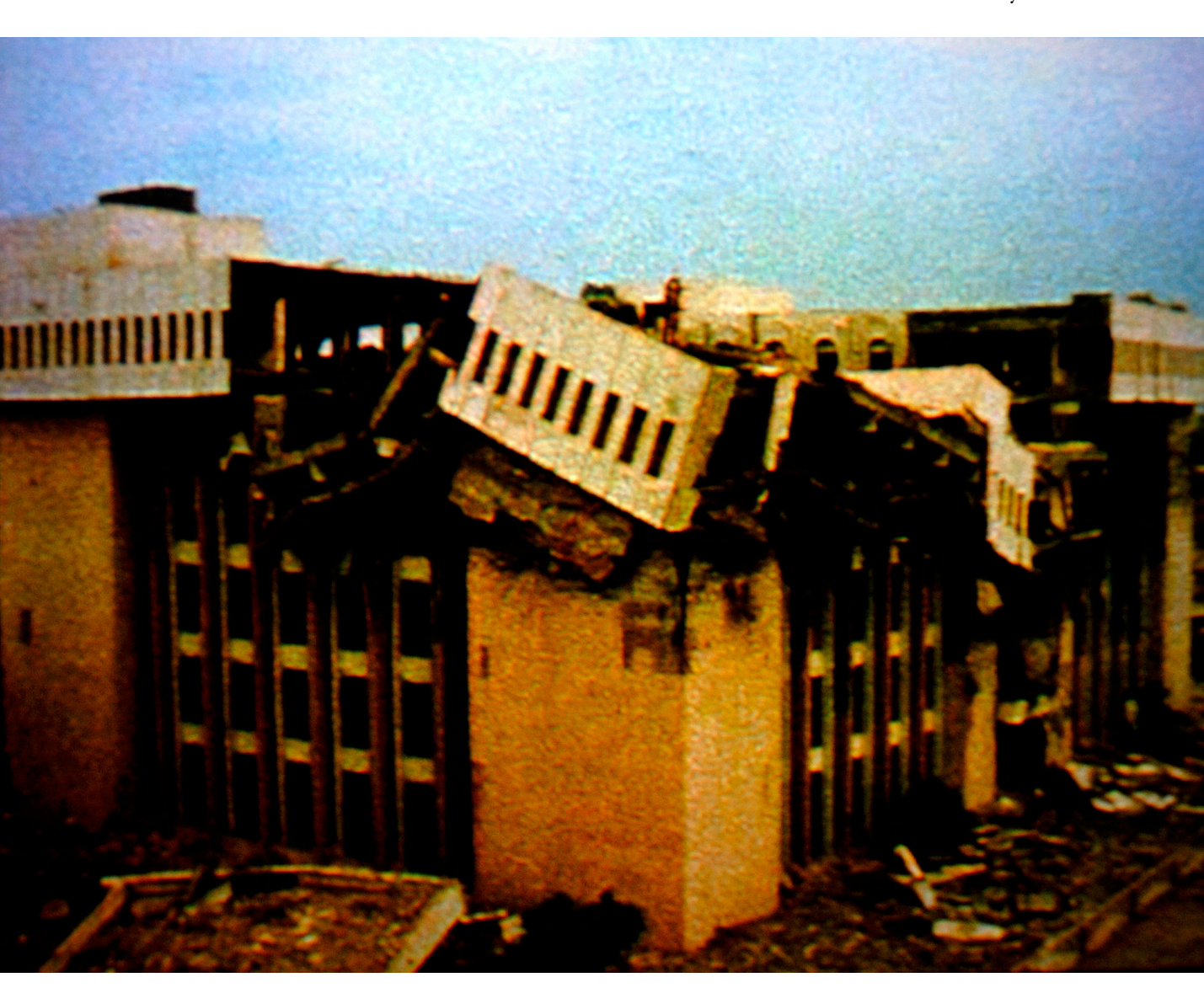
Steve McQueen, Unexploded , 2007, Super 8 mm colour film, transferred to video, no sound, 54 seconds, courtesy of the artist, Marian Goodman Gallery, New York/Paris and Thomas Dane Gallery, London

A dominant code of documentary is to create a visual language which intimates that the filmed events would have unfolded similarly had