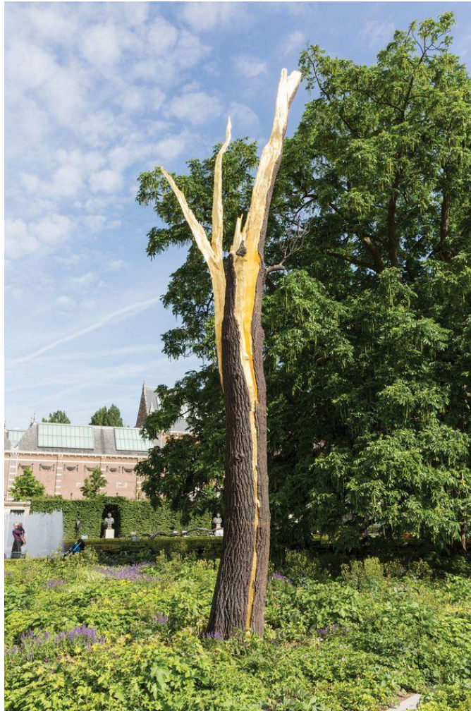
Giuseppe Penone's Albero Folgorato (2012)

No, I'll show, for instance, a 30m-long piece, Matrice (2015), the trunk of a bisected fir tree, that will run the entire length of Yorkshire Sculpture Park's indoor gallery. I never think of the tree itself as a motif but as a living being with a form and structure. It is all about the necessity and meaning of life. I think of Cézanne when asked this question; his best paintings are the Mont Sainte-Victoire landscapes (1904). When we think of these works, we don't think of the mountains depicted but the painting. It is about the object not the subject represented.