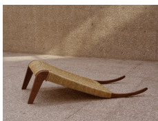
Clara IV , 2018 Wood and rope 20 1/8 x 78 3/4 x 40 1/2 in. (51 x 200 x 103 cm) (29880)