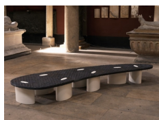
Charlotte #2, 2021

Engobe and glazed ceramics, lacquered wood