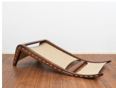
Clara II, 2018

Overall: 67 x 63 x 8 in. (170.2 x 160 x 20.3 cm) (30900)