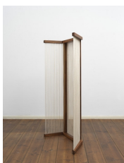
Clara I , 2018 Teak wood, cotton rope 69 3/4 x 40 1/8 x 13 3/4 in. (177 x 102 x 35 cm) (20981)