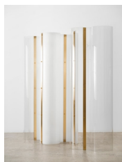
discrepancies with E.S. #5, 2025