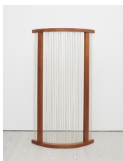
Clara V , 2018 Teak wood, hemp yarn 69 1/2 x 38 1/2 x 11 1/4 in. (176.5 x 97.7 x 28.7 cm) (20980)