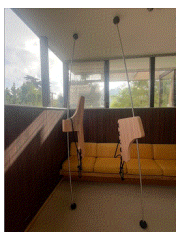
Elizabeth #5, 2025

Cedar wood, nylon rope, stainless steel, rubber, cork, glass beads