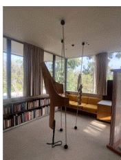
Elizabeth #3 , 2025 Cedar wood, nylon rope, stainless steel, rubber, cork, glass beads Wood: 37 1/2 x 24 1/4 x 1 3/4 in. (95.3 x 61.6 x 4.4 cm) Overall dimensions variable (29924)