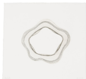
KIM LIM Ring , 1970 Engraving Paper: 15 3/8 x 16 3/8 in. (39 x 41.5 cm) Frame: 18 1/8 x 18 1/2 x 1 5/8 in. (46 x 47 cm) Edition of 20 No. SC/23655