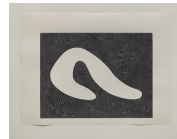
RICHARD DEACON Sleeping Beauty #1 , 2012 Shaped STPI handmade paper, collaged on screenprinted Saunders paper Paper: 39 5/8 x 54 1/8 in. (100.5 x 137.5 cm) Frame: 43 3/4 x 59 1/8 x 2 3/4 in. (111 x 150 cm) Edition of 6 plus 1 artist's proof No. SC/23650