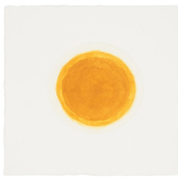
KIM LIM Jaune Fonce , 1972 Aquatint Paper: 16 1/8 x 16 3/8 in. (41 x 41.5 cm) Frame: 18 1/2 x 18 1/2 x 1 5/8 in. (47 x 47 cm) Un-numbered edition, unsigned No. SC/23656