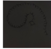
ANRI SALA Lines on Black (Jung, Huxley, Stravinsky) , 2016 Screenprint and flocking on Stonehenge black paper Paper: 50 3/8 x 50 3/8 in. (128 x 128 cm) Frame: 51 1/8 x 51 1/8 x 2 1/8 in. (130 x 130 cm) Edition of 4 + 2 AP Numbered and signed certificate No. SC/23653