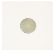
KIM LIM Silver , 1970 Engraving Paper: 13 5/8 x 13 1/2 in. (34.7 x 34.3 cm) Frame: 15 3/4 x 16 x 1 5/8 in. (40 x 40.5 cm) Edition of 10 No. SC/23654