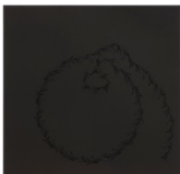
ANRI SALA Lines on Black (Afif, Sala, Flavien) , 2016 Screenprint and flocking on Stonehenge black paper Paper: 50 3/8 x 50 3/8 in. (128 x 128 cm) Frame: 51 1/8 x 51 1/8 x 2 1/8 in. (130 x 130 cm) Edition of 4 + 2 AP Numbered and signed certificate No. SC/23652