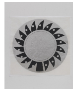
RIRKRIT TIRAVANIJA We can travel to the sun when it is setting , 2013 Screenprint, metal foil, horse hair on STPI handmade abaca paper Paper: 39 1/8 x 39 1/8 in. (99.5 x 99.5 cm) Frame: 47 1/4 x 47 1/4 x 1 3/8 in. (120 x 120 cm) Edition of 10 No. SC/23673