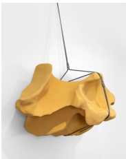
Avvolgere la terra - il colore nelle mani , 2014 Terracotta, stainless steel, colored pigment 20 1/4 x 34 5/8 x 20 1/8 in. (51.5 x 88 x 51 cm) (28383)