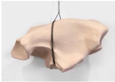
Avvolgere la terra - il colore nelle mani , 2014 Terracotta, stainless steel, colored pigment 20 1/4 x 34 5/8 x 20 1/8 in. (51.5 x 88 x 51 cm) (28385)