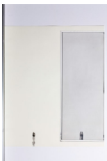
Coincidenza di immagini, cornice 21 aprile 1971 , 1971 Selenium-toned gelatin silver print and typographic ink on paper Sheet: 27 x 22 1/8 in. (68.5 x 56.1 cm) Frame: 33 x 28 1/8 x 2 in. (83.8 x 71.4 x 5.1 cm) (28371)