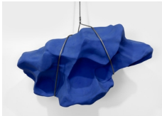
Avvolgere la terra - il colore nelle mani , 2014 Terracotta, stainless steel, colored pigment 20 1/4 x 34 5/8 x 20 1/8 in. (51.5 x 88 x 51 cm) (28386)