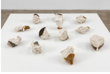
Cocci , 1979-1982 12 elements; gesso, terracotta 4 x 4 x 4 in. (10 x 10 x 10 cm) (each) (28364)