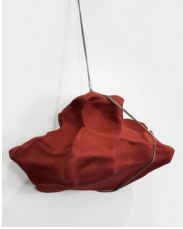
Avvolgere la terra - il colore nelle mani , 2014 Terracotta, stainless steel, colored pigment 20 1/4 x 34 5/8 x 20 1/8 in. (51.5 x 88 x 51 cm) (28384)