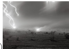
Night Operations IV , from 29 Palms , 2003-2004 Gelatin silver print Image: 37 1/2 x 26 in. (95.3 x 66 cm) Frame: 38 1/4 x 26 3/4 in. (97.2 x 67.9 cm) Edition of 5 + 2 APs No. 19919