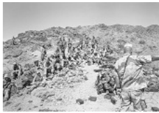
Infantry Officers' Brief , from 29 Palms , 2003-2004 Gelatin silver print Image: 37 1/2 x 26 in. (95.3 x 66 cm) Frame: 38 1/4 x 26 3/4 in. (97.2 x 67.9 cm) Edition of 5 + 2 APs No. 19912