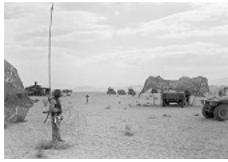
Combat Operations Center Guard , from 29 Palms , 2003-2004 Gelatin silver print Image: 37 1/2 x 26 in. (95.3 x 66 cm) Frame: 38 1/4 x 26 3/4 in. (97.2 x 67.9 cm) Edition of 5 + 2 APs No. 19911