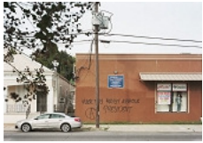
November 9, Graffiti, New Orleans, Louisiana, from The Silent General, 2016