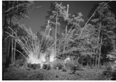
Explosion , from Small Wars , 1999-2002 Gelatin silver print Image: 37 1/2 x 26 in. (95.3 x 66 cm) Frame: 38 1/4 x 26 3/4 in. (97.2 x 67.9 cm) Edition of 5 + 2 APs No. 19907