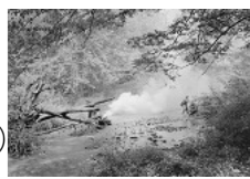
Ambush II, from Small Wars, 1999-2002