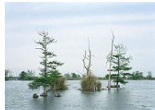
April 17, Swamp, Venice, Louisiana, from The Silent General, 2016