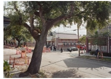
November 6, Sunday Mass, New Orleans, Louisiana, from The Silent General, 2016