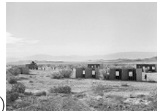
Combat Support Service Operations , from Small Wars , 2003-2004 Gelatin silver print Image: 37 1/2 x 26 in. (95.3 x 66 cm) Frame: 38 1/4 x 26 3/4 in. (97.2 x 67.9 cm) Edition of 5 + 2 APs No. 19918