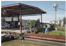
November 10, Workers, Venice, Louisiana, from The Silent General, 2016