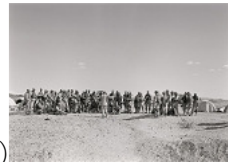
Debriefing , from 29 Palms , 2003-2004 Gelatin silver print Image: 37 1/2 x 26 in. (95.3 x 66 cm) Frame: 38 1/4 x 26 3/4 in. (97.2 x 67.9 cm) Edition of 5 + 2 APs No. 19913