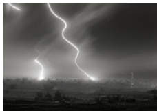
Night Operations I , from 29 Palms , 2003-2004 Gelatin silver print Image: 37 1/2 x 26 in. (95.3 x 66 cm) Frame: 38 1/4 x 26 3/4 in. (97.2 x 67.9 cm) Edition of 5 + 2 APs No. 19920