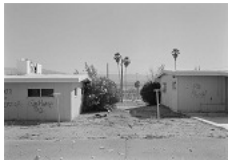
Security and Stabilization Operations, Graffiti (GI Go Home) , from 29 Palms , 2003-2004 Gelatin silver print Image: 37 1/2 x 26 in. (95.3 x 66 cm) Frame: 38 1/4 x 26 3/4 in. (97.2 x 67.9 cm) Edition of 5 + 2 APs No. 19917