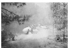
Rescue, from Small Wars, 1999-2002