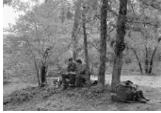
Lesson , from Small Wars , 1999-2002 Gelatin silver print Image: 37 1/2 x 26 in. (95.3 x 66 cm) Frame: 38 1/4 x 26 3/4 in. (97.2 x 67.9 cm) Edition of 5 + 2 APs No. 19906