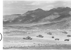
Mechanized Assault , from 29 Palms , 2003-2004 Gelatin silver print Image: 37 1/2 x 26 in. (95.3 x 66 cm) Frame: 38 1/4 x 26 3/4 in. (97.2 x 67.9 cm) Edition of 5 + 2 APs No. 19914