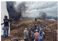
Film Set ("Free State of Jones"), Battle of Corinth, Bush, Louisiana, from The Silent General, 2015