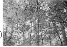
Bamboo , from Small Wars , 1999-2002 Gelatin silver print Image: 37 1/2 x 26 in. (95.3 x 66 cm) Frame: 38 1/4 x 26 3/4 in. (97.2 x 67.9 cm) Edition of 5 + 2 APs No. 19908