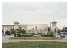
Monument, General P.G.T. Beauregard, New Orleans, Louisiana, from The Silent General, 2016