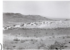
Small Convoy Attack , from 29 Palms , 2003-2004 Gelatin silver print Image: 37 1/2 x 26 in. (95.3 x 66 cm) Frame: 38 1/4 x 26 3/4 in. (97.2 x 67.9 cm) Edition of 5 + 2 APs No. 19915