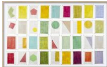
Drawing for Waiting for the Sibyl (Geometry of Colour), 2021