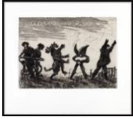
Old Gods Have Retired, 2019 Coffee-lift aquatint with drypoint Paper: 15 3/4 x 19 3/4 in. (40 x 50 cm) Frame: 21 1/8 x 22 7/8 in. (53.6 x 58.2 cm) Edition of 40 (25416)