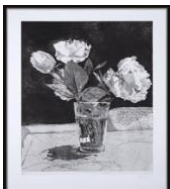
Roses in the Big Glass, 2020 Coffee-lift aquatint with drypoint Image: 39 3/4 x 31 1/4 in. (101 x 79.5 cm) Paper: 46 7/8 x 37 5/8 in. (119 x 95.5 cm) Frame: 50 3/4 x 41 1/2 in. (129 x 105.5 cm) Edition of 30 (25414)