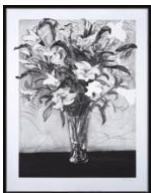
Lillies, 2020 Coffee-lift aquatint with drypoint and collage Image: 46 1/8 x 31 1/8 in. (117 x 79 cm) Paper: 53 3/8 x 37 3/8 in. (135.5 x 95 cm) Frame: 59 1/8 x 43 1/4 in. (150.2 x 110 cm) Edition of 30 (25413)