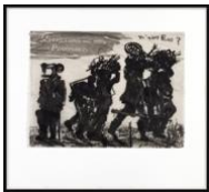
Something Has Been Postponed, 2019 Coffee-lift aquatint with drypoint Paper: 15 3/4 x 19 3/4 in. (40 x 50 cm) Frame: 21 1/8 x 22 7/8 in. (53.6 x 58.2 cm) Edition of 40 (25419)