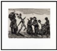
Day Will Break More Than Once, 2019 Coffee-lift aquatint with drypoint Paper: 15 3/4 x 19 3/4 in. (40 x 50 cm) Frame: 21 1/8 x 22 7/8 in. (53.6 x 58.2 cm) Edition of 40 (25418)