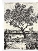
Tout ce qui respire, 2021 Lithograph, Japon Shiramine natural 1 paper 110 g 62 5/8 x 45 1/2 in. (159 x 115.5 cm) Edition of 26 plus 2 artist's proofs (25567)