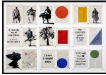
Drawing for Waiting for the Sibyl (I have brought news), 2020

Indian ink, pencil and charcoal drawings on found pages