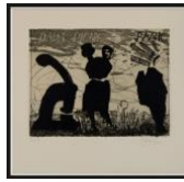
Dada Picnic 1, 2019 Sugarlift aquatint with drypoint Image: 11 3/8 x 15 3/8 in. (29 x 39 cm) Paper: 17 3/4 x 19 3/4 in. (45 x 50 cm) Frame: 21 1/8 x 22 7/8 in. (53.6 x 58.2 cm) Edition of 20 (25421)