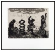
The Pool Ahead is Not To Be Trusted, 2019 Coffee-lift aquatint with drypoint Paper: 15 3/4 x 19 3/4 in. (40 x 50 cm) Frame: 21 1/8 x 22 7/8 in. (53.6 x 58.2 cm) Edition of 40 (25417)