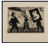
Dada Picnic 2, 2019 Sugarlift aquatint with drypoint Image: 11 3/8 x 15 3/8 in. (29 x 39 cm) Paper: 17 3/4 x 19 3/4 in. (45 x 50 cm) Frame: 21 1/8 x 22 7/8 in. (53.6 x 58.2 cm) Edition of 20 (25422)