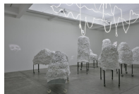
Les Lingés , 2020

Metal tables on wheels, cardboard, cotton cloth, staples, neon flexible LED Dimensions variable No. 24693