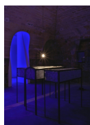
Les Vitrines , 2020

72 brass sockets, 72 blue LED bulbs, electric wire, power socket Dimensions variable No. 24683