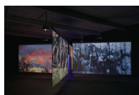
Les Disparus , 2020

Video projection, black and white, silent, continuous loop Dimensions variable Edition of 3 No. 24695