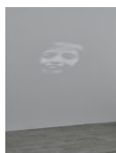
Les Esprits , 2020

Metal tables on wheels, cardboard, cotton cloth, staples, neon flexible LED Dimensions variable No. 24693