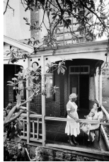
On Esselen Street, Hillbrow. November 1962

Silver gelatin print on fibre based paper