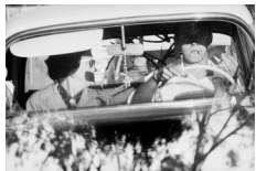
While in traffic. 1967

Silver gelatin print on fibre based paper