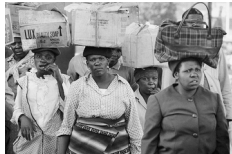
Women on Sauer Street. 1967

Silver gelatin print on fibre based paper