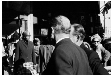
On Eloff Street. May 1966

Silver gelatin print on fibre based paper