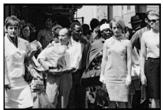
On Eloff Street. 1967

Silver gelatin print on fibre based paper