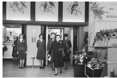
In a department store, probably John Orr's on Von Brandis Street. June 1965

Silver gelatin print on fibre based paper