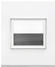
Tasman Sea, Marion Bay , 2017 Gelatin silver print Neg. #604 Image: 47 x 58 3/4 in. (119.4 x 149.2 cm) Frame: 60 11/16 x 71 3/4 in. (154.2 x 182.2 cm) Edition of 5 No. 20196