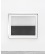
Tasman Sea, Marion Bay, 2017 Gelatin silver print Neg. #605 Image: 47 x 58 3/4 in. (119.4 x 149.2 cm) Frame: 60 11/16 x 71 3/4 in. (154.2 x 182.2 cm) Edition of 5 No. 20197