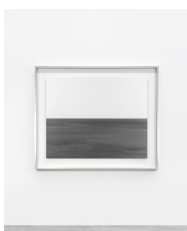
Tasman Sea, Rocky Cape, 2016 Gelatin silver print Neg. #584 Image: 47 x 58 3/4 in. (119.4 x 149.2 cm) Frame: 60 11/16 x 71 3/4 in. (154.2 x 182.2 cm) Edition of 5 No. 20193