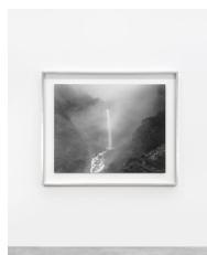
Kegon Waterfall, 1976 Gelatin silver print Neg. #00.001 Image: 47 x 58 3/4 in. (119.4 x 149.2 cm) Frame: 60 11/16 x 71 3/4 in. (154.2 x 182.2 cm) Edition of 5 No. 20200