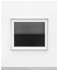
Tasman Sea, Marion Bay, 2017 Gelatin silver print Neg. #606 Image: 47 x 58 3/4 in. (119.4 x 149.2 cm) Frame: 60 11/16 x 71 3/4 in. (154.2 x 182.2 cm) Edition of 5 No. 20198