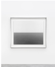
Tyrrhenian Sea, Conca , 1994 Gelatin silver print Neg. #554 Image: 47 x 58 3/4 in. (119.4 x 149.2 cm) Frame: 60 11/16 x 71 3/4 in. (154.2 x 182.2 cm) Edition of 5 No. 20190