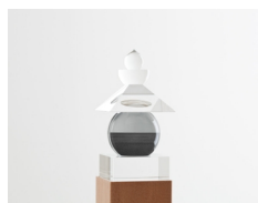
Five Elements: Baltic Sea, Rugen 1996, 2012 Optical quality glass, black and white film Neg. #28.452 3 x 3 x 6 in. (7.6 x 7.6 x 15.2 cm) Edition of 1 + 1 AP No. 20313