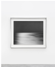
Bay of Sagami, Atami, 1997 Gelatin silver print Neg. #502 Image: 47 x 58 3/4 in. (119.4 x 149.2 cm) Frame: 60 11/16 x 71 3/4 in. (154.2 x 182.2 cm) Edition of 5 No. 20189