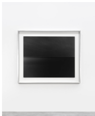
Tasman Sea, Marion Bay , 2017 Gelatin silver print Neg. #607 Image: 47 x 58 3/4 in. (119.4 x 149.2 cm) Frame: 60 11/16 x 71 3/4 in. (154.2 x 182.2 cm) Edition of 5 No. 20199