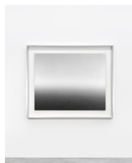
Tasman Sea, Table Cape, 2016 Gelatin silver print Neg. #598 Image: 47 x 58 3/4 in. (119.4 x 149.2 cm) Frame: 60 11/16 x 71 3/4 in. (154.2 x 182.2 cm) Edition of 5 No. 20195