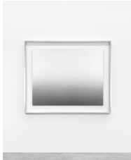
Aegean Sea, Pilon , 1990 Gelatin silver print Neg. #350 Image: 47 x 58 3/4 in. (119.4 x 149.2 cm) Frame: 60 11/16 x 71 3/4 in. (154.2 x 182.2 cm) Edition of 5 No. 20187