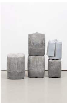
Matias Faldbakken Moonshine Sculpture (Jugs 24-28) , 2010 Poured concrete and plastic Approx. 72 x 110 x 33 cm (Format variable)