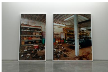
Mark Soo Indeterminate Parts , 2010 C-prints 2 parts: Left: 83" x 48", Right: 83" x 67" Left: 211 x 122cm, Right: 211 x 170cm Edition of 3