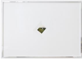
Cyprien Gaillard Fields of Rest , 2011 Polaroid, mat, aluminum frame 72 x 102 cm