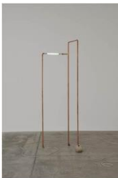
Nina Canell Slight Bend of the Elbow , 2012 Copper, stone, neon, cable, 1000V 80 x 60 x 200 cm