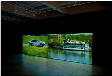
Mark Soo Several Circles , 2011 2 channel video projection Continuous Edition of 4