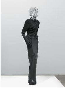
Mai-Thu Perret Flow My Tears , 2011 Foam mannequin, blown glass head Replica Schiaparelli silk dress 175 x 70 x cm Edition of 3