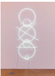
Mai-Thu Perret 2014 , 2011 Neon 101 x 50 inches 257 x 127cm Unique