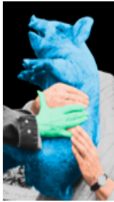
Hands and/or Feet (Part One): Piglet / Hands (One Green), 2009 Three dimensional archival print laminated with lexan and mounted on sintra with acrylic paint 239 x 151 cm # 12557