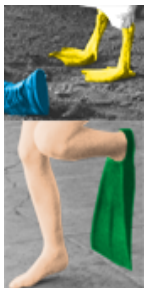
Hands and/or Feet (Part One): Duck Feet / Swimfin, 2009 Three dimensional archival print laminated with lexan and mounted on sintra with acrylic paint 243 x 134 cm #12559