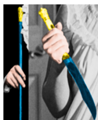
Hands and/or Feet (Part One): Cane / Knife, 2009 Three dimensional archival print laminated with lexan and mounted on sintra with acrylic paint. 151 x 143 cm # 12553