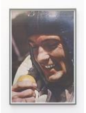
Signal , 2013 Color lenticular print 32 15/16 x 23 1/8 in. (83.7 x 58.8 cm) No. 14974

79 RUE DU TEMPLE 75003 PARIS TEL 33148047052