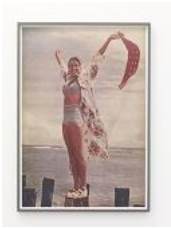
Signal , 2013 Color lenticular print 32 15/16 x 23 1/8 in. (83.7 x 58.8 cm) No. 14976