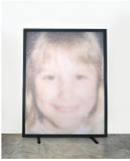
Après , 2014 Print on veil framed between two sheet of Plexiglas, two stands 92 1/2 x 72 13/16 in. (235 x 185 cm) No. 16298