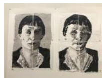
Anna Akhmatova (Burying Earth in Earth) , 2017 Indian ink, digital print and red pencil on paper 43 1/4 x 57 1/4 in. (110 x 145.5 cm) Unique No. 19769