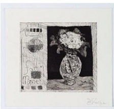
Test for Manet , 2016 Hardground etching and aquatint Hahnemuhle, Natural White, 300 gsm 10 15/16 x 11 3/4 in. (27.8 x 29.8 cm) Edition 40 + 4 APs No. 19785