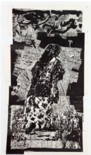
Lampedusa , 2017 Triumphs and Laments Series Woodcut printed from 13 woodblocks onto 28 sheets of various sizes of Somerset Soft White, 300 gsm. 28 pieces in total. 10 large sheets and 18 pieces: 5 pre-attached. 47 Aluminum pins used for placement. Printed by David Krut Print Workshop Image size: approx. 207 x 119 cm Paper size: approx. 207 x 119 cm Edition of 12 + 4 APs No. 19797