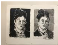
Madame Manet (Nevermind) , 2017 Indian ink and red pencil on paper 43 1/4 x 57 1/4 in. (110 x 145.5 cm) (each) Unique No. 19779