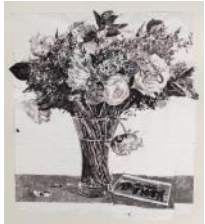
The Execution of Maximilian , 2017 Indian ink, red pencil and torn paper 128 11/16 x 114 1/8 in. (327 x 290 cm) Unique No. 19768