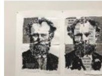
Manet (Whispering in the Leaves) , 2017 Indian ink, paper collage, digital print and red pencil on paper 43 1/4 x 57 1/4 in. (110 x 145.5 cm) (each) Unique No. 19777