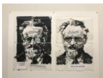
Trotsky (Love Songs from the Last Century) , 2017 Indian ink, digital print and red pencil on paper 43 1/4 x 57 1/4 in. (110 x 145.5 cm) Unique No. 19773