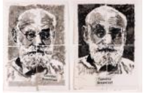
Pavlov (Twins) , 2017 Indian ink, paper collage and red pencil on paper 43 1/4 x 56 11/16 in. (110 x 144 cm) Unique No. 19793