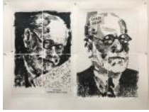
Freud (Cold Soup) , 2017 Indian ink, paper collage, digital print and red pencil on paper 43 1/4 x 57 1/4 in. (110 x 145.5 cm) Unique No. 19775