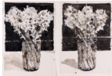
Hyacinths (Consol Jar) , 2017 Indian ink, paper collage and red pencil on paper 43 1/2 x 56 11/16 in. (110.5 x 144 cm) Unique No. 19788