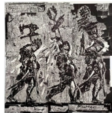
Mantegna , 2016 Triumphs and Laments Series Woodcut printed from 12 woodblocks onto 21 sheets of various sizes of Somerset Soft White, 300 gsm 77 15/16 x 78 11/16 in. (198 x 200 cm) Edition of 12+ 4 APs No. 18156