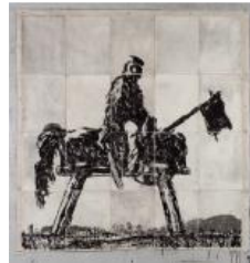
Garibaldi , 2016 Triumphs and Laments Series Lift Ground Aquatint etching on 100% Hemp Phumani handmade paper (made by Dumisani Dlamini), mounted on raw cotton cloth. 64 1/8 x 61 3/8 in. (163 x 156 cm) Edition of 10 + 1 AP No. 19795