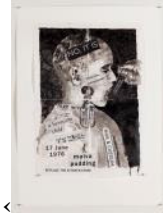
Pavlov's Patient (Malva Pudding) , 2017 Indian ink, torn paper, digital print and red pencil on paper 43 1/4 x 31 7/16 in. (110 x 80 cm) Unique No. 19792