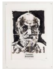
Pavlov (Tuesday Breakfast) , 2017 Indian ink, torn paper, digital print and red pencil on paper 43 1/4 x 31 7/16 in. (110 x 80 cm) Unique No. 19791