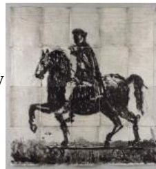
Marcus Aurelius , 2016 Triumphs and Laments Series Lift Ground Aquatint etching on 100% Hemp Phumani handmade paper (made by Dumisani Dlamini), mounted on raw cotton cloth. 64 1/8 x 61 3/8 in. (163 x 156 cm) Edition of 10 + 1 AP No. 19794