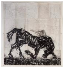
Triumph of Bacchus , 2016 Triumphs and Laments Series Lift Ground Aquatint etching on 100% Hemp Phumani handmade paper (made by Dumisani Dlamini), mounted on raw cotton cloth. 64 1/8 x 61 3/8 in. (163 x 156 cm) Edition of 10 + 1 AP No. 19796