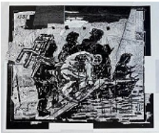
The Flood , 2016 Triumphs and Laments Series Woodcut printed from 10 woodblocks onto 15 sheets of various sizes of Somerset Soft White, 300 gsm. 71 1/4 x 83 13/16 in. (181 x 213 cm) Edition of 12+ 4 APs No. 19786

O Sentimental Machine continues in the exhibition space of the Librairie Marian Goodman 66, rue du Temple