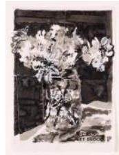
Hyacinths (We Also Let Blood) , 2017 Indian ink, paper collage, digital print and red pencil on paper 43 1/2 x 30 5/16 in. (110.5 x 77 cm) Unique No. 19790