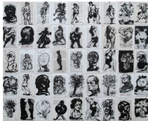
Pocket Drawings 187-241 , 2016 3-run lithographic print on 63 panels, mounted on cotton fabric 31 9/16 x 38 9/16 in. (80.3 x 98.1 cm) Edition of 25 + 3 APs No. 18155