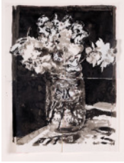
Hyacinths (Flowers for Fanon) , 2017 Indian ink, paper collage and red pencil on paper 43 1/2 x 31 7/16 in. (110.5 x 80 cm) Unique No. 19789