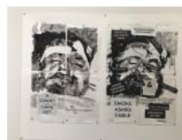
Trotsky (Smoke Ashes Fable) , 2017 Indian ink, paper collage digital print and red pencil on paper 43 1/4 x 57 1/4 in. (110 x 145.5 cm) Unique No. 19782