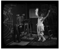
O Sentimental Machine , 2015 5 channel HD video installation with 4 megaphones, sound; 9 min. 55 sec. Music by Phillip Miller Edition of 9 + 3 APs No. 18357