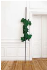
LUCIANO FABRO Italia All'asta , 1994 Iron sheet and green varnish 335.5 x 71.2 x 9.5 cm Edition of 6 No. 17631