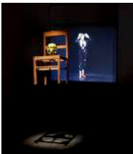
BRUCE NAUMAN Shit in your Hat - Head on a Chair , 1990 Wood, wax, screen and video installation Duration: 62 minutes 25 seconds Dimensions variable No. 17473 Loan courtesy of "la Caixa" Collection of Contemporary Art