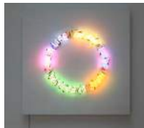
BRUCE NAUMAN Life and Death , 1983 Neon 157 x 157 x 20 cm No. 17472