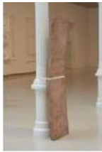
LUCIANO FABRO Nudo (Prigione) , 1987 Red Verona marble 181 x 46.6 x 15.5 cm No. 17629