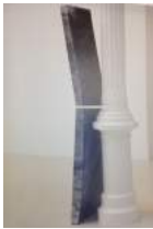
LUCIANO FABRO Nudo (Prigione) , 1987 Bardiglio marble 173 x 44.8 x 15.3 cm No. 17630