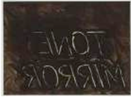
BRUCE NAUMAN Tone Mirror , 1975 Colour lithograph 76 x 101.6 x 2 cm Edition of 100 No. 0330