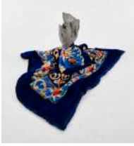
JEAN-LUC MOULÈNE Untitled (Ox lungs) , 2014 Waxed, polished concrete, steel and acrylic blanket 28 x 31 x 82 cm No. 17584