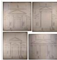
LUCIANO FABRO Ogni ordine è contemporaneo d'ogni altro ordine: quattro modi d'esaminare la facciata del SS. Redentore a Venezia (Palladio) (Every order is contemporaneous with every other order. Four ways of studying the facade of the Church of the Holy Redeemer in Venice (Palladio)) , 1972 51 sheets; silkscreen on paper 213.7 x 254 cm, 213.8 x 253.3 cm, 279.6 x 242.2 cm, 233 x 242.5 cm Edition of 120 No. 16801