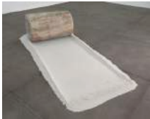
LUCIANO FABRO Sisifo – A (onice) , 1994 Onyx and flour 97.2 x 58.6 x 58.6 cm Dimensions variable No. 16757