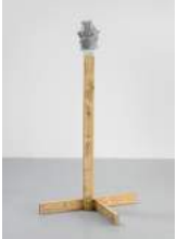
JEAN-LUC MOULÈNE Janus, Paris , 2014, 2014 Concrete, iron, wood 166 x 90 x 50 cm No. 17606