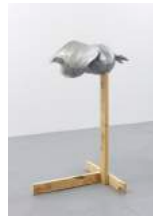
JEAN-LUC MOULÈNE Gymnaste, Paris, summer 2013, 2013 Steel, foam, wood, epoxy, plaster 140 x 72 x 90 cm NO. 17583