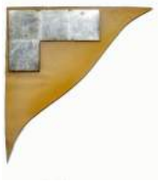
JEAN-LUC MOULÈNE 4tet , 2012 Silicone and silver leaf 48 x 45 cm No. 17739