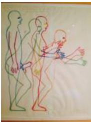
BRUCE NAUMAN Welcome to L.A. , 1985 Graphite, watercolour and acrylic on paper 198 x 178 cm No.17632