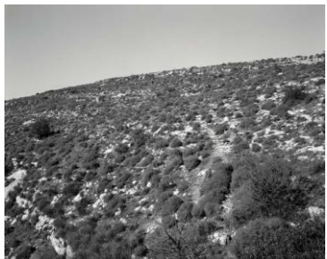
Hillside, Sicily November, 2007 Black and white gelatin silver print 101 x 125 x 2 1/2 in. (256.54 x 317.5 x 6.35 cm) Edition of 4 [11896]