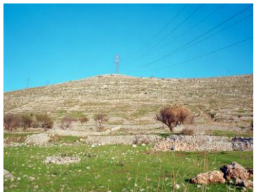
Hillside near Ragusa, 2007 Chromogenic print 92 1/4 x 120 1/2 x 2 in. (234.32 x 306.07 x 5.08 cm) Edition of 3 + 1 AP [13566]