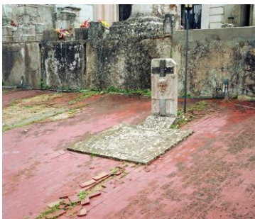
Headstone on an Ossuary, Sicily, 2008 Ink-jet print 61 3/4 x 72 1/4 x 2 in. (156.85 x 183.52 x 5.08 cm) Edition of 5 [12398]