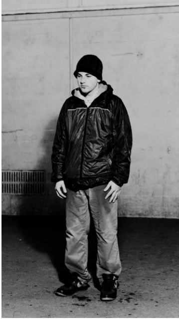
Young Man Wet with Rain, 2011 Silver gelatin print 111 7/8 x 62 1/2 x 2 1/2 in. (284.16 x 158.75 x 6.35 cm) Edition of 4 + 1 AP [13261]