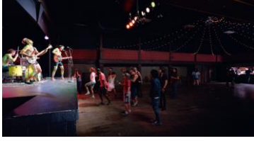
Band and crowd, 2011 Colour photograph 92 1/2 x 168 3/4 x 2 in. (234.95 x 428.63 x 5.08 cm) Edition of 3 + 1 AP [13394]