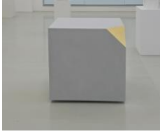
Così com'è, grigio, 2006 Color impasto on wood, gold leaf 31 1/2 x 31 1/2 x 31 1/2 in. (80 x 80 x 80 cm) No. 20919