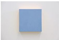
Oltremare, oro, 2018 Color impasto on board, gold leaf 17 3/4 x 17 3/4 x 3 1/2 in. (45 x 45 x 9 cm) No. 20917