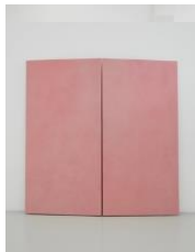
Porpora, 2016 Color impasto on board, gold leaf 2 elements: 110 1/4 x 55 1/8 x 1 5/8 in. (280 x 140 x 4 cm) (overall) No. 20904