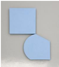
L'altro per l'una, 2018 Color impasto on board 2 elements: 23 5/8 x 23 5/8 x 1 5/8 in. (60 x 60 x 4 cm) (each) No. 20910