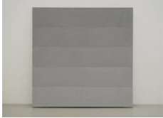
Sfumato, grigio, 2018 Color impasto on board 78 3/4 x 78 3/4 x 1 5/8 in. (200 x 200 x 4 cm) No. 20905