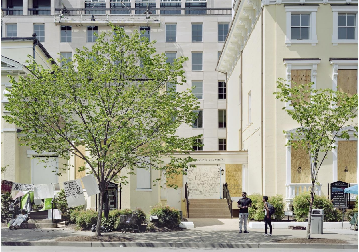
“St. John’s Church, Lafayette Square, Washington D.C., 2020.”