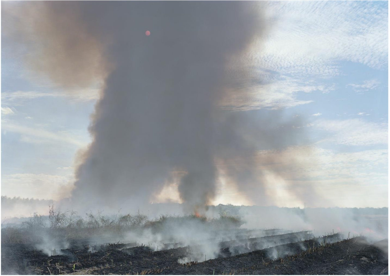
"Sugar Cane Field, November 5, Houma, Louisiana, 2016."