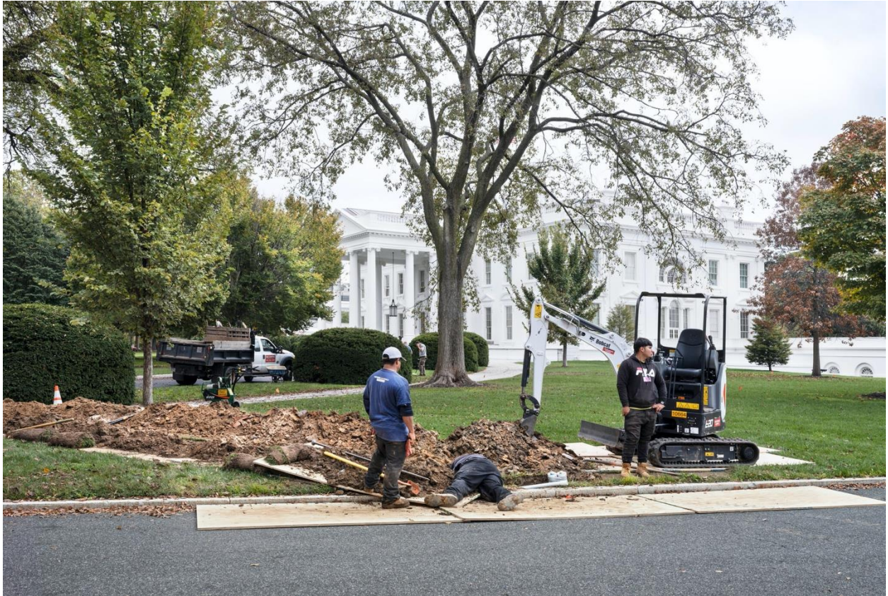
"Reinstallation of the Irrigation System, White House North Grounds, Washington, D.C., 2020."