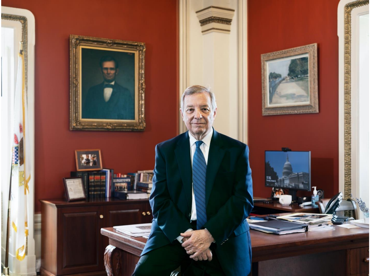
“Senator Dick Durbin, the Minority Whip, in his Capitol Office, Washington, D.C., 2020”