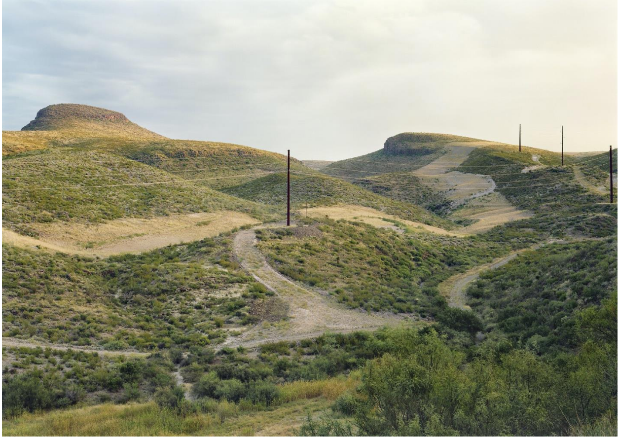
"Land Scars From the Trans-Pecos Pipeline, Marfa, Texas, 2019."