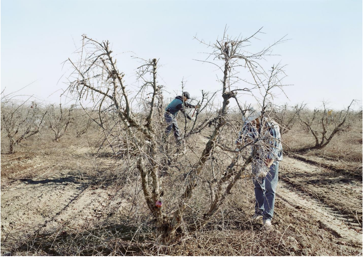
"Migrant Workers Pruning Pomegranate Trees, Mendota, California, 2018."