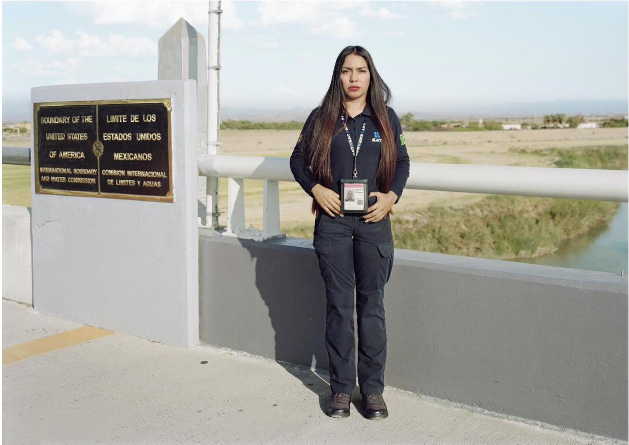
"Mexico Customs and Border Protection Officer, Presidio-Ojinaga International Bridge, Ojinaga, Mexico, 2019."