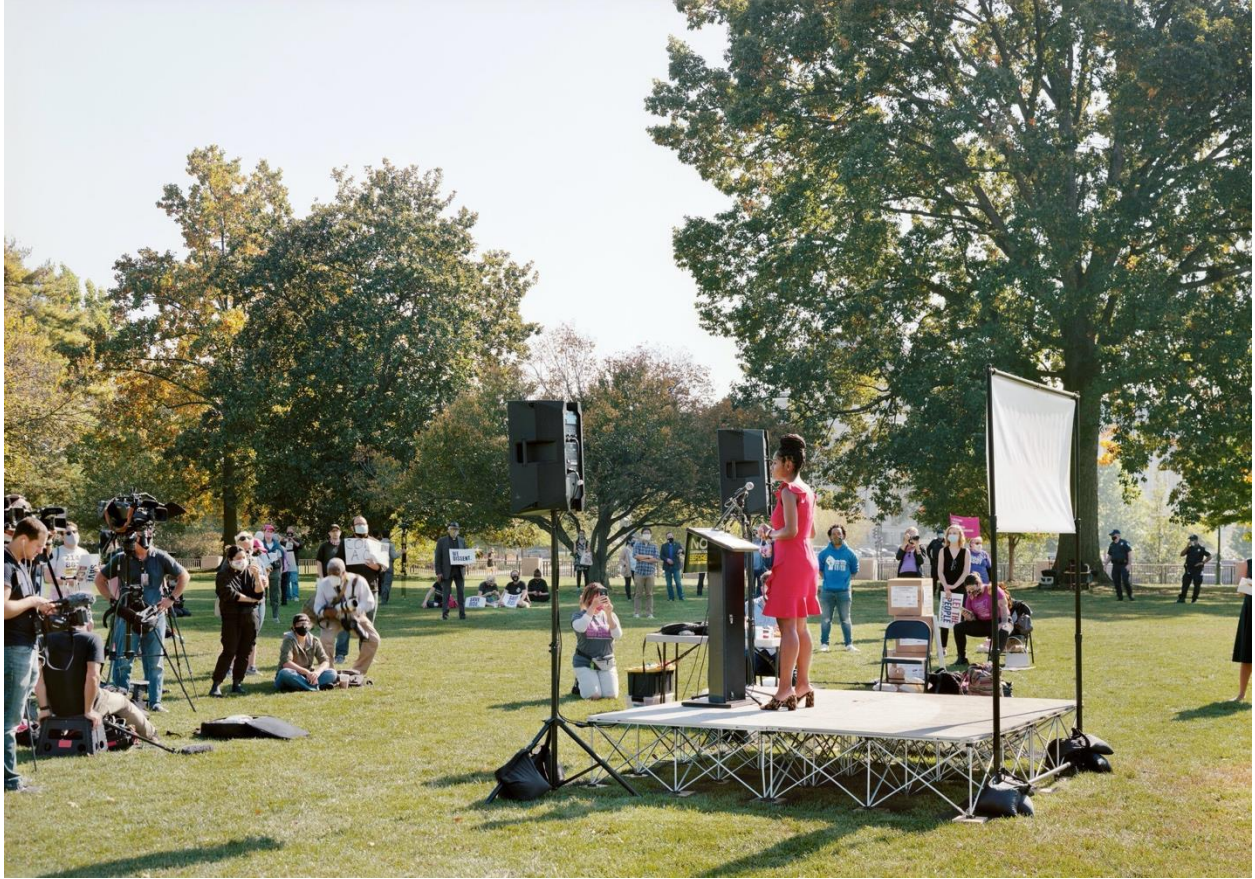
“‘No Confirmation Before Inauguration’ Rally Speech by Volunteer Patient Advocate for Planned Parenthood, U.S. Capitol Grounds and Arboretum, Washington, D.C., 2020.”