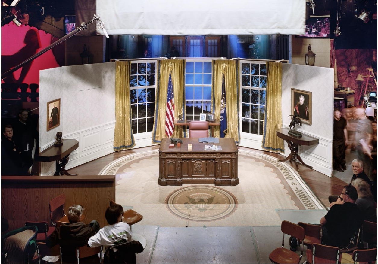
"Oval Office Set, 'Saturday Night Live,' NBC Studios, New York, N.Y., 2018."