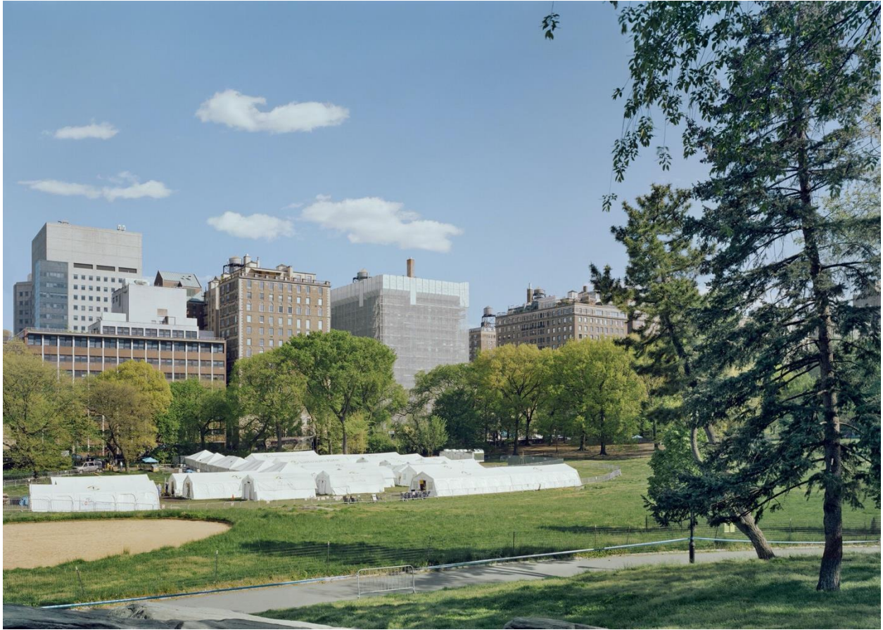
"Field Hospital Tents, Central Park, New York, N.Y., 2020."