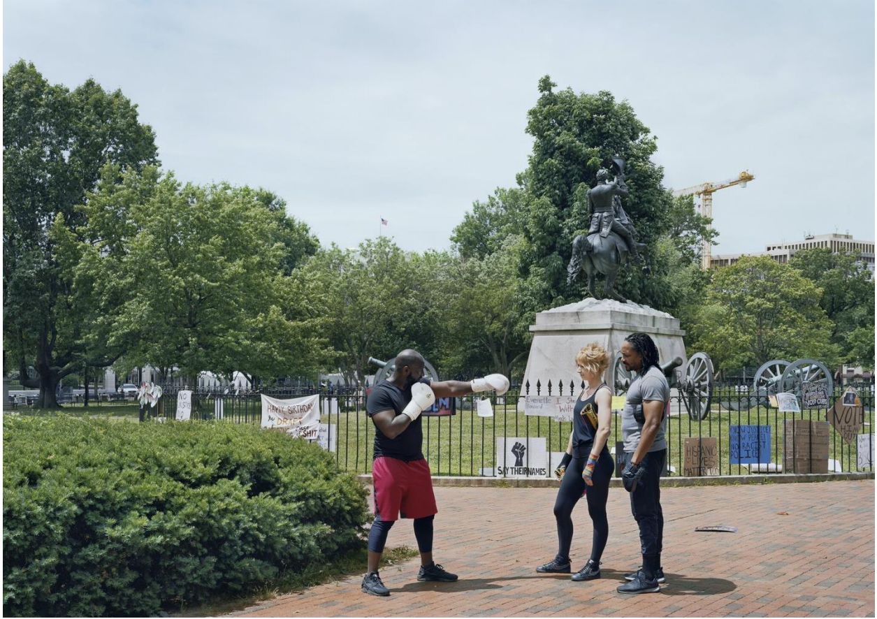
"Andrew Jackson Statue (Boxer), Lafayette Square, President's Park, Washington, D.C., 2020."