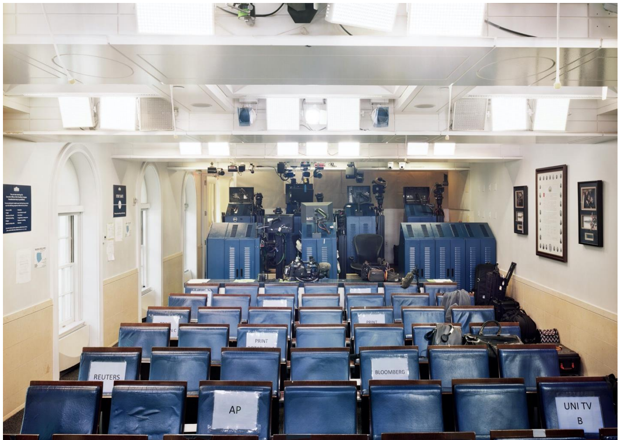
"James S. Brady Press Briefing Room, The White House, Washington, D.C., 2020."

There are many types of power and means of taking measure of the powerful. Many of my photographs are made out of a profound sense of powerlessness but also out of a desire to locate power and authority in unexpected places: in the natural world, in a solitary border patrol officer or in the intimacy and strength of a family under a bridge that connects the United States to Mexico. These images are reminders to me that our American landscape and the communities within it transcend this cultural and political moment.