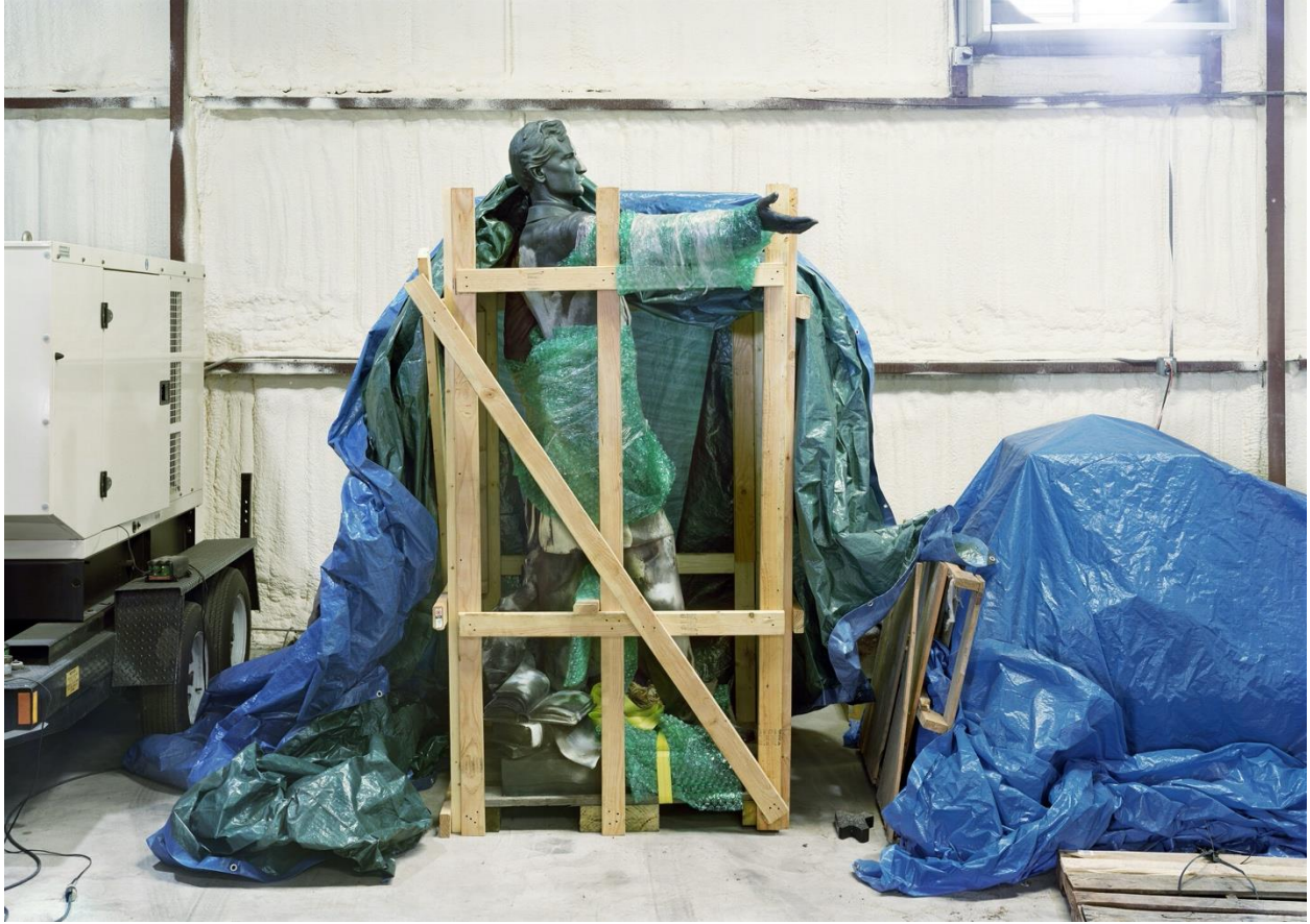
"Jefferson Davis Monument, Homeland Security Storage, New Orleans, Louisiana, 2017."