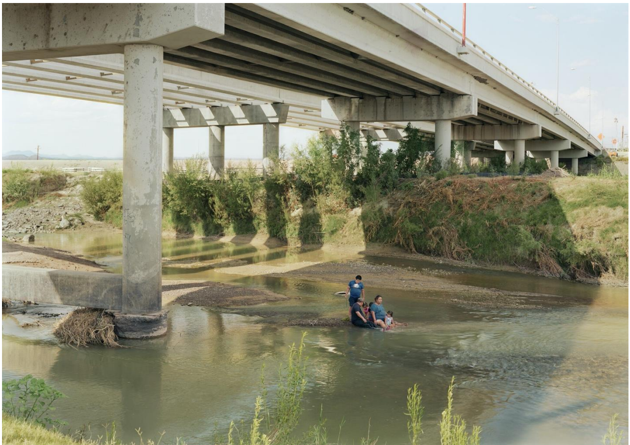
"Family Under the Presidio-Ojinaga International Bridge, Texas-Mexico Border, 2019."