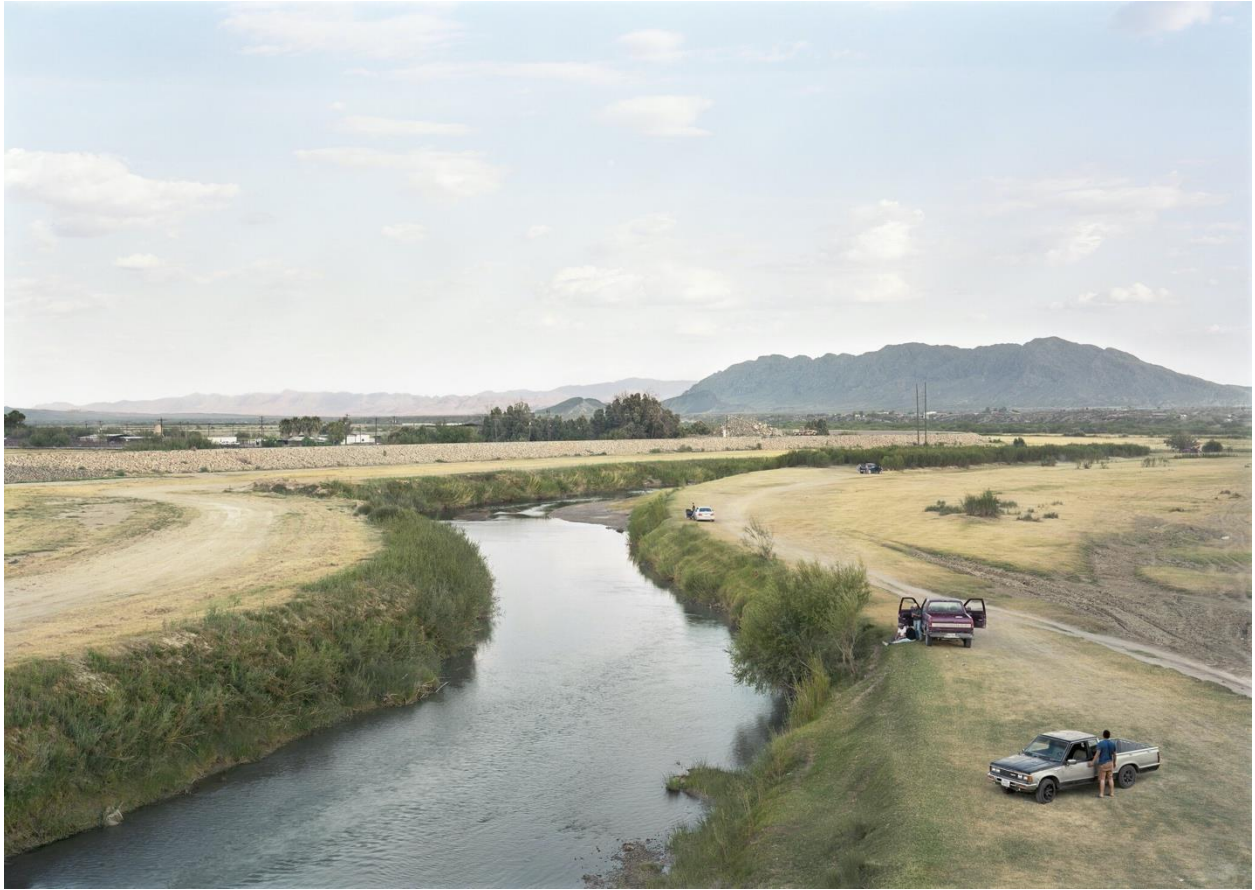
"Cars along the Rio Grande, U.S.-Mexico border, Ojinaga, Mexico, 2019."