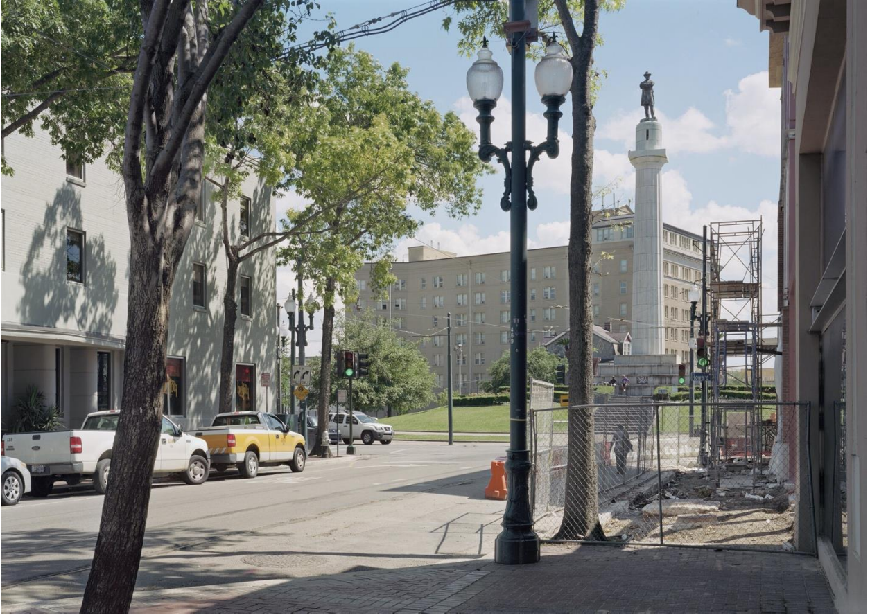
"General Robert E. Lee Monument, New Orleans, Louisiana, 2016."