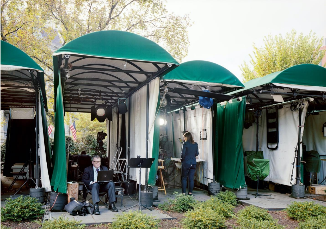
“Correspondent From Al Jazeera English Language Channel and Presenter for Al Jazeera Arabic Language Channel, The White House, Washington, D.C., 2020.”