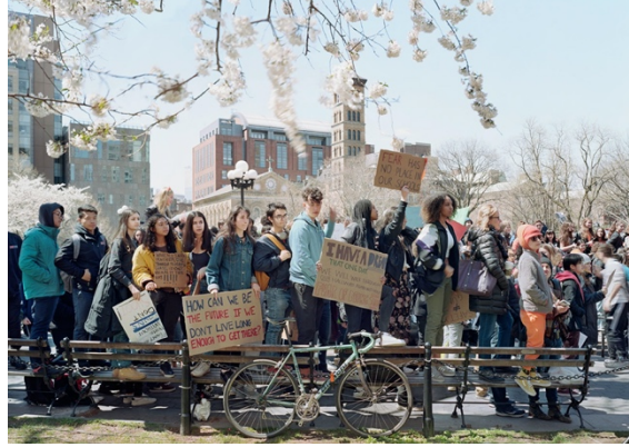
An-My Lê: Fragment VII: High School Students Protesting Gun Violence, Washington Square Park, New York, 2018 ; from 'Silent General'

Getting out there and bearing witness has been much more complicated during the pandemic. I've been taking care of my teenage children, cooking for the family, and of course tending to our supplies. I was embroidering and listening to Julia Kristeva talk about Fyodor Dostoevsky on French radio recently, and I just started reading The Brothers Karamazov . It's thrilling to me how Dostoevsky's characters are so specifically of his time and culture while also universal—particularly in relation to our current conversation about cultural narratives.