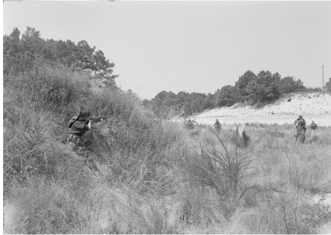
An-My Lê: Sniper I, 1999–2002; from ‘Small Wars’

Lê has continued to engage with the American war machine in projects like “29 Palms” (2003–2004), which looks at marines training for war in the southern Californian desert not far from where I live, and “Events Ashore” (2005–2014), about life on US Navy ships. What I see in her work—including her current series, “Silent General” (2015–present)—is a deep curiosity about this country’s military-industrial complex, from its personnel to its technology, and also about the invisible ideology that connects it to the lives of the overwhelming majority of Americans who do not serve in the military but are nevertheless a part of the war machine.