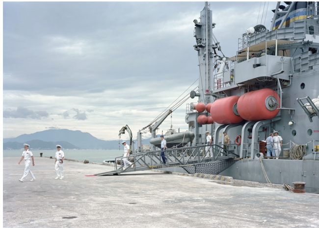
An-My Lê: American Sailors Returning to Vietnam, First US Naval Exchange Activities with Vietnam People's Navy, Da Nang, Vietnam, 2011 ; from 'Events Ashore.' It appears in An-My Lê: On Contested Terrain.

An-My Lê first came to my attention through her photographs of American men whose pastime was to reenact battles from the American war in Vietnam, where both Lê and I were born. I was immediately taken with her work, partly because of its artistry and wit, and partly because I was obsessed with the war. The images from her series "Small Wars" (1999–2002) capture the sincerity and the silliness of grown men donning costumes to play at war. They also evoke, perhaps, the sincerity and the silliness of the entire American war effort, if silliness could be used to describe such a tragic event.