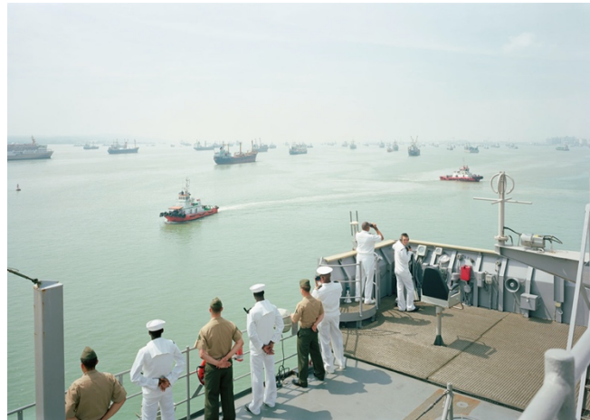
An-My Lê: Manning the Rail, USS Tortuga, Java Sea, 2010 ; from “Events Ashore”

Like many political refugees who have been evacuated from zones of conflict and brought to safety, I have experienced the military as a very ambiguous and polarizing force, and that’s what I wanted to explore in my work. For “Events Ashore,” I traveled across the globe with the US Navy over a period of nearly a decade. This experience provided me with opportunities to explore what was in my mind a very ill-defined military-industrial complex.