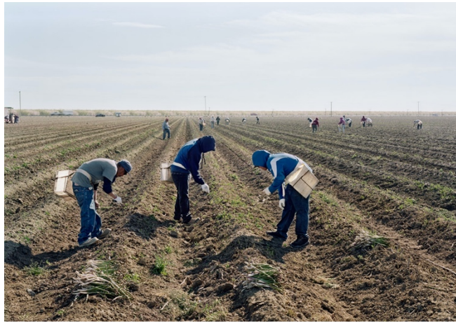
An-My Lê: Fragment II: Migrant Workers Harvesting Asparagus, Mendota, California, 2019; from ‘Silent General’

My road trip is not unlike a literary project that unfolds as you go. First, I traveled to Louisiana to photograph contested Confederate monuments. Then I went to the Central Valley in California to photograph migrant workers, and from there, I made my way to El Paso and the Mexico–Texas border. In 2020 I spent time in Washington, D.C., retracing the steps of the Black Lives Matter protesters after the murders of George Floyd and Breonna Taylor and staking out the White House and US Capitol grounds around election time. My work has always been adjacent even though very close to headline news. I tend to be on location before or after the event, but seeing footage of the mob storming the Capitol made me wish I’d been there. It was terrifying to see the seat of government being overrun and the lawmakers and staffers escaping. I don’t mean to be glib but I couldn’t help but think of the Fall of Saigon or the Russians planting their flag on the Reichstag.