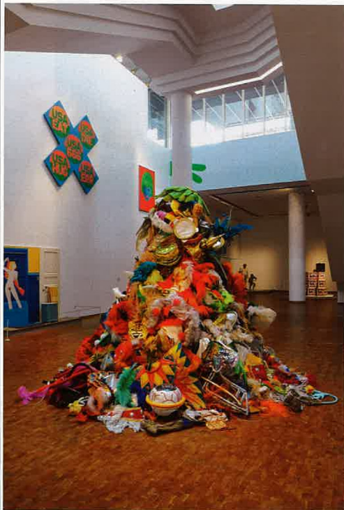
Left: Fraser's installation "Um Monumento às Fantasier Descartadas" ("A Monument to Discarded Fantasies," 2003). Below: a still from Fraser's "Museum Highlights: A Gallery-Talk" (1989), with the artist in character as a docent at the Philadelphia Museum of Art. Opposite: a still from "Projection" (2008).

but dogged attempts to change audiences and the larger ecosystems they inhabit. And, if the events of the past year are any indication, these provocations have worked — even if most audiences don't fully realize that the world has caught up to Andrea Fraser.