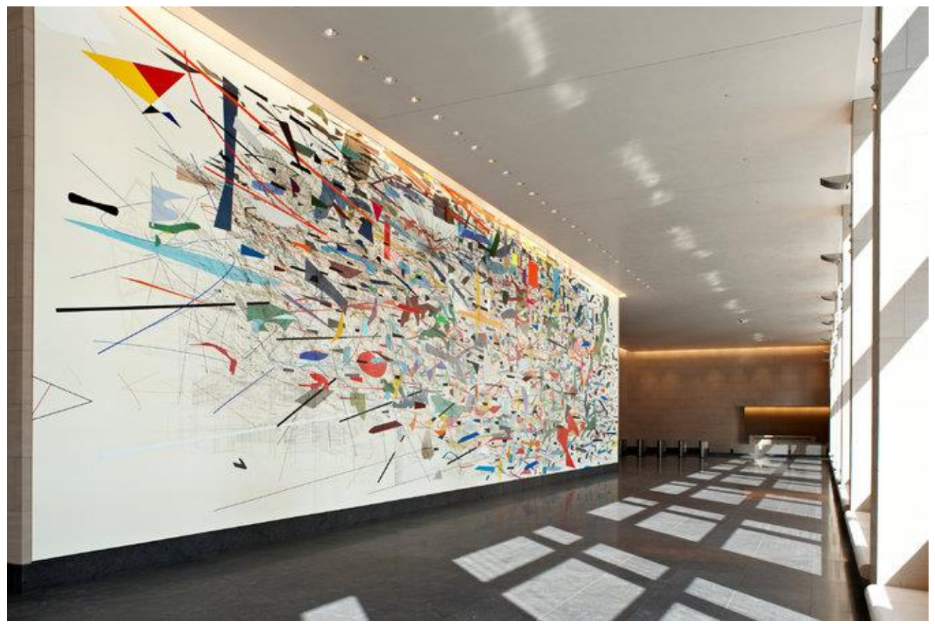
Ms. Mehretu's mural for Goldman Sachs.

When Ms. Mehretu visited the San Francisco museum, its two looming white walls and the luminous California location led her to think about American landscape paintings, bathed in glowing light, that commemorated the dream of this country's westward expansion in the mid-19th century.