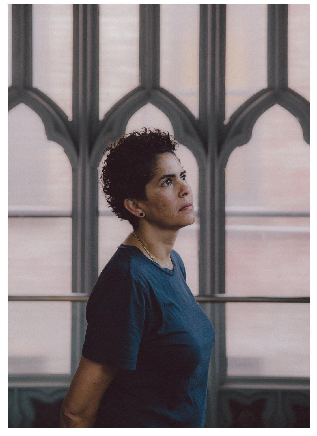
Ms. Mehretu is one of the top-selling living female artists.