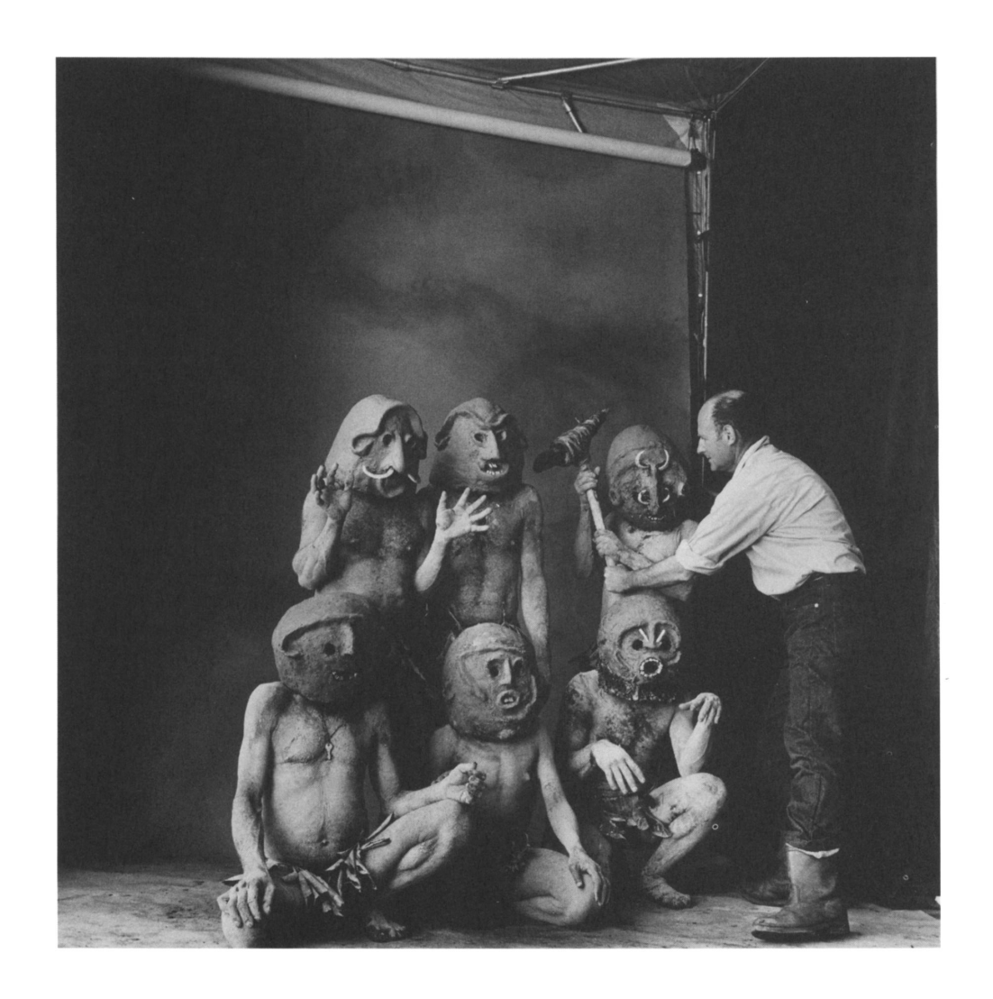
Lisa Fonssagrives-Penn. Irving Penn at Work with Six Mudmen. New Guinea, 1970. © 1974 by Irving Penn.