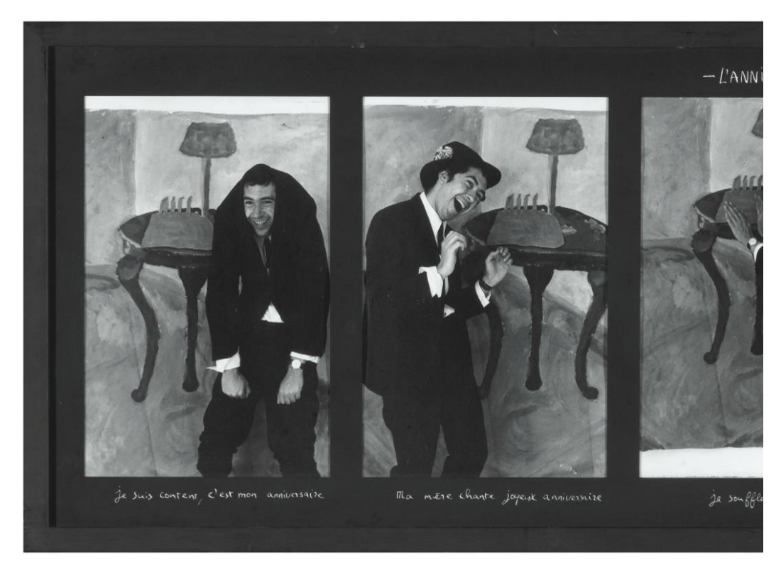
3 Christian Boltanski, 'L'anniversaire', from Saynètes comiques, 1974. Five gelatin silver prints mounted on board, handwritten text, 37.9 x 112.6 cm. Paris: Musée national d'art moderne, Centre Pompidou. Reproduced by courtesy of the artist. Photo: Philippe Migeat/bpk/CNAC-MNAN/ Christian Boltanski.

Uses of Photography in Christian Boltanski's Early Work (1969-75)