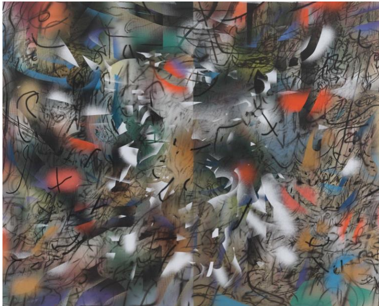
Julie Mehretu, Haka (and Riot) , 2019. Ink and acrylic on canvas, 144 x 180 inches. Los Angeles County Museum of Art; gift of Andy Song. Photo: Tom Powel Imaging. © Julie Mehretu.