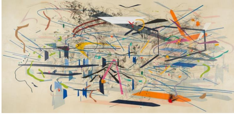
Julie Mehretu, Retopistics: A Renegade Excavation , 2001. Ink and acrylic on canvas, 101 1/2 x 208 1/2 inches. Crystal Bridges Museum of American Art.

Mehretu: Well, again, this painting was made in that moment when we recognized 9/11 as the seismic shutdown of that globalist technological utopianism, that form of optimistic international engagement by the United States, especially in the framework of globalism and neo-capitalism. I was working at Denniston Hill, in upstate New York, and it was the first painting of this scale. There are about three layers of acrylic emulsion sprayed over painted shapes and forms with various colors and drawn lines in each layer, so at the end they all became one, a unified and embedded surface. The attempt to create this interconnected possible space, where all of these references—from airport plans, maps, subway charts, skyscrapers, to interiors and exteriors of buildings from various cities, and I should mention also the intense clash between architecture and drawing, and so on—are being questioned, digested every step of the way.