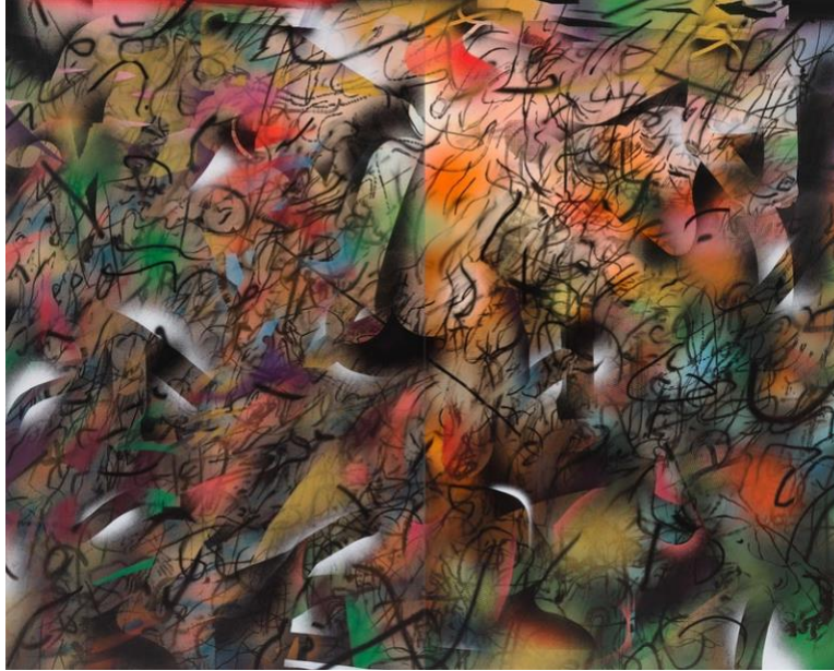
Julie Mehretu, Ghosthymn (after the Raft) , 2019–21. Ink and Acrylic on canvas, 144 x 180 inches. Photo: Tom Powel Imaging. Courtesy the artist and Marian Goodman Gallery, New York. © Julie Mehretu.

Mehretu: That was painted just two weeks before George Bush’s Shock and Awe bombing campaign. It was meant to play with the language of propaganda and what was happening at the time, along with the failures of utopian desires, and so on. It’s a painting of a map of another painting that I made, it’s again playing with the language of mapping. What I did was to take the large panoramic drawing schema from the painting Transcending: The New International (2003) and map all of that in photoshop. I then drew over the maps with all kinds of various forms of utopian architecture, whether it was the plans for the development of the city Brasilia in Brazil, or the Guggenheim, among other buildings of similar aspiration. This painting is reminiscent of propaganda posters and signage, of futurist dystopic mapping of as the title says, “Looking Back to a Bright New Future.”