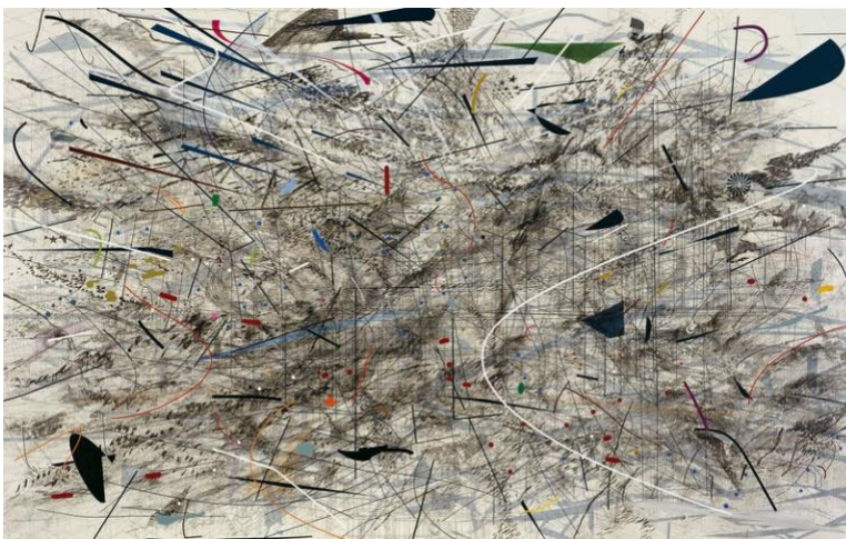
Julie Mehretu, Black City , 2007. Ink and acrylic on canvas, 120 x 192 inches. François Pinault Collection. © Julie Mehretu.

Rail: Be it Liberty leading the people or the Goddess Colombia leading the frontiers to fulfill Manifest Destiny, I've always been perplexed by this notion of the psychological differences between soft and hard, female and male, for example, why do we refer to Mother Nature and the Fatherland. At any rate, what was your decision in deploying zillions of layers of ink drawing to create paintings such as Project from 2006?