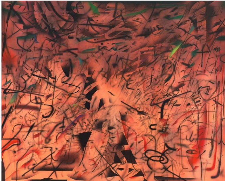
Julie Mehretu, Hineni (E. 3:4) , 2018. Ink and acrylic on canvas, 96 x 120 inches. Centre Pompidou, Paris, Musée national d'art moderne/Centre de création industrielle; gift of George Economou, 2019. Photo: Tom Powel Imaging. © Julie Mehretu.

in Haka (after riot) from 2019. In other words, after the underpainting gets sprayed and blurred, which in some cases it's digitized and screen printed onto the painting with two different conflicting halves come together in the middle. It's definitely a challenge to integrate these two sides, but the longer I let the gestures work into the painting as a dance, the better the painting becomes at the end. It's a matter of trusting the rhythm between myself and the painting.