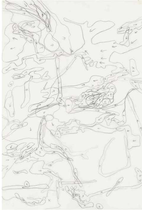
Julie Mehretu, Migration Direction Map (large), 1996. Ink on mylar, 22 x 15 inches. Private collection.

Mehretu: As the marks evolved and behaved differently, I began to think of them as social agents. And then as they appeared more and more like maps and clustering in different social gatherings, different directions, I started to take pieces of mylar and put it over those drawings, tracing over those different clusters. There tends to be certain kinds of formal structures that emerge similarly in the early paintings, whether they're clustered around a vortex, whether it becomes an entropic system, or as I saw somebody put in the chat "the Cloud of Unknowing", it all evolves and gets honed by intuition that responds to different space differently. I really think of intuition as an ontological congregation of of resistance, of the ancestral and the embodied. I remember thinking of those early drawings and the paintings as psychic spaces of knowing, as they embodied experiences of time, past and present, and spaces of ancestry and culture, and so one, all of which seem to co-exist simultaneously. I'd now describe what I was doing at the time as maps of the subconscious.