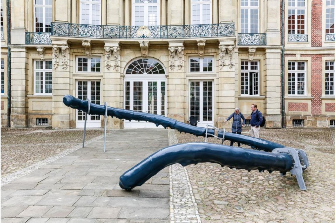
Nairy Baghramian, Beliebte Stellen / Privileged Points (2017). Skulptur Projekte Münster (10 June–1 October 2017).

The whole idea of occupying a site and how representative that permanent idea can become—that was what I was questioning. The questions I had were not only directed to others, but also to sculpture itself. Privileged Points is an overpainted sculpture made out of bronze—a material that is representative of public sculpture, historically. To keep Privileged Points in a state of temporality was to address that question: what is sculpture? What is the burden of sculpture? What is the power of a sculpture occupying a site? Those are all problems that I've had with sculpture and that keeps me doing sculpture—all those troubled questions are embedded in it.