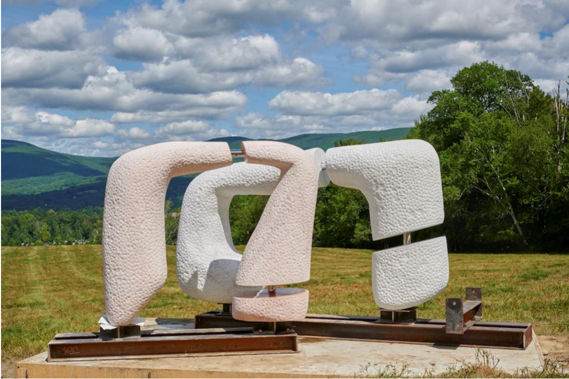
Installation of Knee and Elbow in process, August 2020.