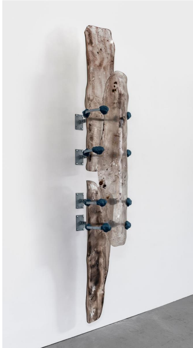
Nairy Baghramian, Dwindler_Sludge (2018). Glass, zinc coated metal, coloured epoxy resin. 327 x 57 x 71 cm. Courtesy of the artist and Marian Goodman Gallery.

Digging through art history as a young artist, I had the impression that certain art genres were always assigned to specific groups of people. At that time, I became aware that postcolonial art or identity politics were expected from me, because of my biography as a woman and as a political refugee from Iran. At the very beginning of my work, I had several invitations to participate in exhibitions that were related to these discourses, where I would have been labelled as a young Iranian refugee female artist, whilst I never read anything in relation to, for example, Georg Baselitz, being described as an old East German heterosexual white male artist.