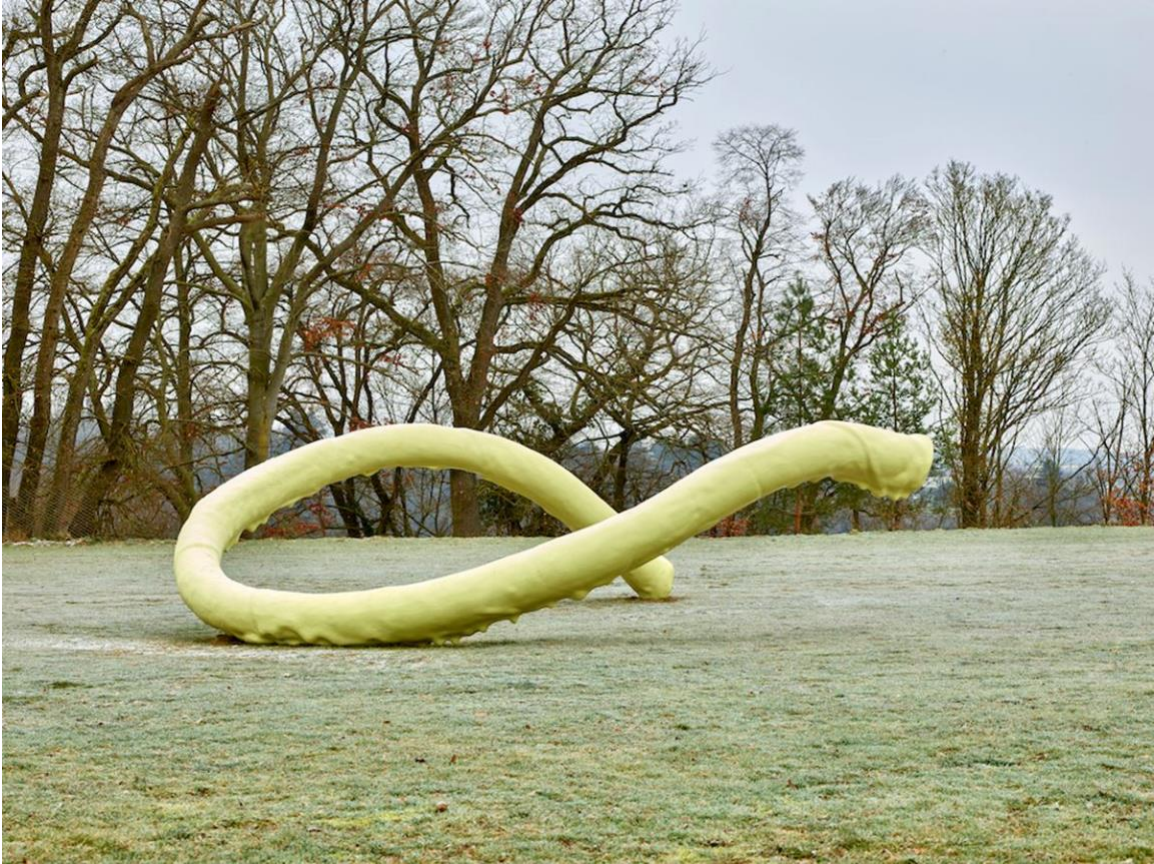
Nairy Baghramian, Beliebte Stellen / Privileged Points (2017). Dimensions variable. Exhibition view: Privileged Points , Mudam – Musée d'Art Moderne Grand-Duc Jean, Luxembourg (19 January–22 September 2019).

PP: Yes. Of course, there is a huge fear of failure. To go back to your earlier point about horizontal history, I think it boils down to an acceptance of impermanence. For a very long time, not only at MoMA but at museums across the United States, in my experience at least, there was a notion or promise of permanence, especially when considering the presentation of a collection.