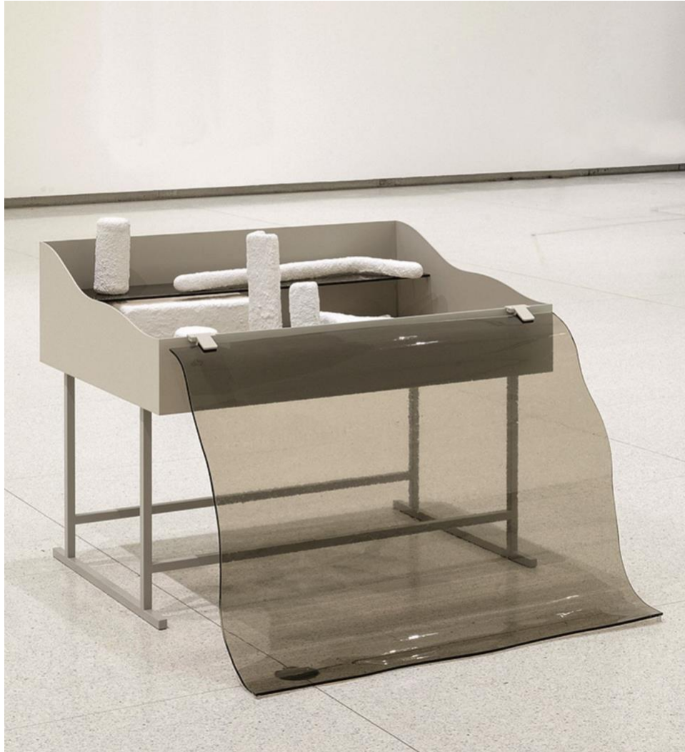
Nairy Baghramian, Formage de Tête (Vitrine Rafraîchirée) (2016). Lacquered metal, glass, porcelain. approx. 101,6 x 124,46 x 144,78 cm (HxWxD). Exhibition view: Déformation Professionnelle , Walker Art Center, Minneapolis (8 September 2017–5 February 2018).

The Knee and Elbow are formations, made out of roughly chiselled marble and cast and polished stainless steel. In trying to transfer the figurative act into abstraction, I was thinking about the joints as prostheses to trying to understand the inner core of the sculpture.