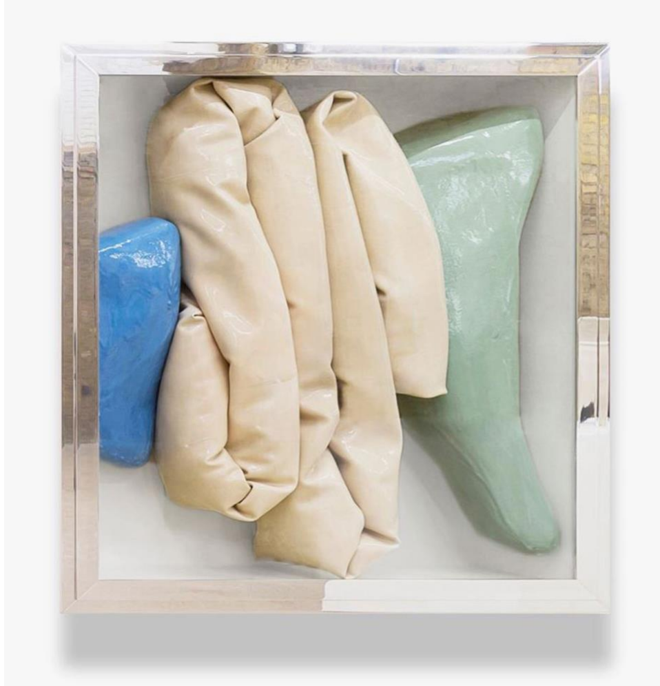
Nairy Baghramian, Gorge (double bend) (2017). Polished and sanded aluminium, glass, epoxy resin, polyurethane foam, fabric, silicon. 128.3 x 116.8 x 38.1 cm. Courtesy of the artist and Marian Goodman Gallery.

Equally important to Baghramian is her relationship to the work of others. She is an explorer with an interest for uncovering hidden histories, giving them her attention, and bringing them to ours. In its most straightforward, the product of her interests can take the form of collaborative projects and exhibitions. In one dialogue, Baghramian worked with fellow sculptor Phyllida Barlow to explore the politics of form at Serpentine Gallery in London (8 May–13 June 2010).