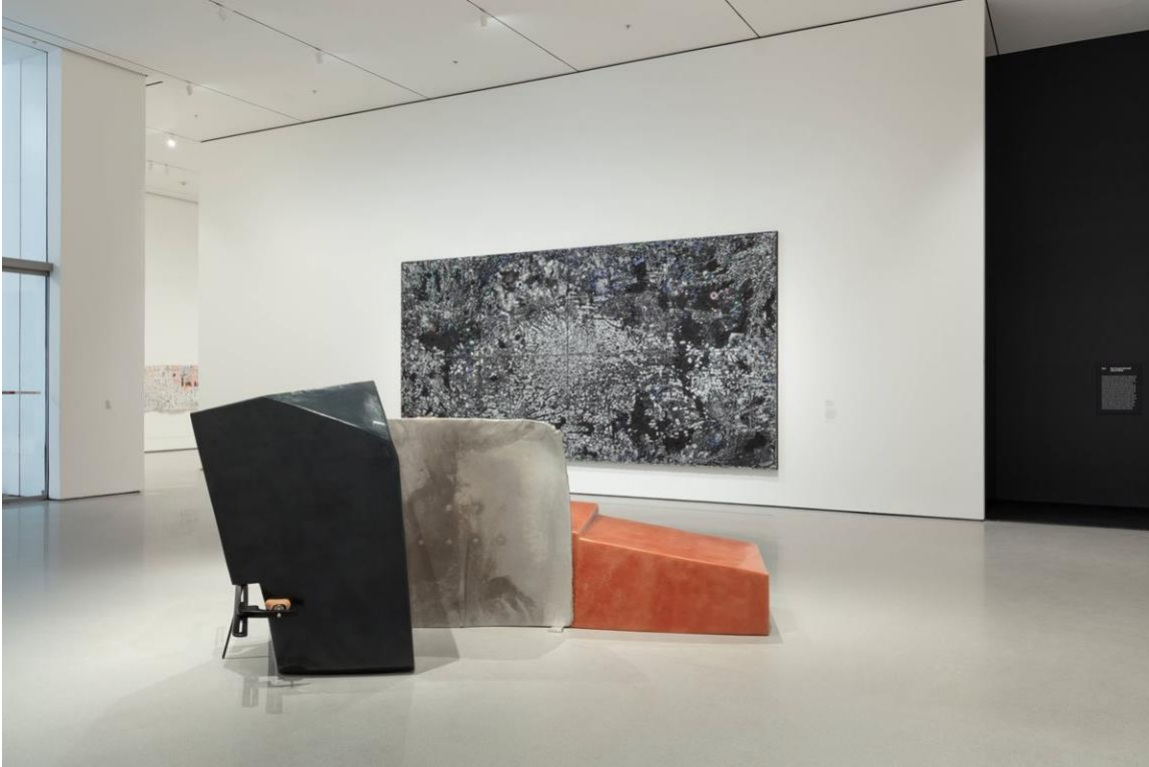
Nairy Baghramian, Maintainers A (2018). Pigmented wax over styrofoam, cast aluminium, and painted aluminum clamp with cork. Overall approximately 164 x 370 x 230 cm. Exhibition view: Worlds to Come , Gallery 215, The Museum of Modern Art, New York. Fund for the Twenty-First Century. © 2020 Nairy Baghramian.

PP: I know we've been chatting throughout this quarantine time, but how have you been? You're in Germany, and that's a country that's handled the pandemic with enviable competency. I would love to hear a little bit about your experience of the last four months.