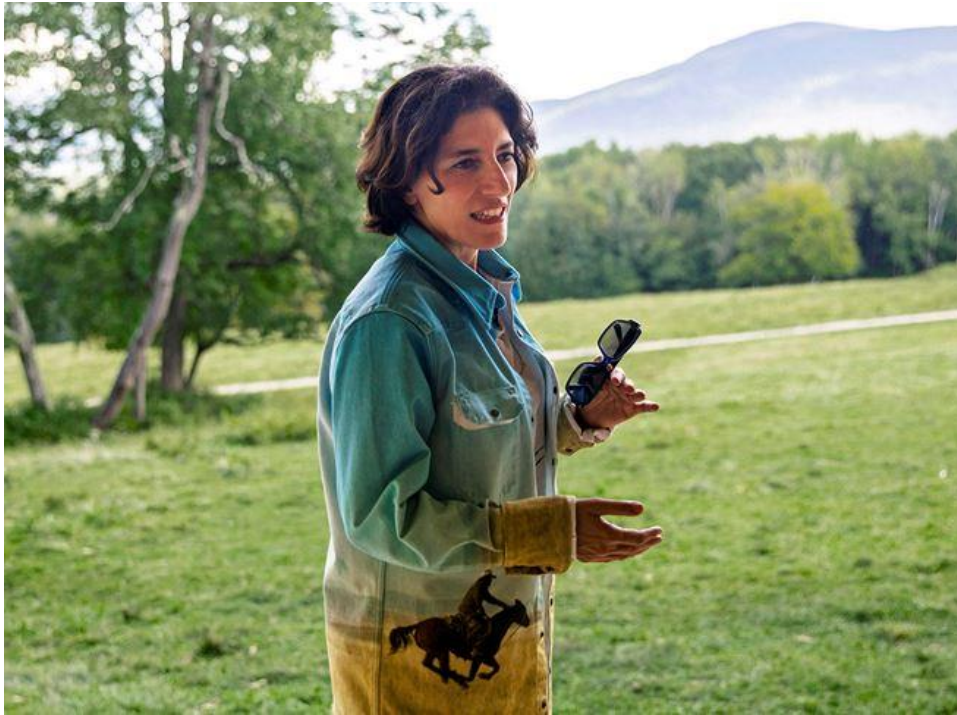
Nairy Baghramian. Courtesy of the artist and Marian Goodman Gallery.

Over a career that spans two decades, Nairy Baghramian has worked across a range of media but primarily focuses on sculpture. Her work can be described as abstract, although it is an abstraction of reality, and specifically the human body, whose forms it consistently evokes.