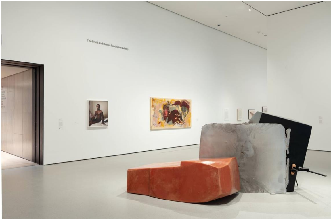
Nairy Baghramian, Maintainers A (2018). Pigmented wax over styrofoam, cast aluminium, and painted aluminium clamp with cork. Overall approximately 164 x 370 x 230 cm. Exhibition view: Worlds to Come , Gallery 215, The Museum of Modern Art, New York. Fund for the Twenty-First Century. © 2020 Nairy Baghramian.

NB: It was an amazing experience to go through the exhibition. I was discussing the first iteration with art historians, artists, and journalists and there was an irritation in the discussion about the canon, and the fact that it triggered confusion and problems and questions meant that it's already a success. Curating should not only be representational—it should also raise questions and create doubts.