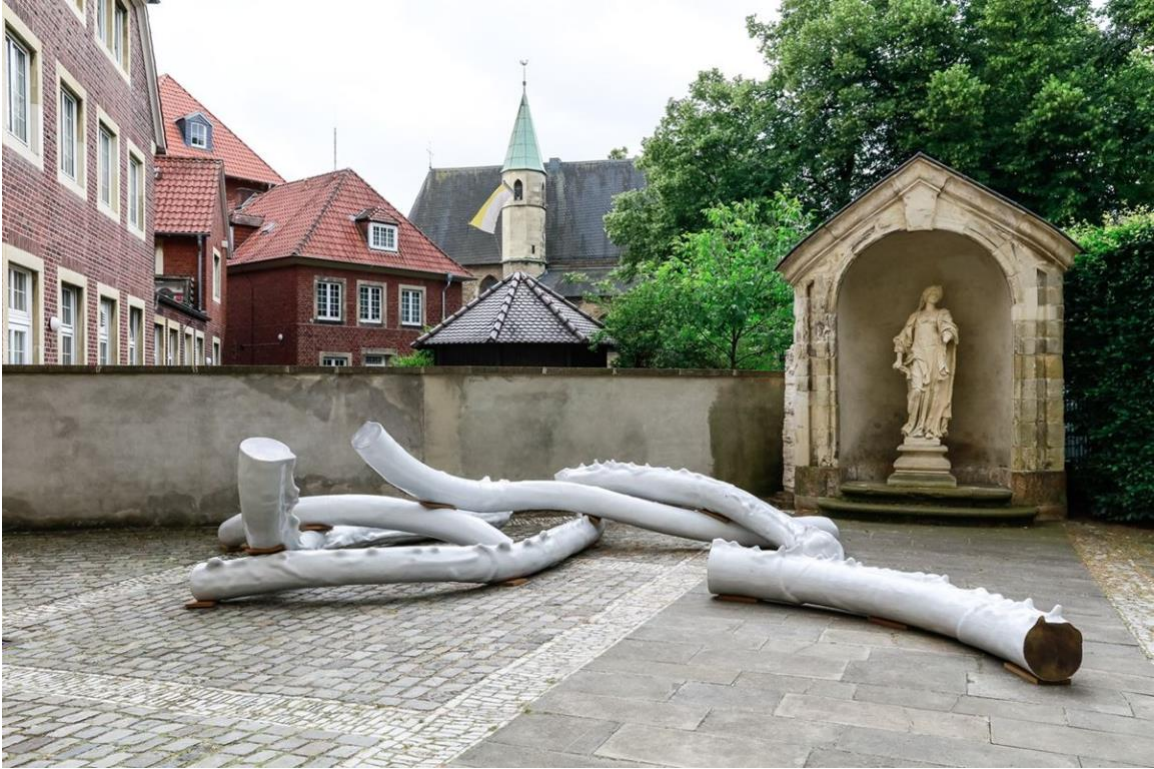
Nairy Baghramian, Beliebte Stellen / Privileged Points (2017). Skulptur Projekte Münster (10 June–1 October 2017).

PP: Regardless of intent, what history has shown is that sculpture is mobile. Permanence is not at all guaranteed; your work acknowledges that and works it into the subject matter.