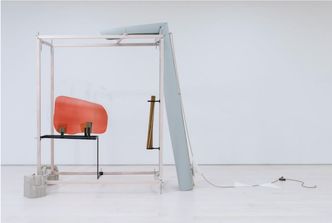
Nairy Baghramian, Drawing Table (Homage to Jane Bowles) (2017). Various materials. Exhibition view: documenta 14, Athens (8 April–16 July 2017). Courtesy of the artist and Marian Goodman Gallery. Photo: © Dimitris Parthimos.

Elbow (2020), explores two parts of the body that carry the weight of the pose as it is rendered in sculpture and painting. By singling them out, the joints are liberated from their function and rendered as abstract entities, void of any physical burden.