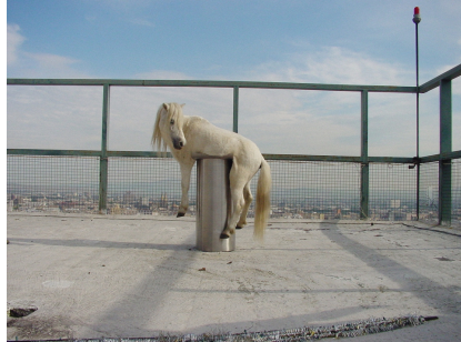
Anri Sala. No Barragán No Cry. 2002.

She's captivating: a young woman with long, flowing hair, filmed in black-and-white, speaks with confidence into a microphone. The way she dresses, in a boxy pantsuit with a floral collar, along with the visual quality of the 16mm film stock, suggest that the footage has been taken sometime in the late 1970s. While holding forth for the interviewer she beams with pride — and with good reason. As the viewer of Anri Sala's 27-minute experimental documentary Intervista (1998) has just seen, the woman has participated in one of her country's major political events, the Congress of the Labour Youth Union of Albania. She has even had the rare privilege of standing shoulder to shoulder with Enver Hoxha, the Supreme Comrade, with the congress hall breaking out into one of the prolonged bouts of metronomic applause that were a regular feature of life under Stalinist regimes.