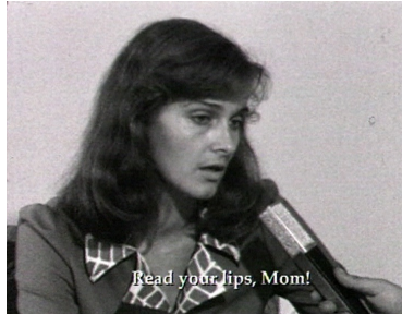
Anri Sala. Intervista. 1998. Video, color, sound. 26 min.

the paranoia and fear that impregnated Hoxha's Albania. The reporter gruffly contends that "my questions were set in advance, as were the answers," and even the lowly sound recorder was terrified of a technical incident occurring when party heavyweights were on camera.