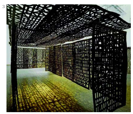
1 Untitled (1987), concrete, iron, glass and tapestry, 230 x 200 x 196cm 2 Fugue in six voices (Diptyque VI) (2007), silkscreen on silk, 250 x 220cm 3 Three Suspended Corridors (detail) (2006), braided wire and steel cables, dimensions variable, installation view: Ludwig Museum, Köln, detail 4 Untitled (Tilted Hanging Ceiling) (1997), iron, resin and stone powder, 15 x 915 x 600cm Opposite: Untitled (Travel Agency) (2001), wood, resin and bronze powder, 2 bas-reliefs and 10 'jealousies', dimensions variable, detail

The dialogues among these London artists extended into central Europe, where artists like Schütte and Jan Vercruysse, for example, were exploring similar concerns. Though they could never be called a group, there was nonetheless a common sensibility. "We all felt part of something, a shared way of thinking or looking at the world," she says. "Each of us was considered an individual and if you look at it now, our voices were not similar. But our work had the common three-dimensional or sculptural aspect, and the use of means and elements that had not been considered before.