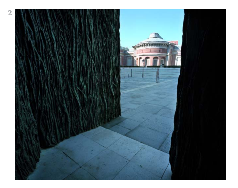
1 Deep Fountain, Antwerp (1997–2006), modified and polychrome cement, 34 x 14m, installation view at Leopold de Wael Platz, Antwerp 2 Threshold-entrance of the new extension of the Prado Museum (2006–07), bronze, 6 x 8.80 x 1.36m Opposite: Cristina Iglesias amid the cast forms inside Double Vegetation Room (2006), in her Torrelodones garden

imagination. The doors she created for architect Rafael Moneo's extension to Madrid's Prado museum in 2007 are among the most spectacular of these pieces. They are made of six parts, all nine metres high, four of which move at particular times of the day. Standing between the different panels, surrounded by the cast forms of knotted and entangled vegetation, one has the feeling of being underground among endless roots, and at the same time on the brink of entering a darkly enchanted forest. The piece conjures up all sorts of associations: The Prado's great collection has been the foundation - the intricate roots, as it were - of every Spanish artist's work, either as an object of homage or as embodiment of the Spanish artistic canon to react against. And it is, after all, the home of Hieronymus Bosch's masterpiece The Garden of Earthly Delights (1500-05). Iglesias was only too conscious of the significance of the commission.