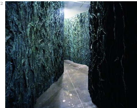
1 Untitled (Vegetation Room VII) (2000–08), resin, bronze powder and stainless steel, installation view at Galleri Andersson Sandström, Umea, Sweden 2 Untitled (Pasillo Vegetal III) (2005), 38 elements, fiberglass, polyester resin and bronze powder, 280 x 50 x 15cm 3 Toledo Project (2009): left, observatory tower fountain, and right, Iglesias' model Opposite: Detail of Double Vegetation Room (2006), resin, polyester, bronze powder and stainless steel, 385 x 600 x 420cm, currently installed in Iglesias' garden

capital's suburbs, the landscape quite suddenly opens up, and we travel across a vast plain bathed in glorious light and head towards the verdant sierra, Iglesias' home and studio complex is a short taxi ride from the small station, in a quiet residential road. As she leads me on a tour around her home, garden and the building site that will be an expanded studio, she tells me that any direct link between the dramatic, atmospheric surrounding landscape and the work she makes here is too neat. "I could do it anywhere, although I love to live here - my brother [composer Alberto Iglesias] lives nearby, and it's the place that I built with Juan," she explains. "They say that there is an energy here. I love the light, it's beautiful – it's very clear, and Madrid can appear so close." She then takes me onto a terrace with spectacular views back across the sunlit forested plain to the Spanish capital, which hovers like an oasis in the distance.