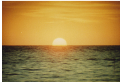
Tacita Dean, The Green Ray, 2001, 16mm colour film still, silent, 2.5 mins.

So, it's appropriate that an unprecedented trilogy of exhibitions at three of London's major institutions should take their titles from non-narrative genres traditionally associated with painting: 'Still Life', 'Portrait' and 'Landscape'. Dean describes the format as a 'useful device' inasmuch as it marks out the boundaries that her oeuvre complicates. Two examples: a portrait of Cunningham – Merce Cunningham performs STILLNESS ... (six performances, six films) (2008), in which the dancer holds his pose for the duration of each of the three movements of John Cage's 4' 33" (1952) – plays with the idea of time and movement in relation to film portraiture; and Portraits (2016), a study of Hockney in his studio that, dominated by brightly coloured textures (California orange collar, electric blue jumper, silvered hair, cigarette smoke), more closely resembles a still life. This pushing against the framework of category isn't mere contrarianism; Dean embraces constraints as catalysts to creative thought.