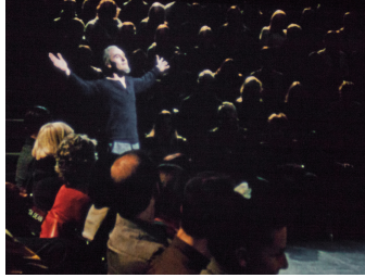
Tacita Dean, Event for a Stage , 2015, 16mm colour film still, optical sound, 50 mins. Courtesy: the artist, Frith Street Gallery, London, and Marian Goodman, London/New York/Paris

senses of the word: an impressionistic patchwork interleaving colour-filtered shots of the museum's interior spaces with images from nature, it was filmed and then projected using anamorphic lenses rotated through 90 degrees. The effect was to repurpose the 'stretched' effect of CinemaScope (familiar from the sweeping land-scapes of Westerns) for the portrait format. Projected onto a 13-metre-high white monolith, this spectacular paean to 35 mm film proposed that the medium's limitations – specifically the materiality that renders it impractical compared to digital processes, and which manifests in the texture of the image – are its inimitable strengths.