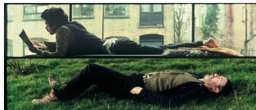
Tacita Dean, Event for a Stage , 2015, 16mm colour film still, optical sound, 50 mins.

In a less accomplished filmmaker, it would be tempting to dismiss this repeated invocation of magic as superstitious or evasive. But Dean speaks illuminatingly about her ideas and techniques, and comes to life when given the chance to speak about anamorphic lenses, the optical reduction of film gauges or the contents of her cluttered cutting table. It is only when arriving at those elusive events that animate a work of art – which are responsible for what you might call its 'click' or 'spark' – that she draws a blanket over the process, citing 'magic'. In doing so, she follows Sylvia Plath's advice in 'Admonition' (1953) – 'If you dissect a bird / To diagram the tongue / You'll cut the chord / Articulating song' – that not everything can be explained in ordinary language.