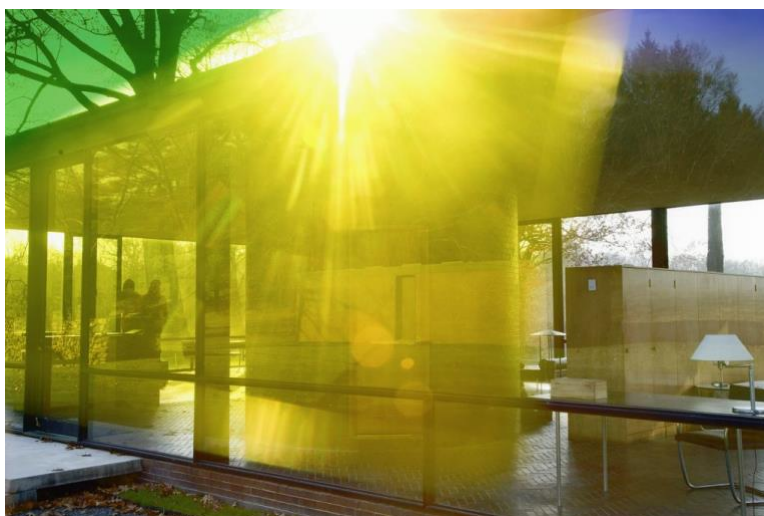
James Welling, 0818 , 2006. From Glass House Inkjet print. 33.66 x 50.5 inches. 855 x 1283 mm.

What was it that drew me to photography? Unlike the dematerialized art I'd been looking at and making, in 1976, photography was a very codified practice. There were rules and protocols. It is a medium with a history and that was appealing after what I saw as the form-lessness of conceptualism. I was an autochthonic photographer with no photographic parents, and I approached the medium with a mix of naiveté and arrogance. I was naïve about how photography worked and arrogant enough to think that I could easily bend it to my ideas. But it took about five years to find a voice with the materials photography offered. (In Search of..., 1981)