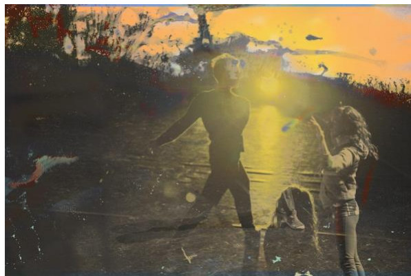
James Welling, 4600 , 2015. From Choreograph Inkjet print. 42 x 63 in. 1067 x 1600 mm.

The Centos are a digital print on plastic with oil paint applied to the surface. As such, each Cento print is a unique strike, or impression, full of imperfections, watery streaks and strange colors. This gives the work the particular vivacity I'm after.