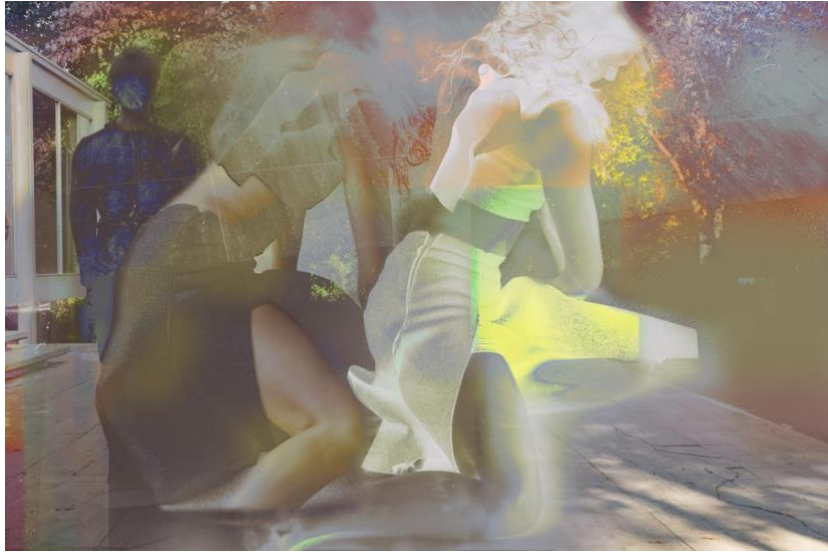
James Welling, 7477 , 2017. From Choreograph Inkjet print. 42 x 63 in. 1067 x 1600 mm.