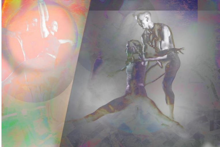
James Welling, 4073, 2017. From Choreograph Inkjet print. 42 x 63 in. 1067 x 1600 mm.

KP: What drew your attention to architecture? Do you see it as a vital component of the general landscape, or do you perceive these two as separate and independent elements that interact?