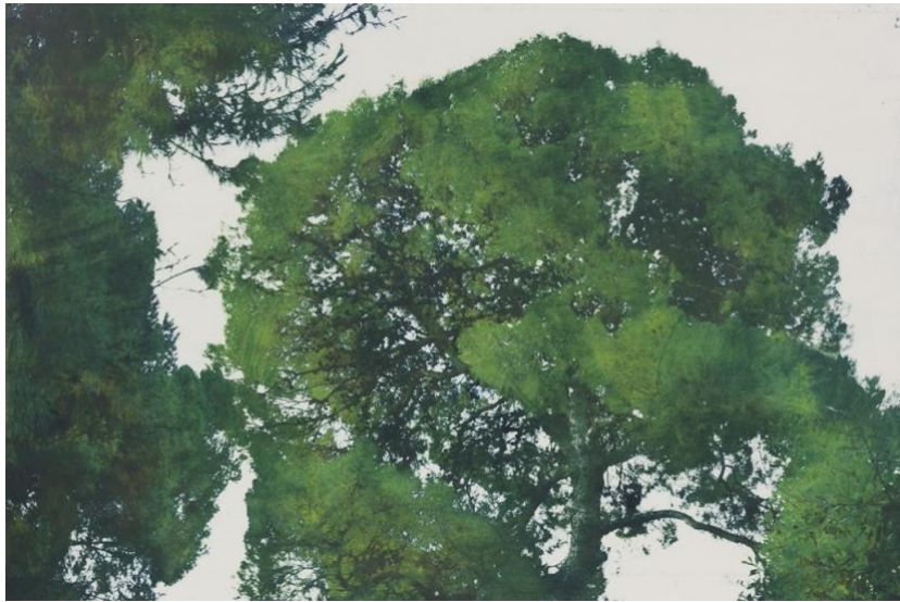
James Welling, Athens. National Garden. Aleppo Pine , 2020. From Cento . Electrostatic print with oil pigment on polyester. 11 1/2 x 17 1/4 inches. 29.2 x 43.8 cm. Courtesy Marian of Goodman Gallery