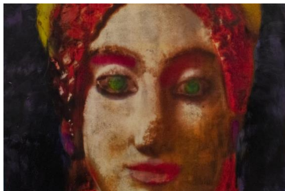
James Welling, Kore, Parian Marble . About 500 B.C. Found in 1888, southwest of the Parthenon, 2021. From Cento. Electrostatic print with oil pigment on polyester. 11 1/2 x 17 1/4 inches. 29.2 x 43.8 cm.

Today, we all use 'advanced technology' –digital cameras, computers and software, inkjet printers. But when I think about the medium, photography advances independent of technology. My Cento prints are cobbled together from research on 19th century photo processes and from a desire to make a handmade color photograph. Even though I used a digital camera and a laser printer for Cento, these tools are tangential to the conceptual energy expended to bring the project to light. Ideas, not hardware, create the future.