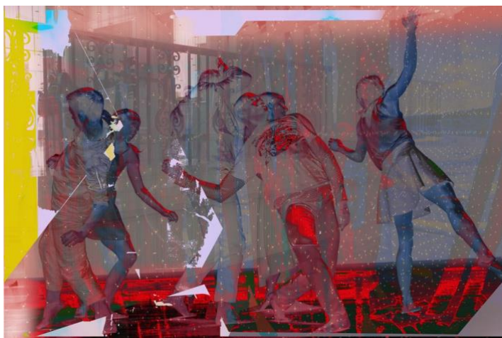
James Welling, 3693, 2017. From Choreograph Inkjet print. 42 x 63 in. 1067 x 1600 mm.

Someone once observed that my use of chance recalled the chance procedures choreographer Merce Cunningham employed to create his dances. I agree, but with a caveat: none of my Choreograph photographs were in fact random assemblages; all of the elements were, in the end, authorized even if I didn't know what the image would look like at the outset. This concurs with how I imagine Cunningham must have worked. He used chance operations to create new movement configurations that he either incorporated or rejected.