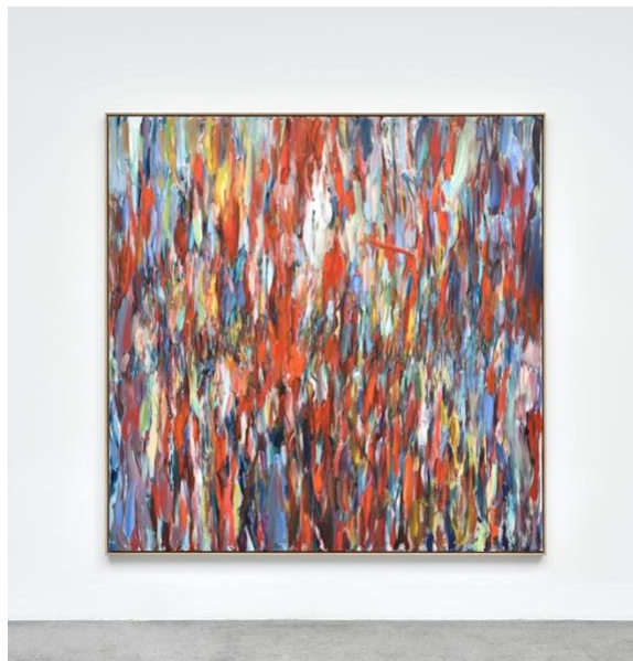
Sabine Moritz, Rain II, 2019 Oil on canvas Canvas: 78 3/4 x 78 3/4 in. (200 x 200 cm) Frame: 79 7/8 x 79 7/8 x 2 3/8 (203 x 203 x 6 cm) No. 22847

Moritz's recent exhibitions include Eden, Galerie Johann König, Berlin, Germany (2018); Neuland, Kunsthalle Bremerhaven, Germany (2017); Von der Heydt-Kunsthalle, Wuppertal, Germany (2014); Concrete and Dust, Foundation de 11 Lijnen, Oudenburg, Belgium (2013) and Lobeda, Kunsthaus sans titre, Potsdam, Germany (2011).