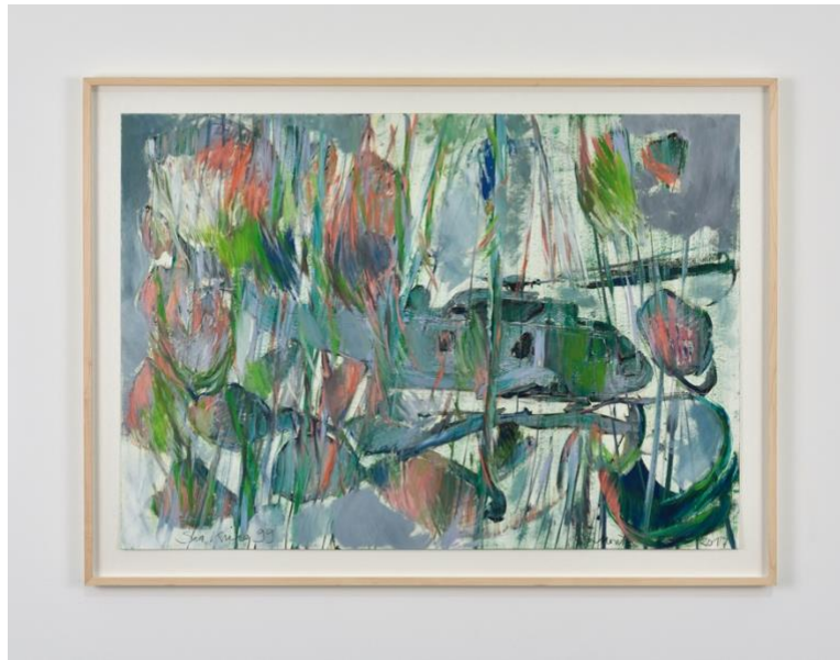
Sabine Moritz, Sea King 99, 2017 Oil on lithograph Lithograph: 22 1/8 x 31 1/2 in. (56 x 80 cm) Frame: 253/4x351/4x11/8in. No. 22970