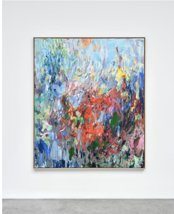
Sabine Moritz, Eden 4, 2019 Oil on canvas Canvas: 78 3/4 x 66 7/8 in. (200 x 170 cm) Frame: 79 7/8 x 68 1/8 x 2 3/8 in. (203 x 173 x 6 cm) No. 22810, Courtesy of Marian Goodman Gallery

Moritz's recent exhibitions include Eden, Galerie Johann König, Berlin, Germany (2018); Neuland, Kunsthalle Bremerhaven, Germany (2017); Von der Heydt-Kunsthalle, Wuppertal, Germany (2014); Concrete and Dust, Foundation de 11 Lijnen, Oudenburg, Belgium (2013) and Lobeda, Kunsthaus sans titre, Potsdam, Germany (2011).