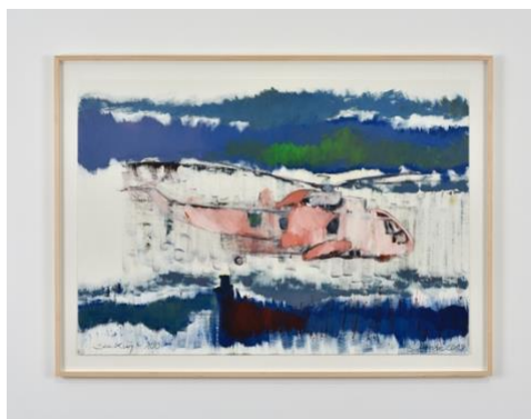
Sabine Moritz, Sea King 100, 2018 Oil on lithograph Lithograph: 22 1/8 x 31 1/2 in. (56 x 80 cm) Frame: 253/4 x 351/4 x 11/8 in. No. 22971