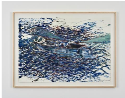
Sabine Moritz, Sea King 101, 2018 Oil on lithograph Lithograph: 22 1/8 x 31 1/2 in. (56 x 80 cm) Frame: 253/4 x 351/4 x 11/8 in. No. 22972.

SM: I felt I was missing something, red colour in particular. I started with abstract works on paper, followed by works on canvas; small ones at first and followed in turn by larger formats.