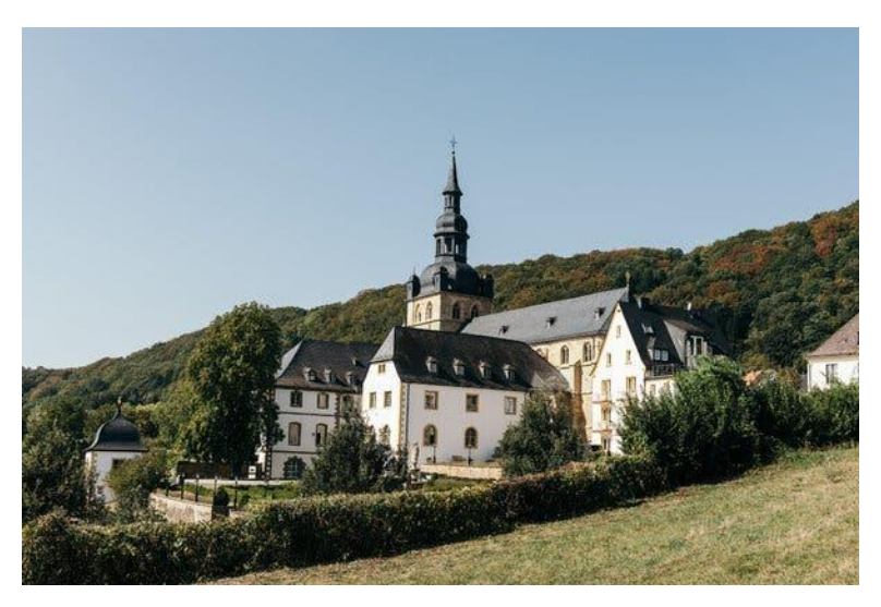
Monks have lived and worked on the Tholey Abbey site since at least the seventh century.