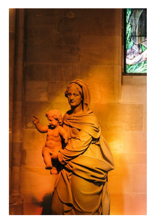
Inside the abbey church.