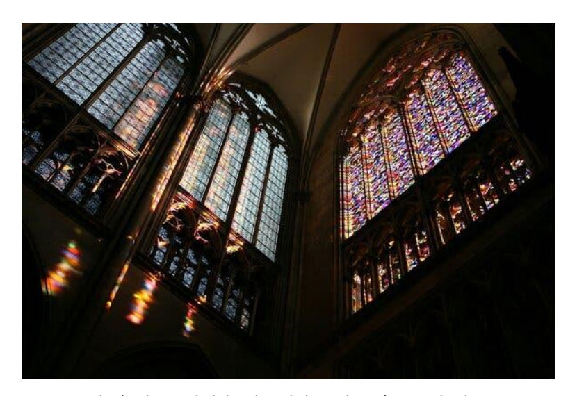
Mr. Richter's Cologne Cathedral window, which is made up of 11,263 colored squares.

These are not Mr. Richter's first church windows, however.