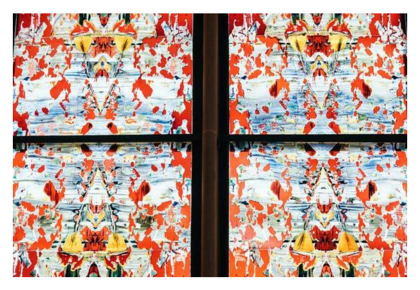
With recurring patterns and intense colors, Mr. Richter's windows resemble the design of a Persian rug.

In the days since the installation was completed on Sept. 10, the abbey's monks have been able to enjoy the windows in peace. But if all goes according to plan, that will change: The windows, at more than 30 feet tall, play a key role in the monks' plan to secure the abbey's future by turning it into a center for hospitality and education.