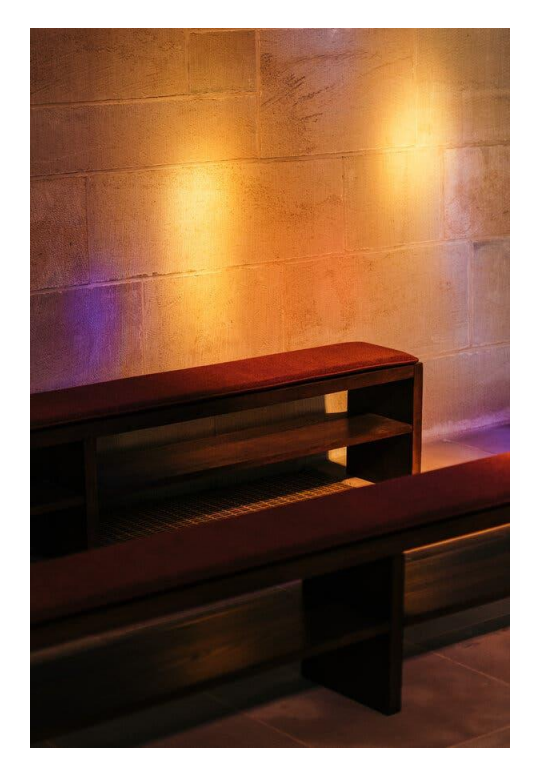
Inside the abbey church.