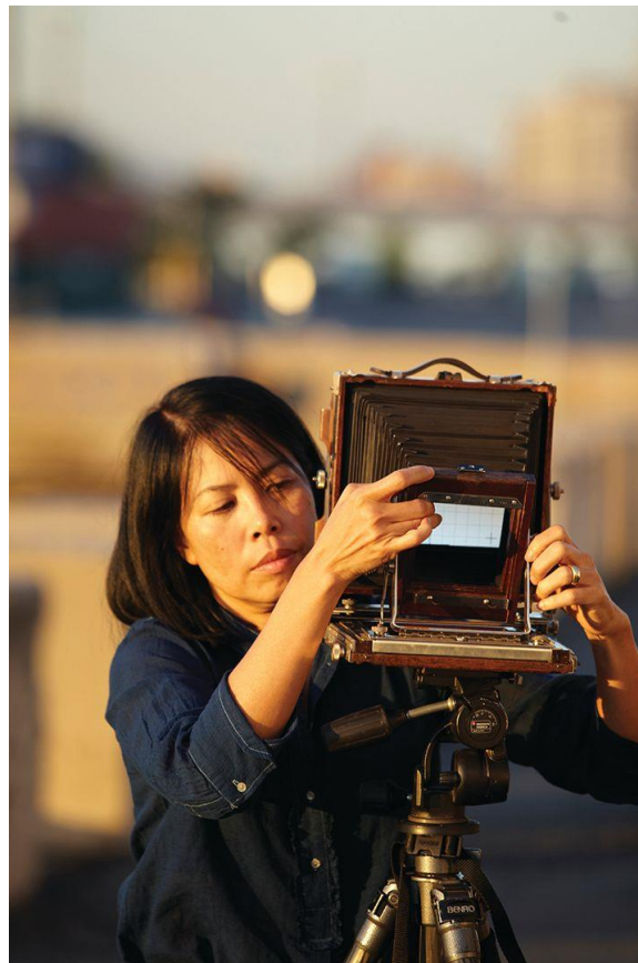
An-My Lê.

An-My Lê was born in Saigon, in war-torn Vietnam, in 1960. After an interim in Paris while her mother studied at the Sorbonne, in 1975 the family was offered a new life as political refugees in California. Lê left Saigon with her father; her mother followed months later after being lifted by helicopter from the roof of the US Embassy.