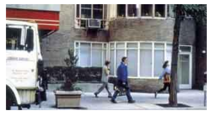
Home Run, 1993.

"That's what's really important about art," Orozco says, "the possibility to see reality differently, to see things in a new way. The objects are just vehicles for awareness."