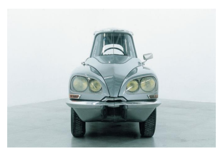
La D.S., 1993.