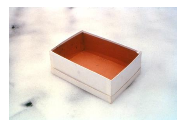
Empty Shoe Box, 1993.

This counterintuitive approach has made Orozco one of the most celebrated artists of his generation, widely praised for his cryptic and deceptively low-key touch. One of his most famous pieces is a photograph of condensation from his own breath on a grand piano; another depicts the ephemeral trails left by his bicycle tires passing through a puddle. He's made mobiles from dryer lint and from ribbons of toilet paper suspended from ceiling fans. For one major European art fair in 1993, Orozco showed a piece titled Empty Shoe Box . (The real challenge of creating that work, he later said, was replacing the boxes when the custodial crew repeatedly tossed them out with the garbage.)