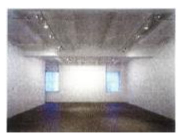
Yogurt Caps, 1994.