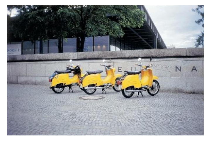
Until you find another, 1995.

Oddly, whatever the medium, Orozco's pieces all feel exactly like Orozcos. But then, in a way, so does everything else. Spend a little time around the artist's work, and you begin to have the odd sensation of seeing it all around you. You notice things. I'm not sure how long the effect lasts, but after poring over his catalogs, struggling through a stack of dense scholarly essays and passing a pleasant morning with the artist himself, I find I can't walk a block without having an Orozco Moment. I spot a motor scooter locked up beside a lamppost and am reminded of a chained animal, of the potential for speed and escape, of a reclining figure by abstract sculptor Henry Moore. (Only later do I remember that Orozco has also used scooters in his work, in a 1995 piece comprising 40 photographs of the artist's own yellow scooter parked next to identical bikes he encountered around Berlin.) I notice a section of construction fencing, a half-deflated birthday balloon, the contents of a trash can—everyday fragments of city life, all suddenly pregnant with meaning.