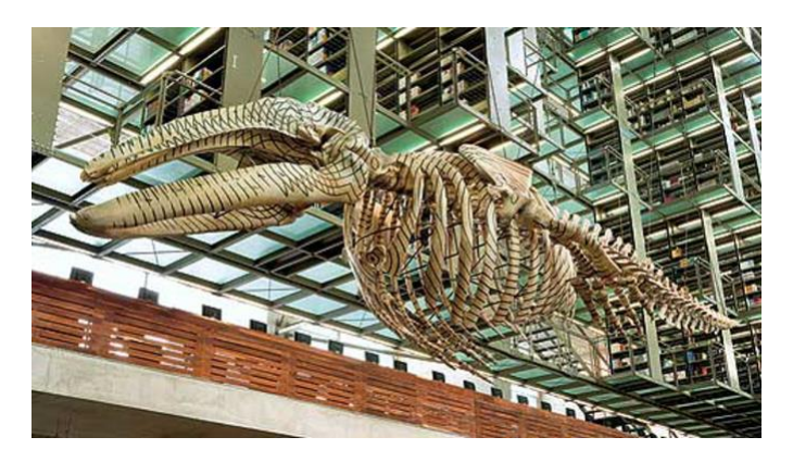
Mobile Matrix, 2006.