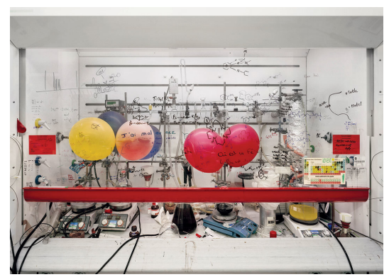
Thomas Struth, Chemistry Fume Cabinet, the University of Edinburgh, 2010, C-print, 47 1/2 \times 65 \ 3/8 ".

In "Nature & Politics," Struth presents concretizations of just this condition: He pictures the age of the world picture, the shape of human thought itself. The achievement of his images is to realize an interweaving of the technological and the aesthetic not in the form of celebratory beautification—"the art of science," as it were—but by isolating and distilling, with an undogmatic eye, both the world-making force and the meticulous imaginative drive instantiated in the devices and environments he shows.