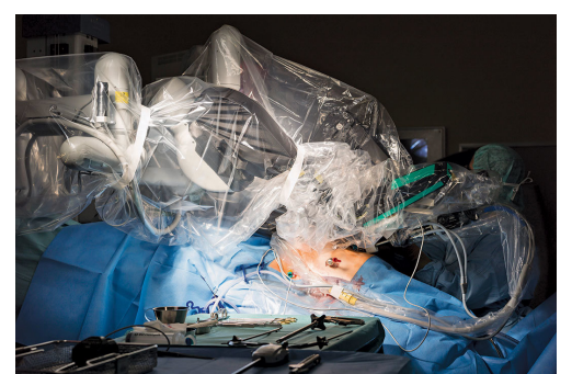
Thomas Struth, Figure, Charité, Berlin, 2012, ink-jet print, 35 1/4 × 51 3/4".

Such details highlight the inevitable mismatch between objective plan and subjective experience, nowhere more powerfully than in Chemistry Fume Cabinet, the University of Edinburgh , 2010. Here is a mix of mad scientists' equipment and funfair balloons, all contained within a protective case whose glass front is covered in hand-scrawled structural formulas and graffiti: j'ai mal au nez (my nose hurts) at center; an almost alphabetical list of countries that begin with U at lower left. A guiding throughline of "Nature & Politics" is literally writ large in these notations. They are reminders of the ever-present material excesses and imperfections—above all, those of the body's own processes and desires—that lurk at the heart of technological reason.