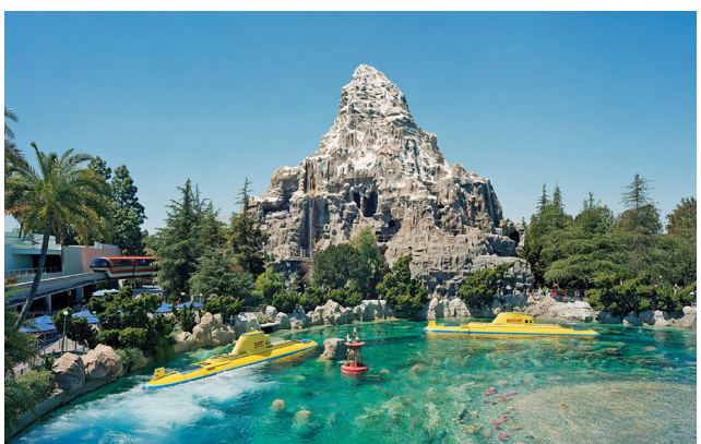
Thomas Struth, Mountain, Anaheim, 2013, C-print, 6' 11 1/2" × 10' 10 7/8".

Thyssenkrupp Steel, Duisburg—showing a still—operational plant that opened amid West Germany's postwar "economic miracle"—echoes Das Eisenwalzwerk (Moderne Cyklopen) (The Iron-Rolling Mill [Modern Cyclops]), 1872–75, Adolph Menzel's iconic image of early industrial labor.<sup>4</sup>