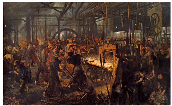
Adolph Menzel, Das Eisenwalzwerk (Moderne Cyklopen) (The Iron-Rolling Mill [Modern Cyclops]), 1872-75, oil on canvas, 62\ 1/4 \times 100 ".

Stellarator Wendelstein 7-X Detail, Max Planck IPP, Greifswald is from the artist's series "Nature & Politics," 2007—, currently on view in an exhibition at the Fondazione mast in Bologna, Italy. Beginning with shipyards and massive apartment districts, the series has expanded to include research labs, Disneyland, industrial production sites, and medical procedures and spaces: In all cases, environments and devices that have been built to ensure their individual parts produce a specific end effect, from mass housing and entertainment to carefully calibrated chemical reactions. The images, we could say, are tableaux of human intentionality as fueled by the entwined capacities of organizational ingenuity and means-end rationality. And because these human faculties find their most concentrated amalgam in high-tech instrumentation, it is technology that dominates the series—in whose structures and spaces, Struth suggests, we witness nature and politics' most powerful coalescence.