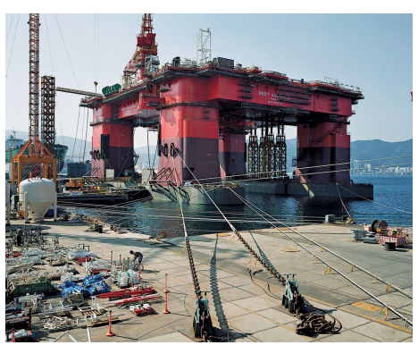
Thomas Struth, Semi Submersible Rig, DSME Shipyard, Geoje Island, 2007, C-print, 9' 2" × 11' 5 3/8".

warning notices, myriad bits of tape and bubble wrap, and a forlorn glove awaiting its user; beneath Ulsan's housing monoliths, we spot piles of trash and ramshackle shops; and in his stunning Semi Submersible Rig, DSME Shipyard, Geoje Island, 2007, one of the series' earliest works, we are confronted with an overwhelming array of pictorial incident on and around its monumental titular apparatus—most notably, the elaborate foreground weave of cables and chains, which both diagrams the picture's own perspectival construction and challenges the most sophisticated linear abstraction, from László Moholy-Nagy to Tomás Saraceno.