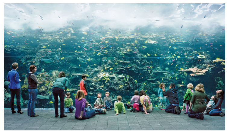
Thomas Struth, Aquarium, Atlanta, 2013, C-print, 6' 9 3/4" × 11' 8 1/2'

cationers at Disneyland; lab workers in their white uniforms ( Pharmaceutical Packaging, Laboratorios Phoenix, Buenos Aires, Argentina , 2009); two men messing with their bikes amid the foreground clutter of Semi Submersible Rig, DSME Shipyard, Geoje Island . And in one anomalous photograph, Aquarium, Atlanta, 2013, Struth makes a gaggle of kids and parents his explicit subject, capturing them before a transparent wall of fish whose various positions, sizes, interactions, and colors mimic those of the assembled crowd. A clear cousin of Struth's earlier museum studies ("Museum Photographs," 1989–2005), the aquarium photograph finds Struth shifting his focus from culture to nature—or more precisely, to nature as culture, put on display and ready to hand.