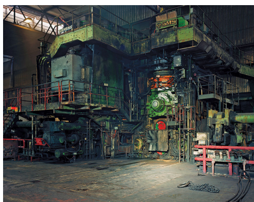
Thomas Struth, Hot Rolling Mill, Thyssenkrupp Steel, Duisburg, 2010, C-print, 71 1/4 × 83 1/2".

(as well as beauty), and that if no one person can tell me just what every element here is doing, some assemblage of human knowledge has managed to develop, construct, and put to use this overwhelmingly intricate device. And the research it makes possible, I suspect, may very likely have profound effects for life on earth.