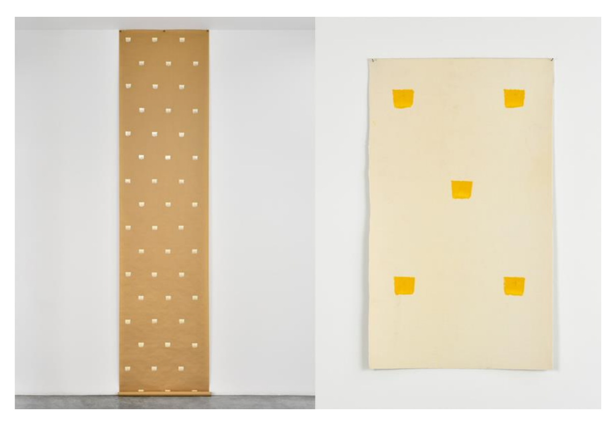
Left: Niele Toroni – Imprints of paintbrush no. 50 repeated at regular intervals of 30 cm, 1993. White acrylic on kraft paper roll, 185 x 39 5/16 in, 470 x 100 cm / Right: Niele Toroni – Imprints of paintbrush no. 50 repeated at regular intervals of 30 cm, 2015. Yellow acrylic on oilcloth, 33 5/8 x 19 7/8 in, 85.5 x 50.5 cm

En Passant – Niele Toroni Exhibition at Galerie Marian Goodman Paris Although Niele Toroni's imprints cover the walls of many European institutions, such as Castello di Rivoli in Turin, Hamburger Banhof Museum für Gegenwart in Berlin and Musée des Beaux-arts in Lyon, Paris is still the closest to his heart, as his first travail/peinture saw the light of day at the Salon de la Jeune Peinture in the Musèe d'Art Moderne de la Ville de Paris. One of his patterns was also painted over the museum entrance, in 2001, and the institution hosted a show of his only recently, in 2015. Now, Niele Toroni's En Passant exhibition opened on March 5th at Galerie Marian Goodman in Paris, France. It will stay on view through April 16th, 2016 .