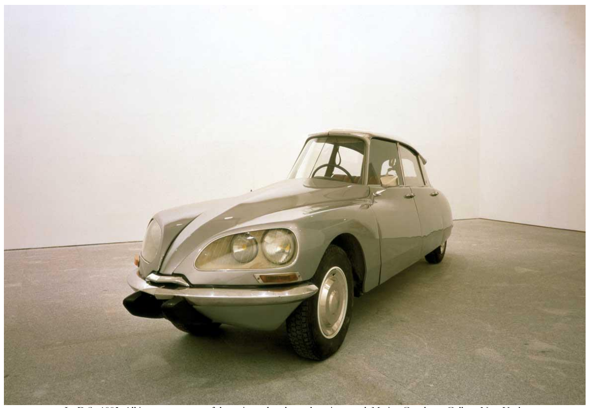
La D.S., 1993.

Lyricism and humor. Who hasn't seen one of Gabriel Orozco's works? A Citroën sliced lengthwise into three long pieces, then reassembled without the middle part (La D.S., 1993, on exhibit at the Beaubourg in Paris). A ping-pong table made of four courts and a small pond in the middle (Ping Pond Table, 1998). A small billiards table that functions as a pendulum (Oval with Pendulum, 1996). Full-size pianos with two keyboards (Mother, 1998). Ribbons of toilet paper suspended from a ceiling fan (Toilet Ventilator, 1997–2001). An elevator, outside its shaft, situated in a room (Elevator, 1994). A ball of modeling clay that was rolled through a city and picked up trash as it went, the marks left in it forming a sort of urban fingerprint (Yielding Stone, 1992). Reconstructed chessboards with varied proportions, their pieces strangely arranged (Horses Running Endlessly, 1995).