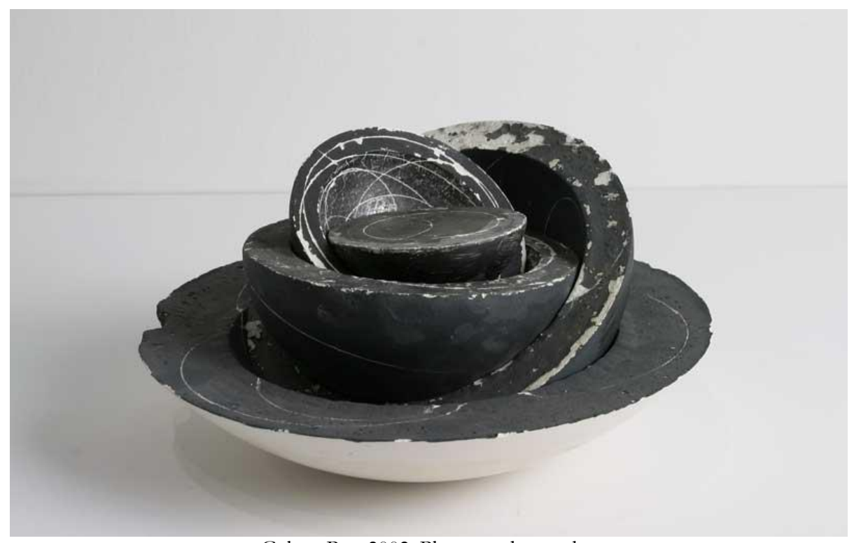
Galaxy Pot, 2002. Plaster and gouache.

So I have been intrigued by public art since my childhood, but I've also had a desire to free myself from the clichés of Mexican public art, without falling into the spiel, if you will, of abstract intimicism, isolated from all reality.