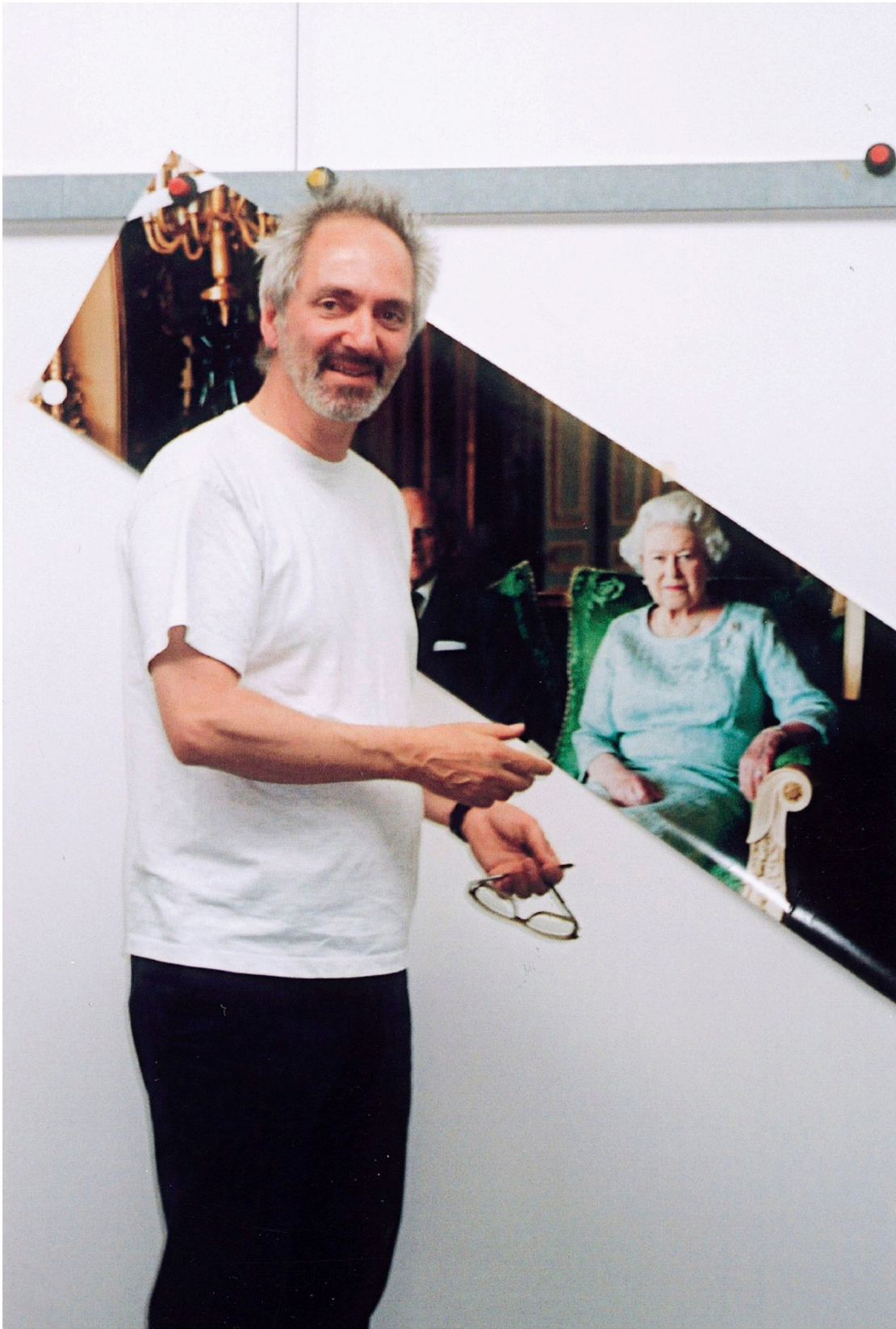
Struth, photographed by the author, at the Grieger printing lab, in front of a test strip of his portrait of the royal couple.

As Struth and I were looking at another big picture, and he was pointing out something in its foreground, a museum guard suddenly materialized and told him that he was standing too close and should step back behind a line on the floor. Struth did not say, “I took that picture,” but obediently stepped back behind the line. A little further into our tour of the show, the guard—a small