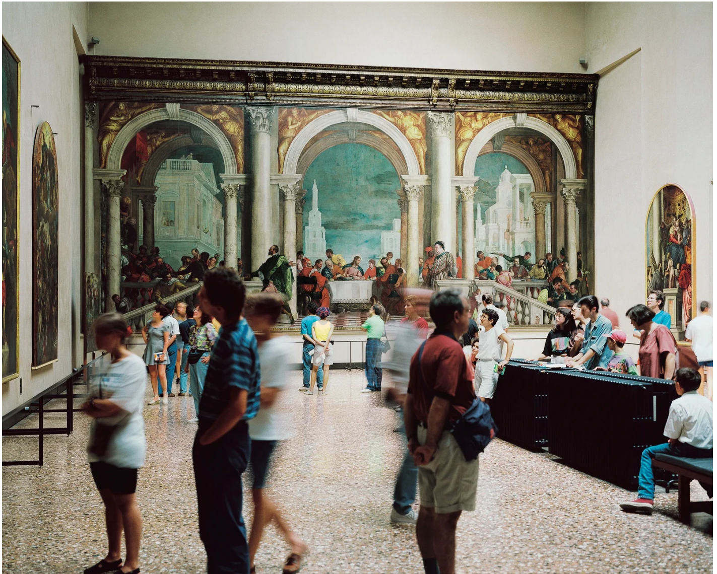
“Galleria dell’Accademia I” (1992) shows museum visitors standing in front of Veronese’s “Feast in the House of Levi.”

Struth went on to contrast the beloved, haimish Bechers, whose classes were often held at their house or in a Chinese restaurant, with the “much more difficult to deal with” Gerhard Richter: “Gerhard was very ironic. I never had the feeling that he is someone who speaks naturally or openly. He was friendly, but you never knew what he really meant. It was very coded language and coded behavior.”